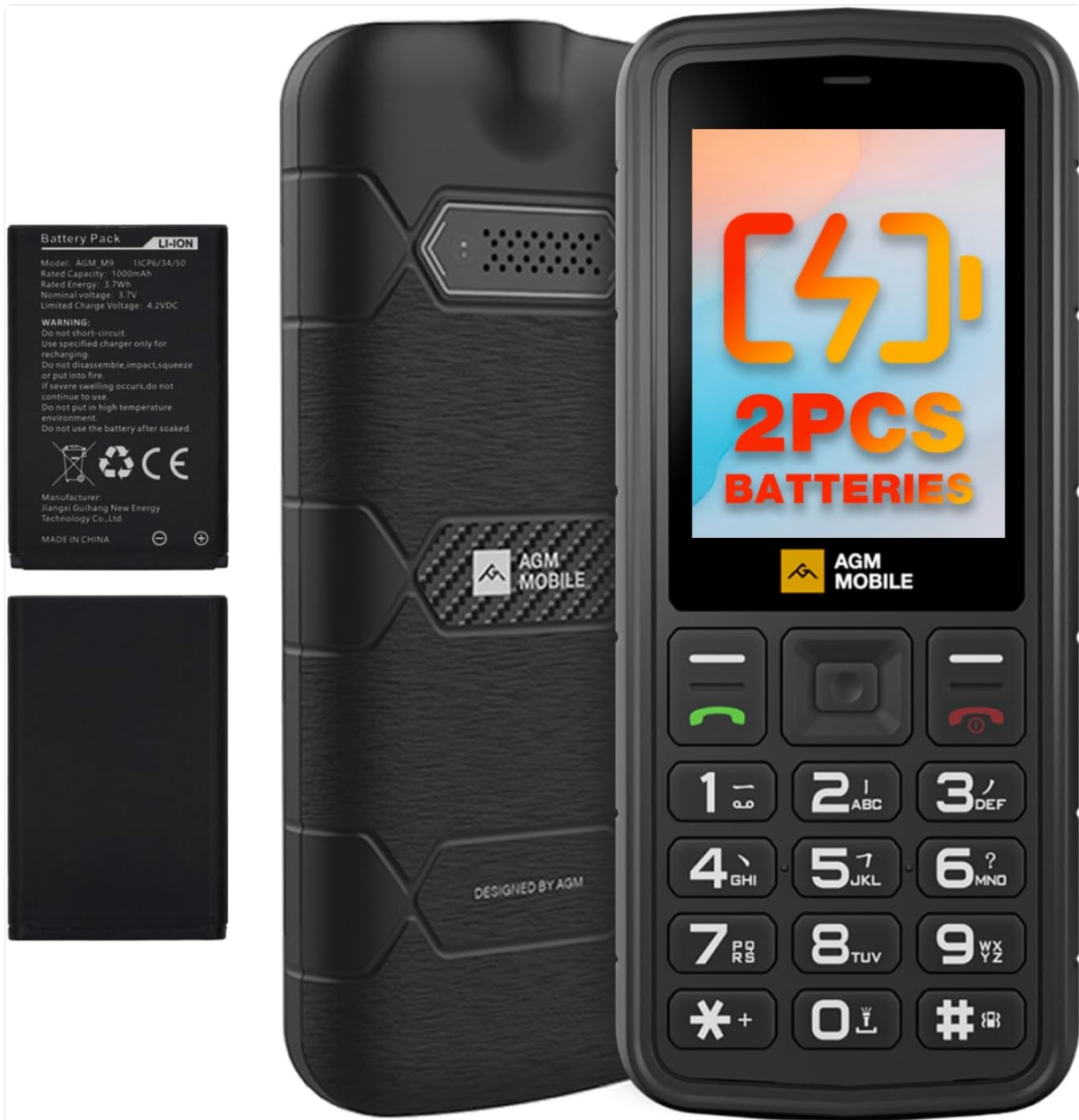
Image: The AGM M9 phone shown alongside its two included 1000mAh replaceable batteries.