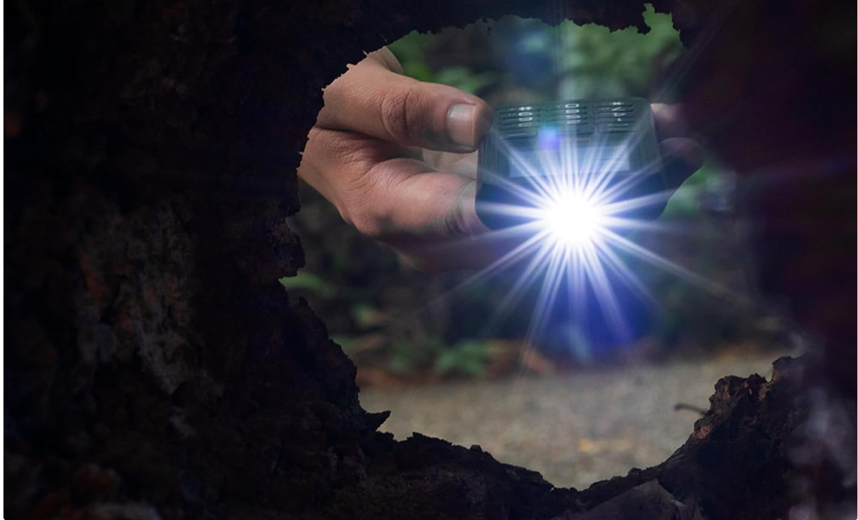
Image: The phone's powerful flashlight in use, providing illumination in a dark setting.

You never know when you will need one, better to have it easily accessible and ready at anytime.