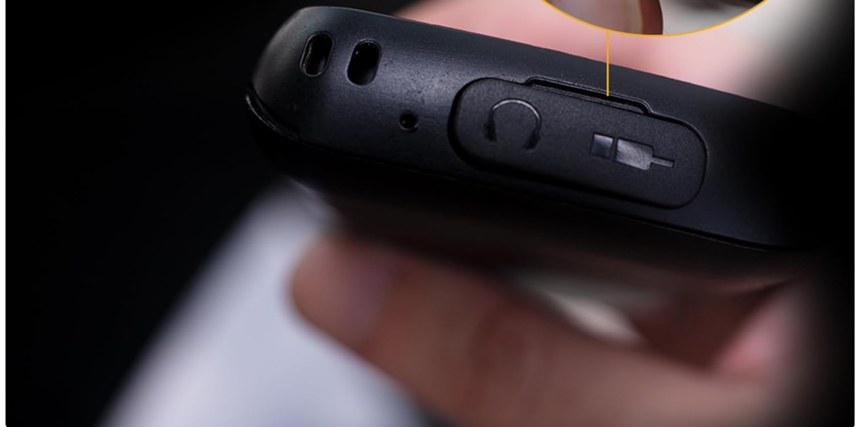
Image: The phone's 3.5mm audio jack and charging port, indicating options for wired and wireless audio.