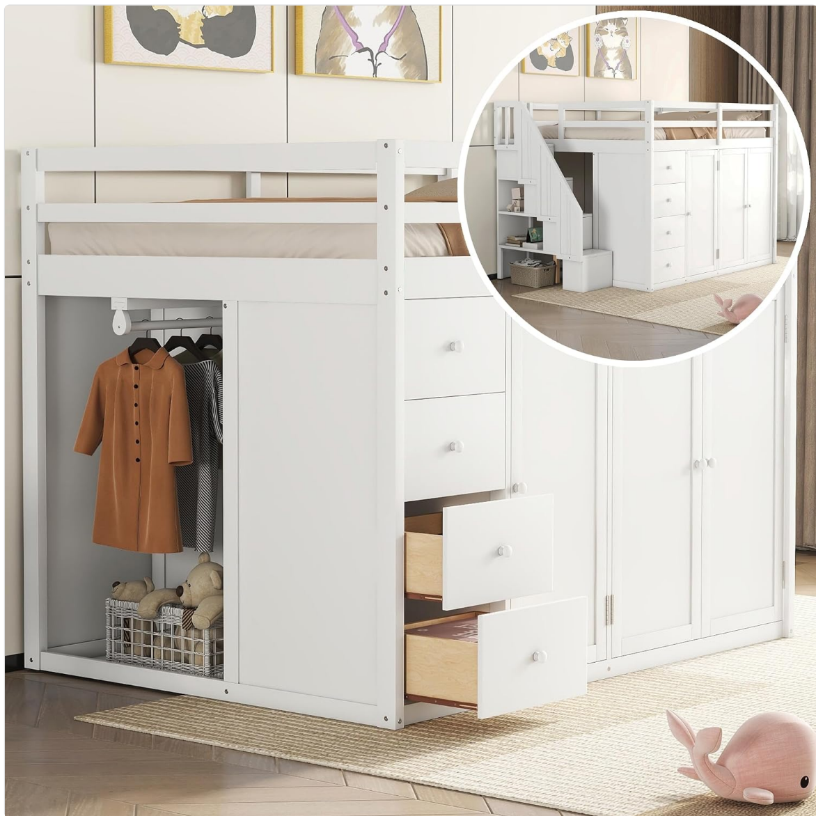
Image: Overview of the Harper & Bright Designs Full Loft Bed, showcasing the integrated storage drawers and open wardrobe section.