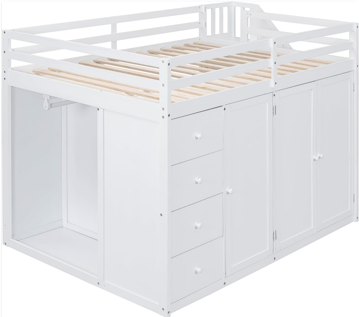
Image: View of the loft bed from an angle, showing the staircase positioned on the right side, and the various storage units.