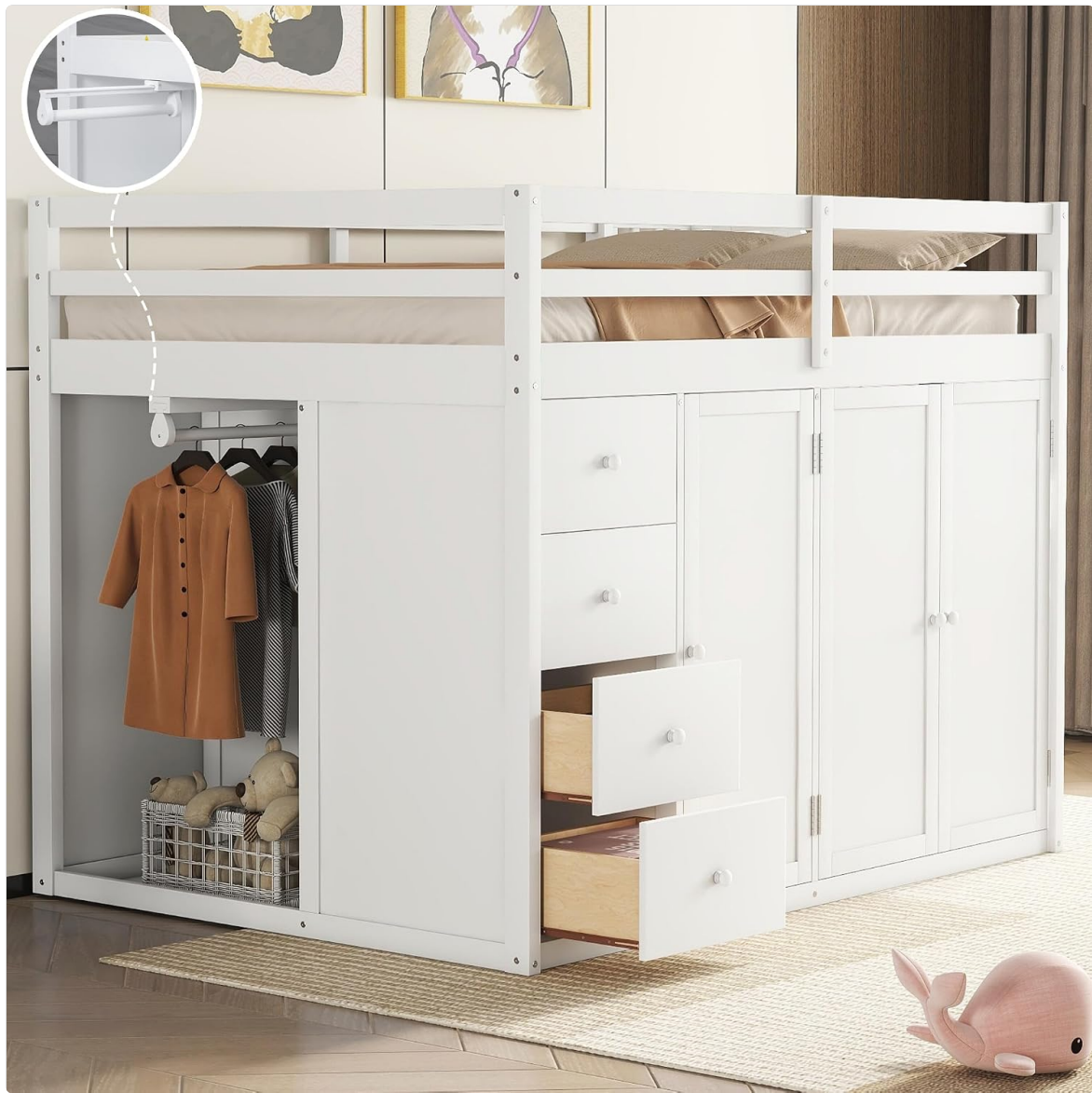
Image: Close-up view of the loft bed's open wardrobe, featuring a retractable hanging rod for clothing storage.