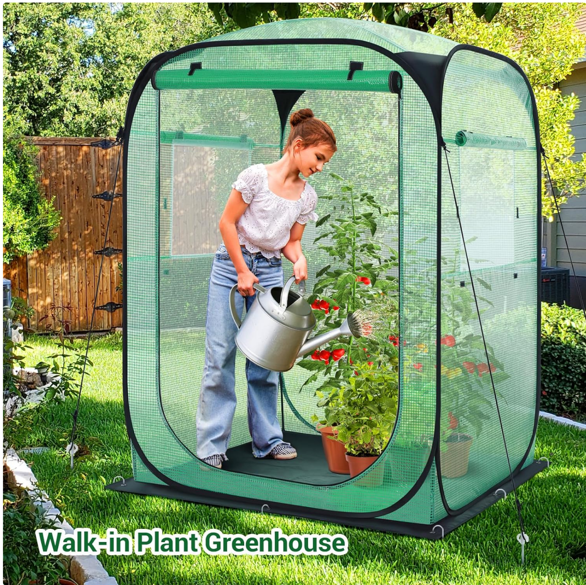
Image: A person watering plants inside the spacious Ohuhu Pop Up Greenhouse.