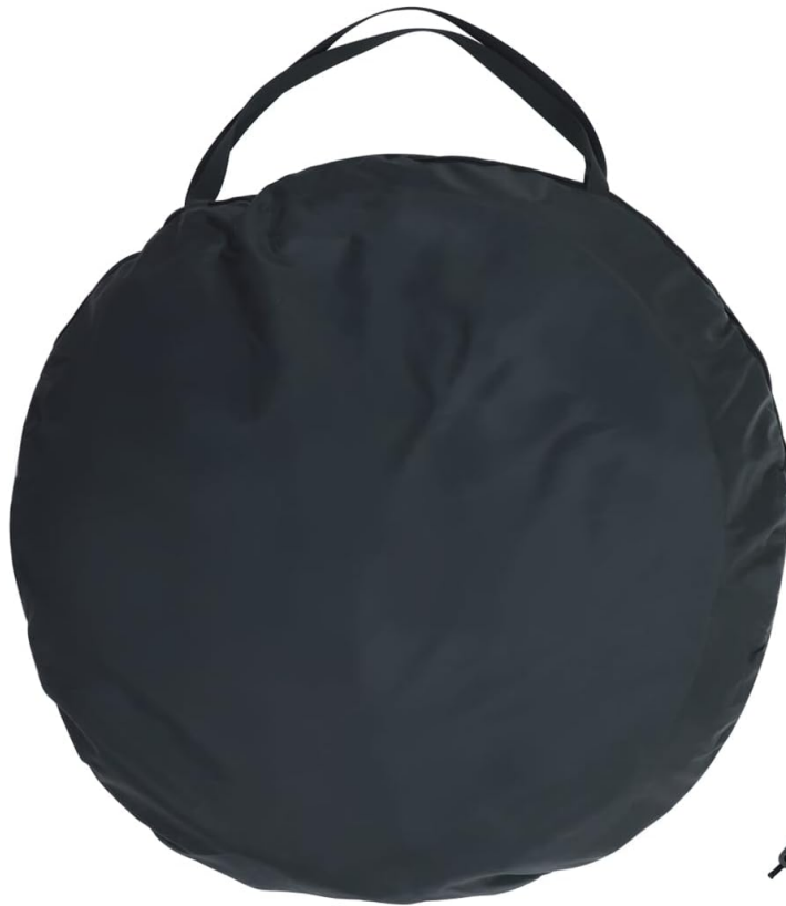
Green House packing