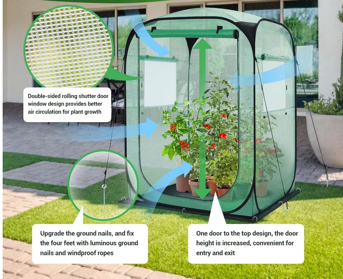
Image: Illustration of ground stakes for stability and mesh windows for air circulation.