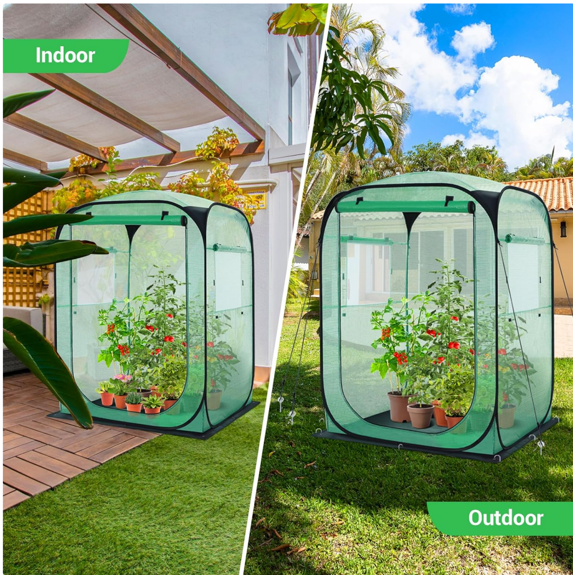
Image: The greenhouse shown in both indoor and outdoor settings, demonstrating its versatility.