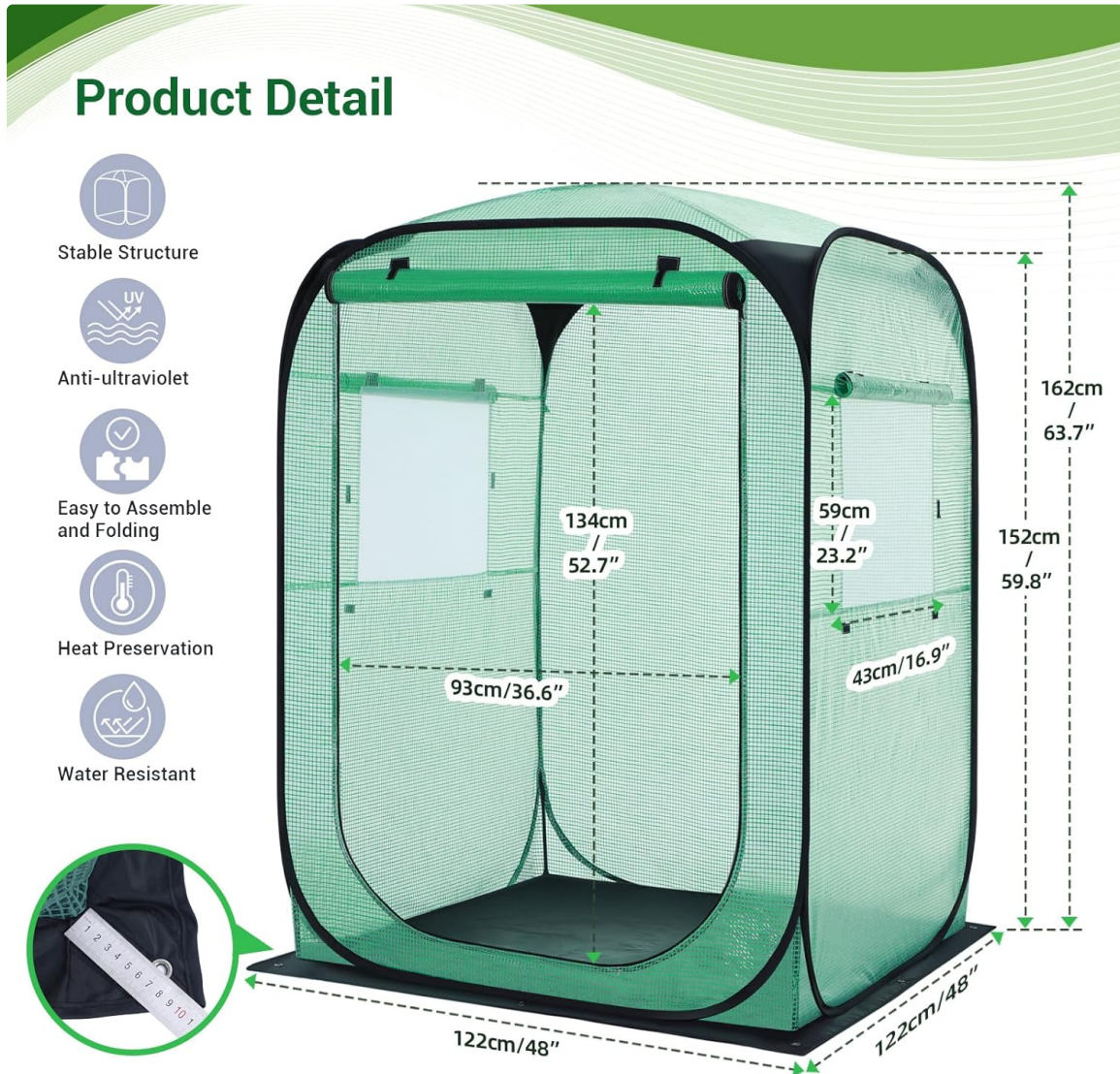
Image: Detailed dimensions of the Ohuhu Pop Up Greenhouse.