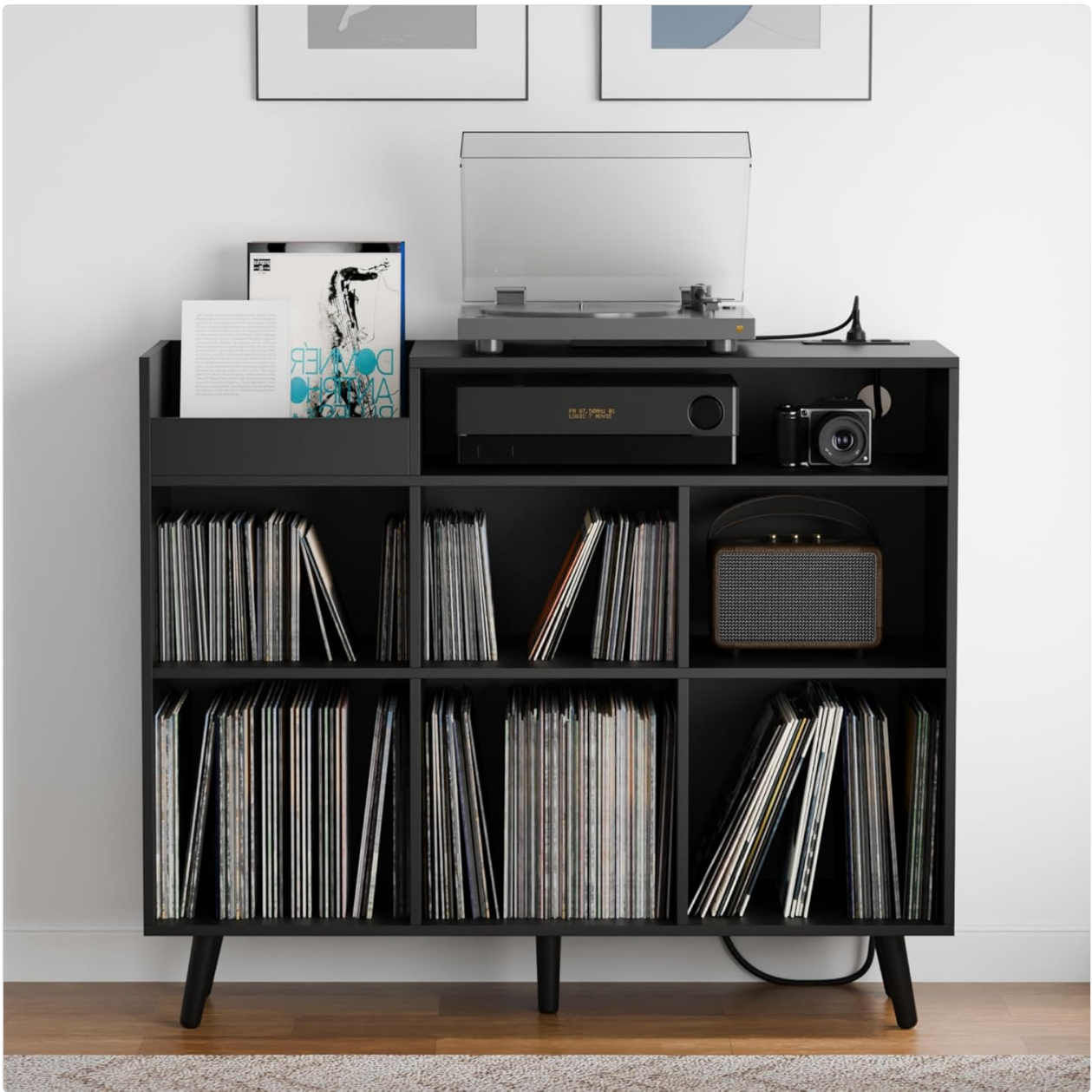
Figure 1.1: The Cozy Castle Large Record Player Stand, fully assembled and in use, showcasing its storage capabilities for vinyl records and audio equipment.