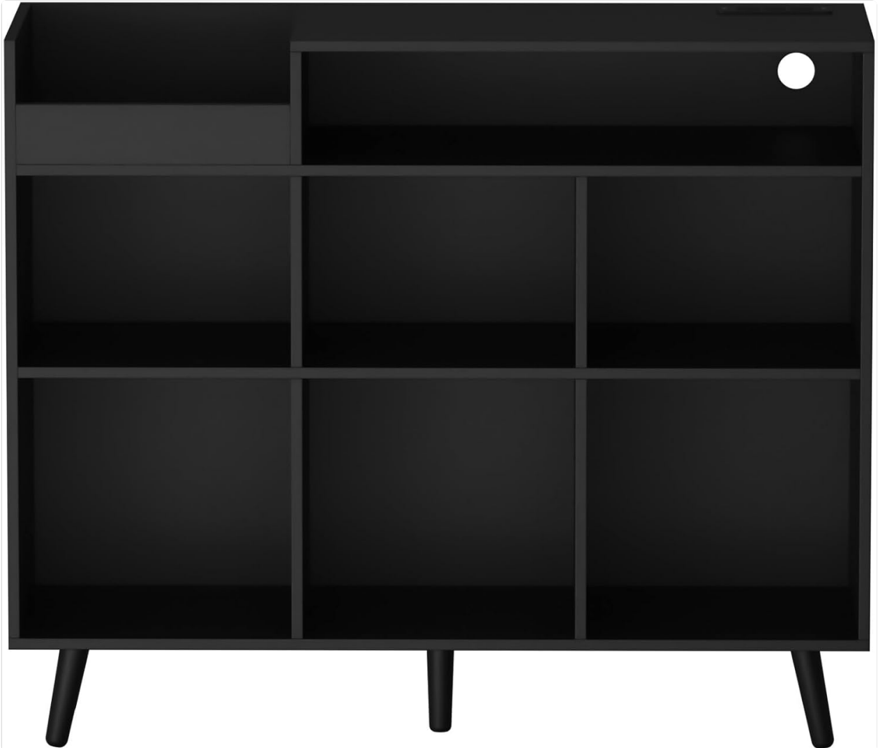
Figure 3.1: The main structure of the record player stand, empty, illustrating the various compartments and overall design.