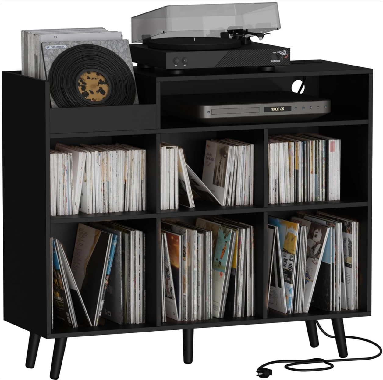
Figure 5.1: The stand configured with a record player, amplifier, and various media, highlighting its functional design.