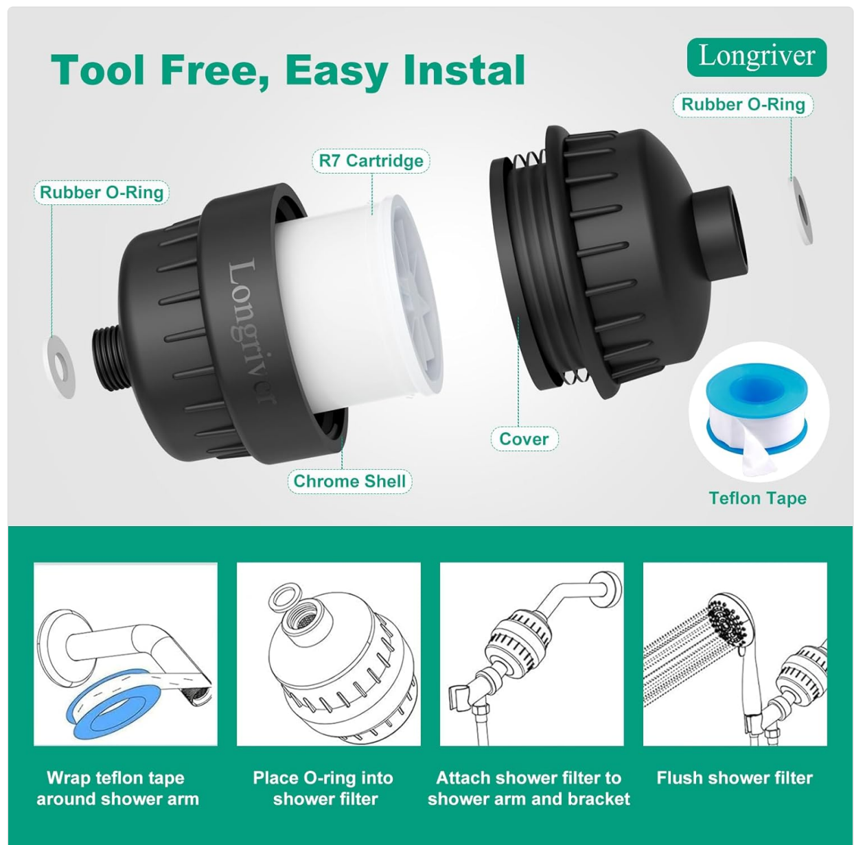
Image: A visual representation of the shower filter components, including the main unit, internal cartridge, O-rings, and plumber's tape, ready for installation.