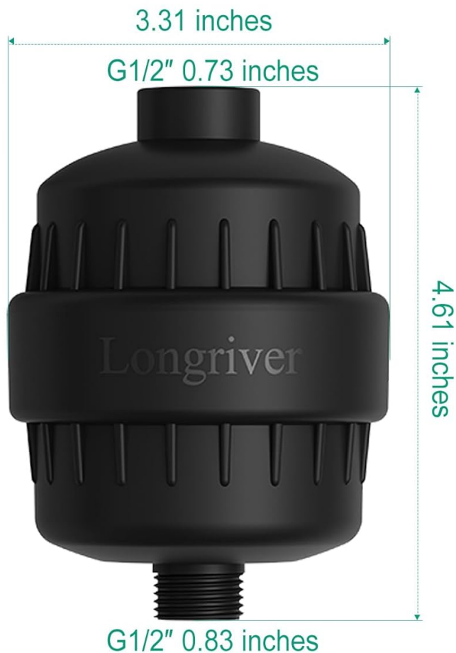
Image: The Longriver R7 Shower Filter is shown to be compatible with most standard showerhead types, including rain, fixed, and handheld models.