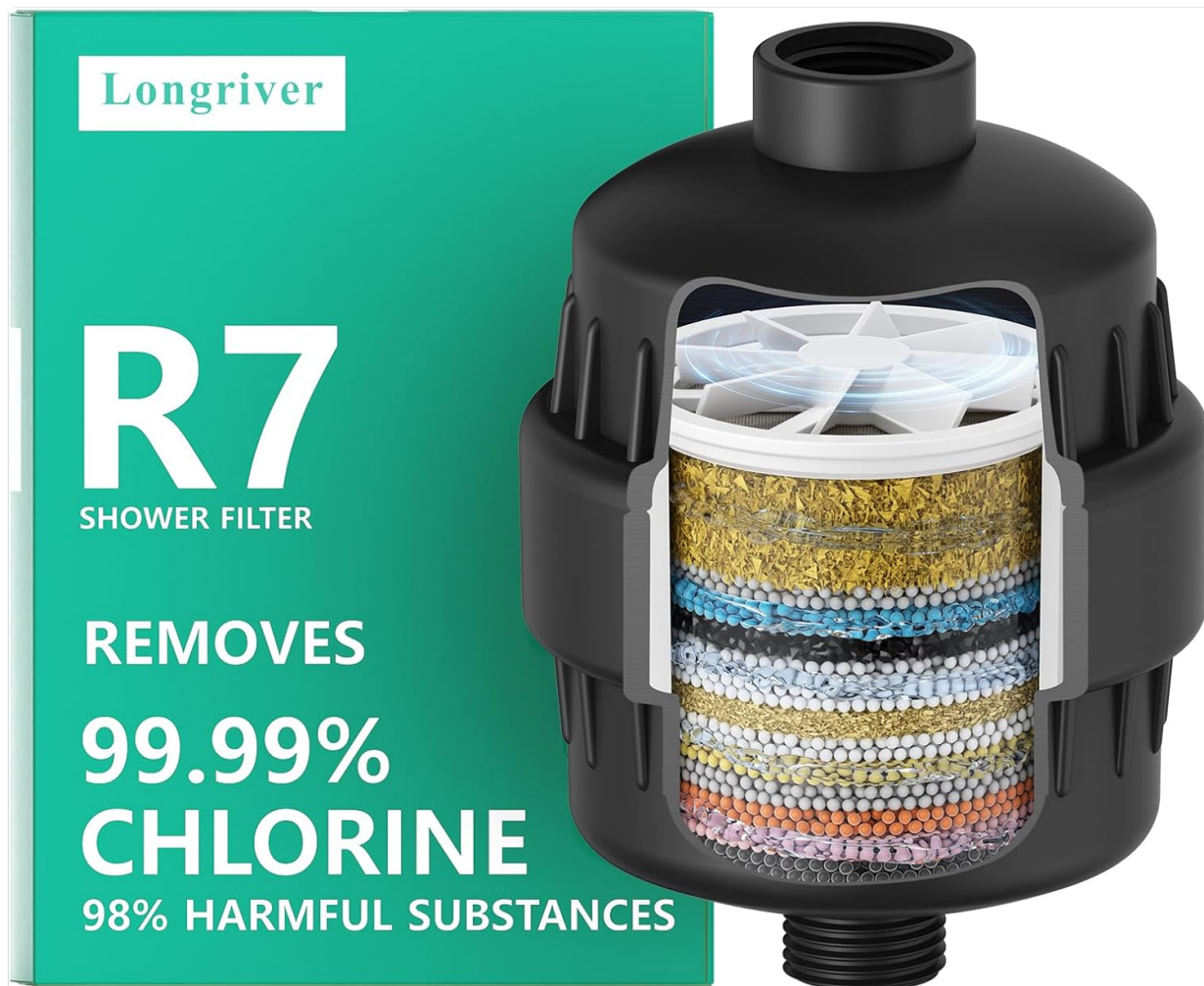
Image: The Longriver R7 Shower Filter in black, with its green packaging, highlighting its chlorine removal

The Longriver R7 Shower Filter is designed to enhance your showering experience by significantly improving water quality. This filter effectively removes harmful substances, contributing to healthier skin and hair. It is engineered for easy installation and compatibility with standard shower systems.