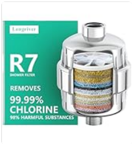
Image: A detailed view of the R7 filter cartridge, illustrating its internal multi-stage filtration media designed to purify water.