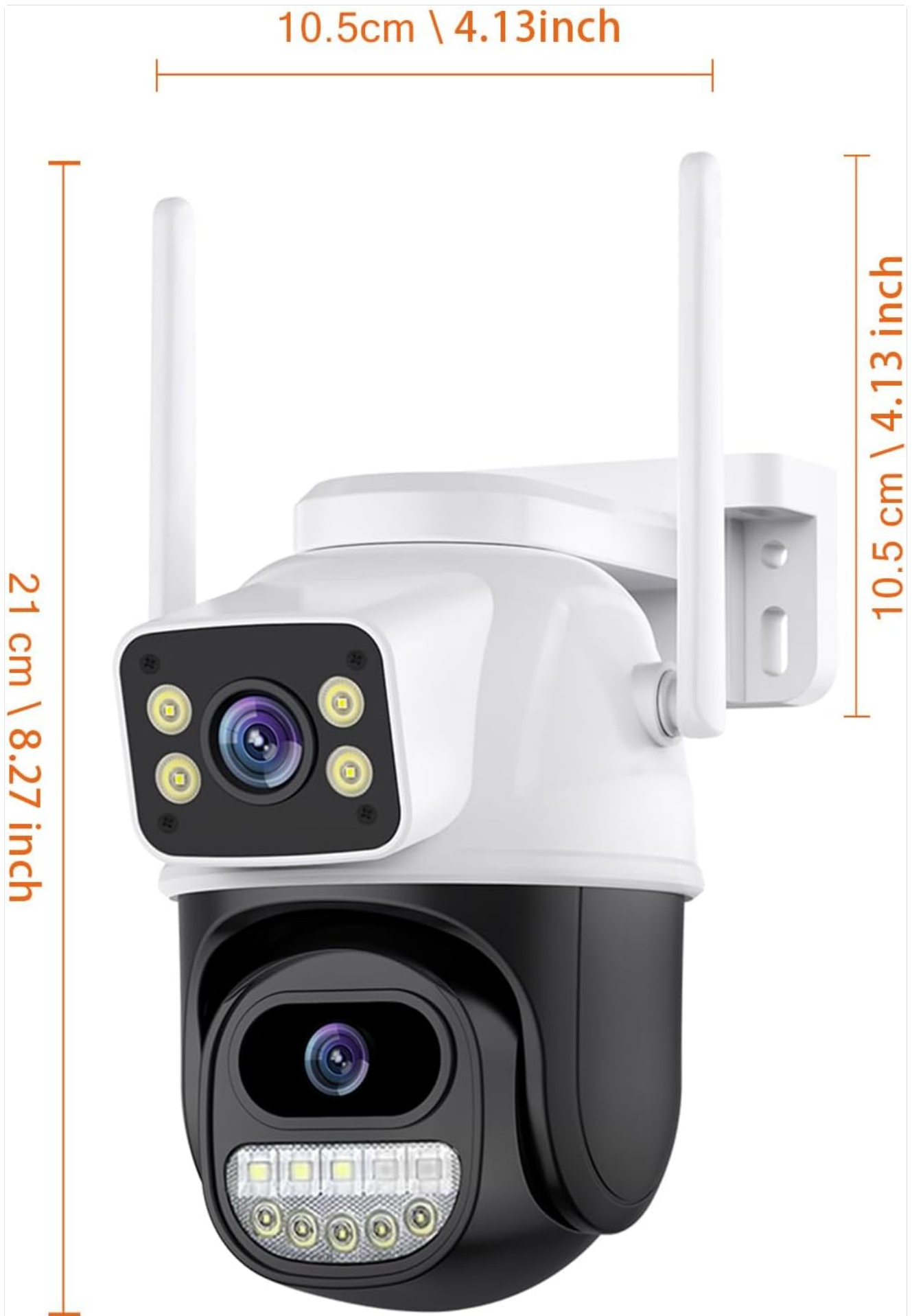
Figure 2: AbecxEye A33 Security Camera Dimensions. This image illustrates the physical dimensions of the camera, showing its height of 8.27 inches (21 cm) and width of 4.13 inches (10.5 cm).