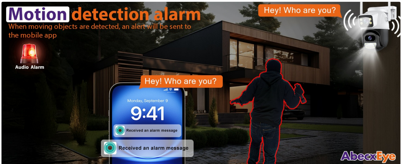
Figure 10: Two-Way Audio Functionality. This image illustrates the camera's two-way audio feature, allowing real-time communication with individuals in the camera's vicinity, such as a delivery person.

Use the two-way audio feature to communicate with individuals near the camera, such as delivery personnel or visitors.