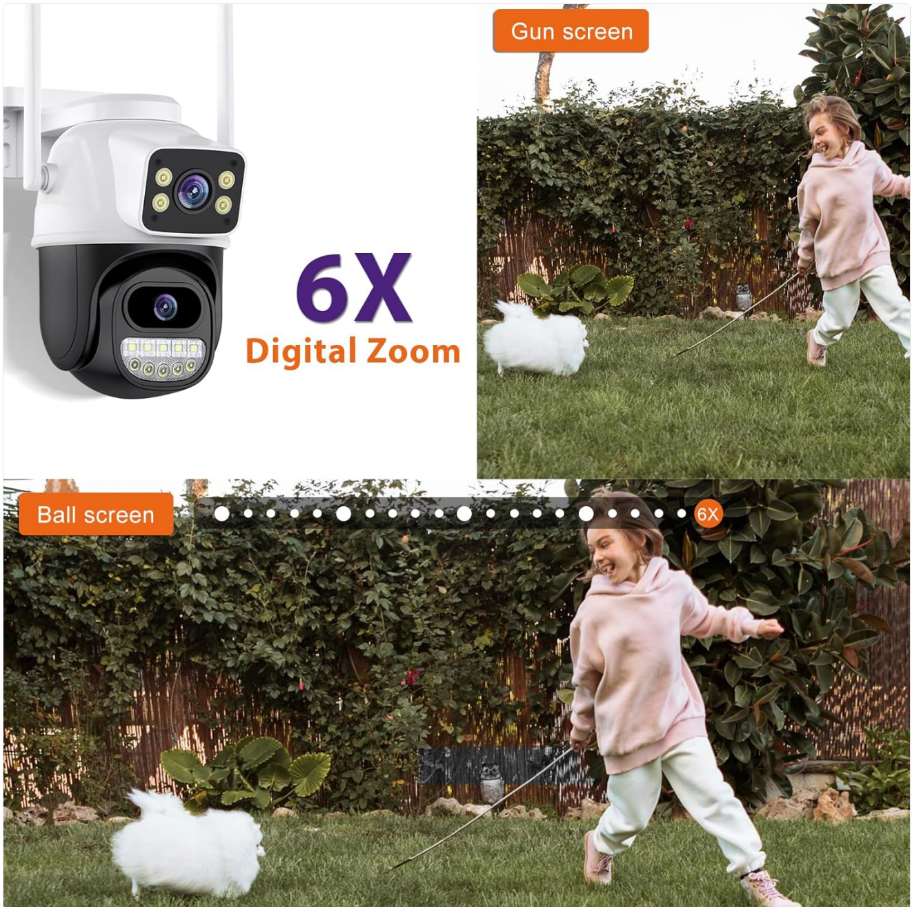
Figure 11: 6X Digital Zoom. This image demonstrates the camera's 6X digital zoom capability, allowing users to magnify specific areas of interest within the camera's field of view.