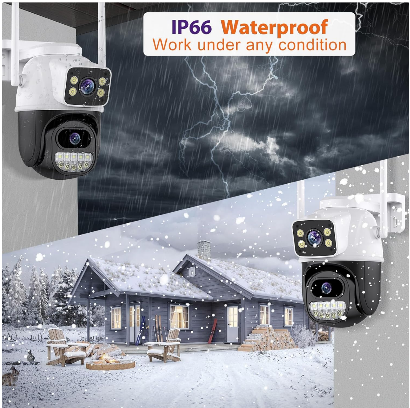
Figure 4: IP66 Waterproof Feature. This image demonstrates the camera's durability in various weather conditions, including rain and snow, highlighting its IP66 waterproof rating.

For optimal performance, ensure the camera is positioned to cover the desired area effectively. The mounting bracket allows for flexible positioning.