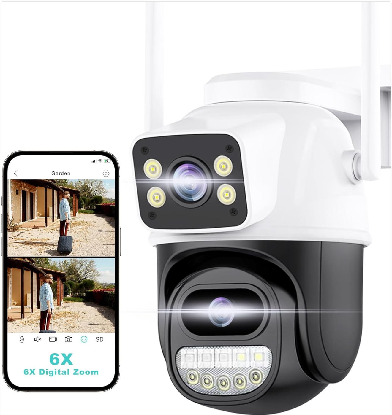
Figure 1: AbecxEye A33 Security Camera. This image displays the camera's main body, including its dual lenses, LED lights, and two external antennas, alongside a mobile phone interface showing the dual-screen view.

Familiarize yourself with the physical components of your camera: