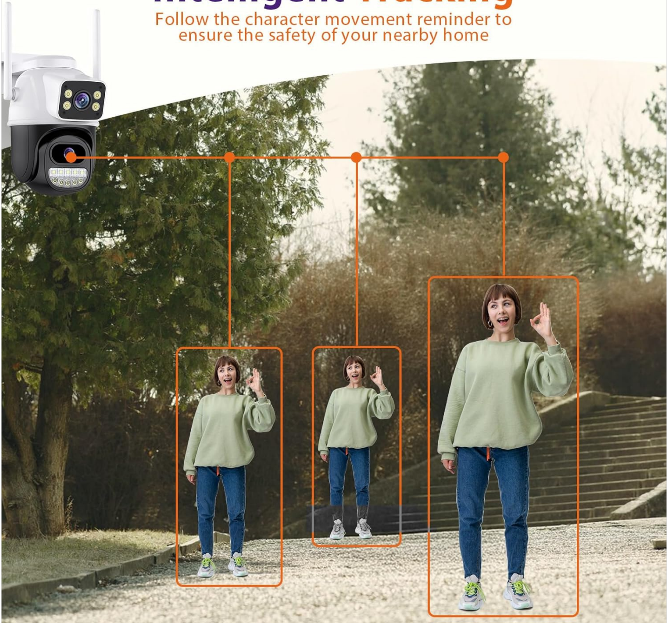
Figure 8: Intelligent Tracking. This image demonstrates the camera's ability to follow and track human movement, ensuring continuous monitoring of your property.

Follow the character movement reminder to ensure the safety of your nearby home