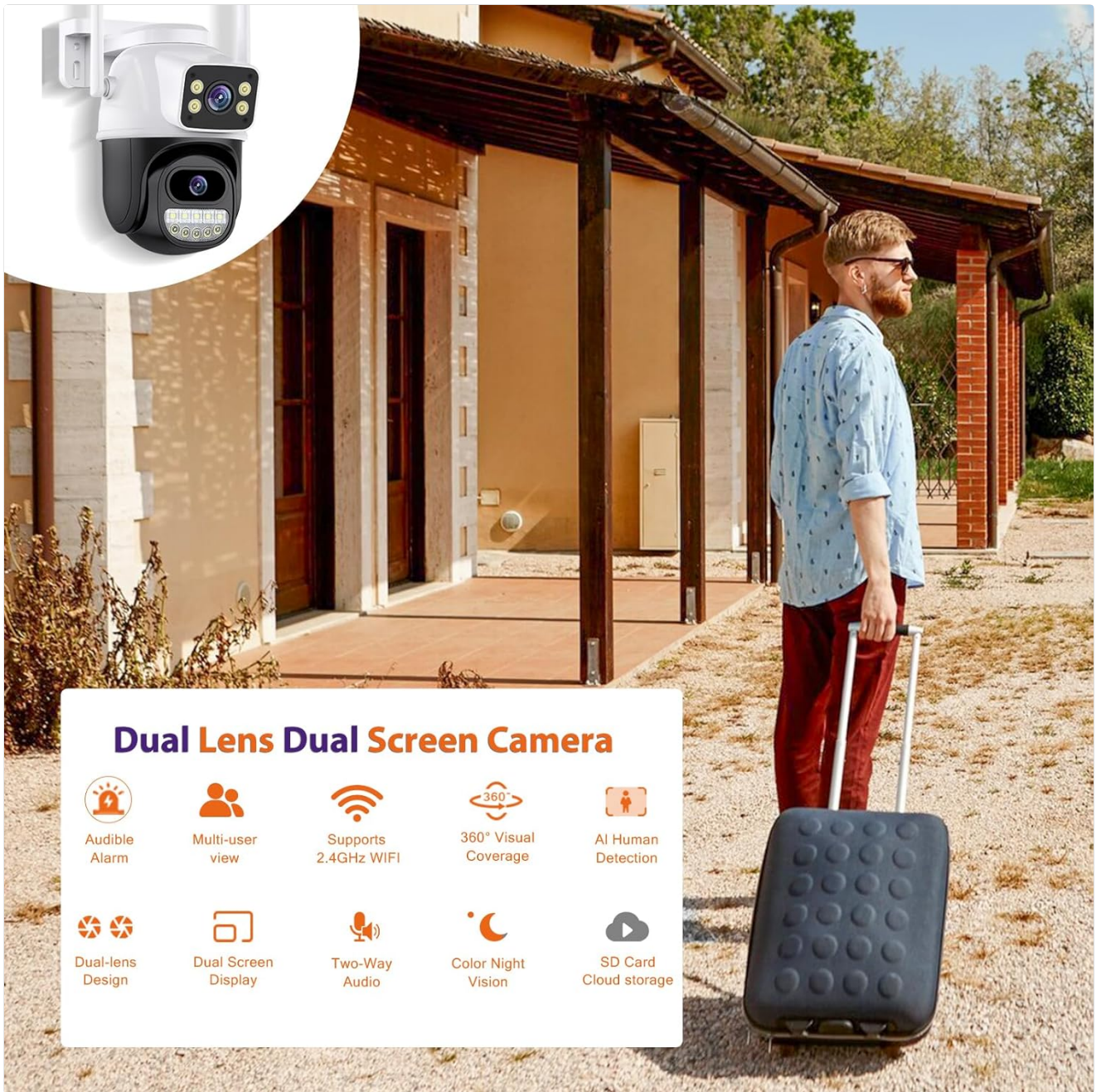
Figure 6: Dual Lens Dual Screen Camera Features. This image highlights the camera's dual-lens design, offering features like audible alarm, multi-user view, 2.4GHz WiFi support, 360° visual coverage, AI human detection, dual-screen display, two-way audio, color night vision, and SD card/cloud storage.