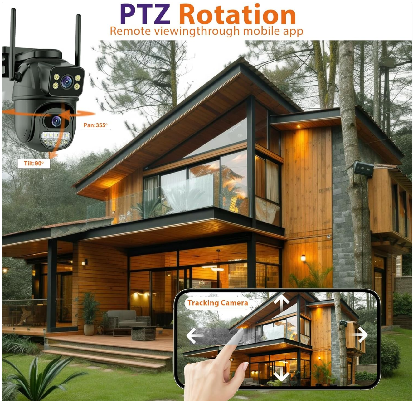
Figure 5: PTZ Rotation Feature. This image shows the camera's pan (355°) and tilt (90°) capabilities, controlled remotely via the mobile app, providing extensive coverage.

Your browser does not support the video tag.