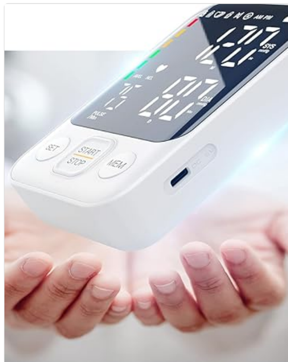
Figure 3: The large LED display clearly shows Systolic, Diastolic, and Heart Rate. Buttons for SET, START/STOP, and MEMORY are also visible.