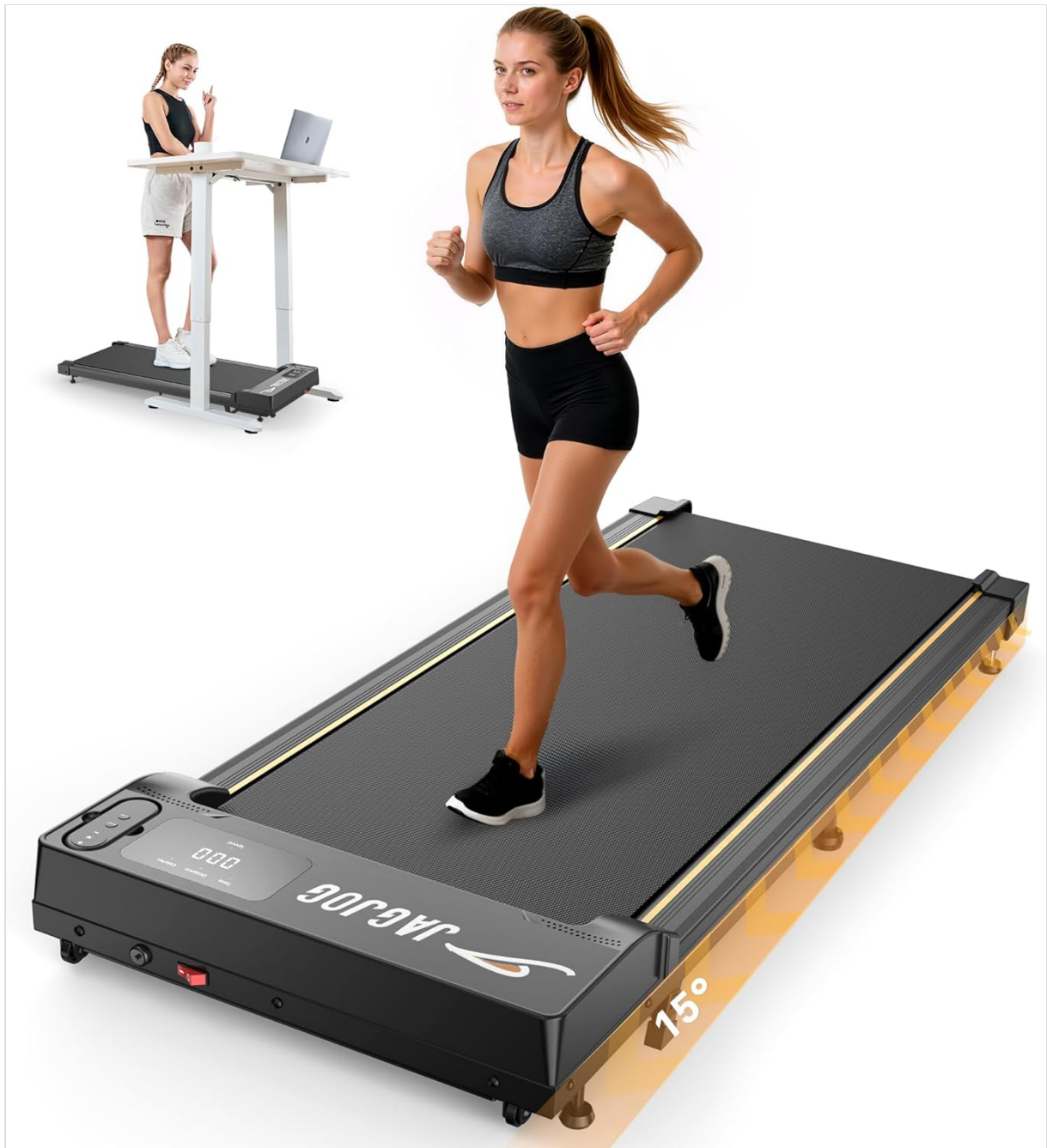
Image: The JAGJOG Walking Pad in use, demonstrating its compact design and suitability for various environments.