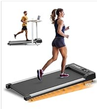
Image: All components included in the JAGJOG Walking Pad package.