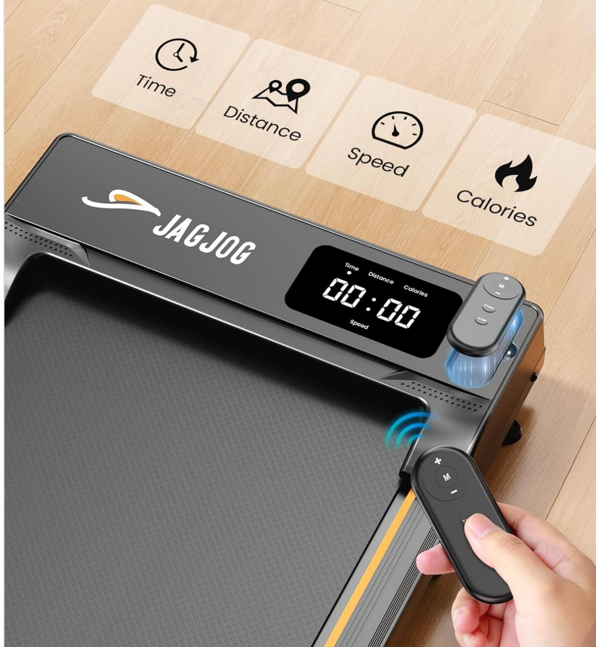
Image: The LED display and remote control for tracking workout data.

Track Fitness Data, Elevate Healthy Living