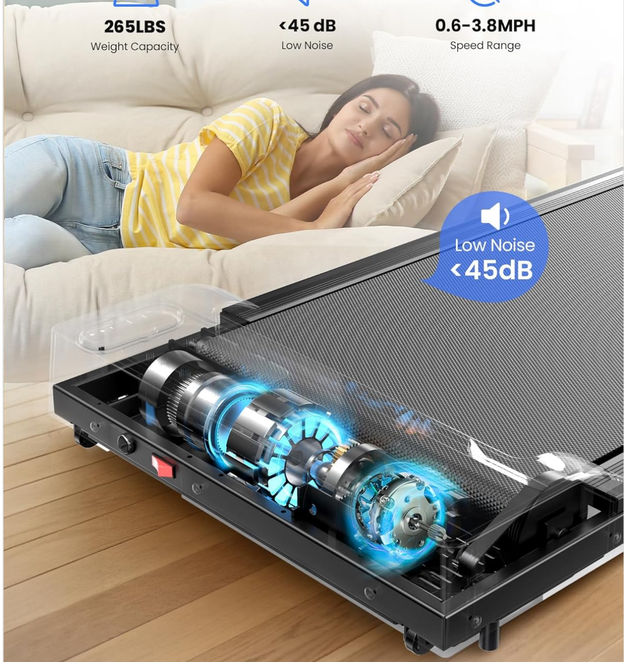
Image: Internal view of the 2.5 HP motor and its specifications.