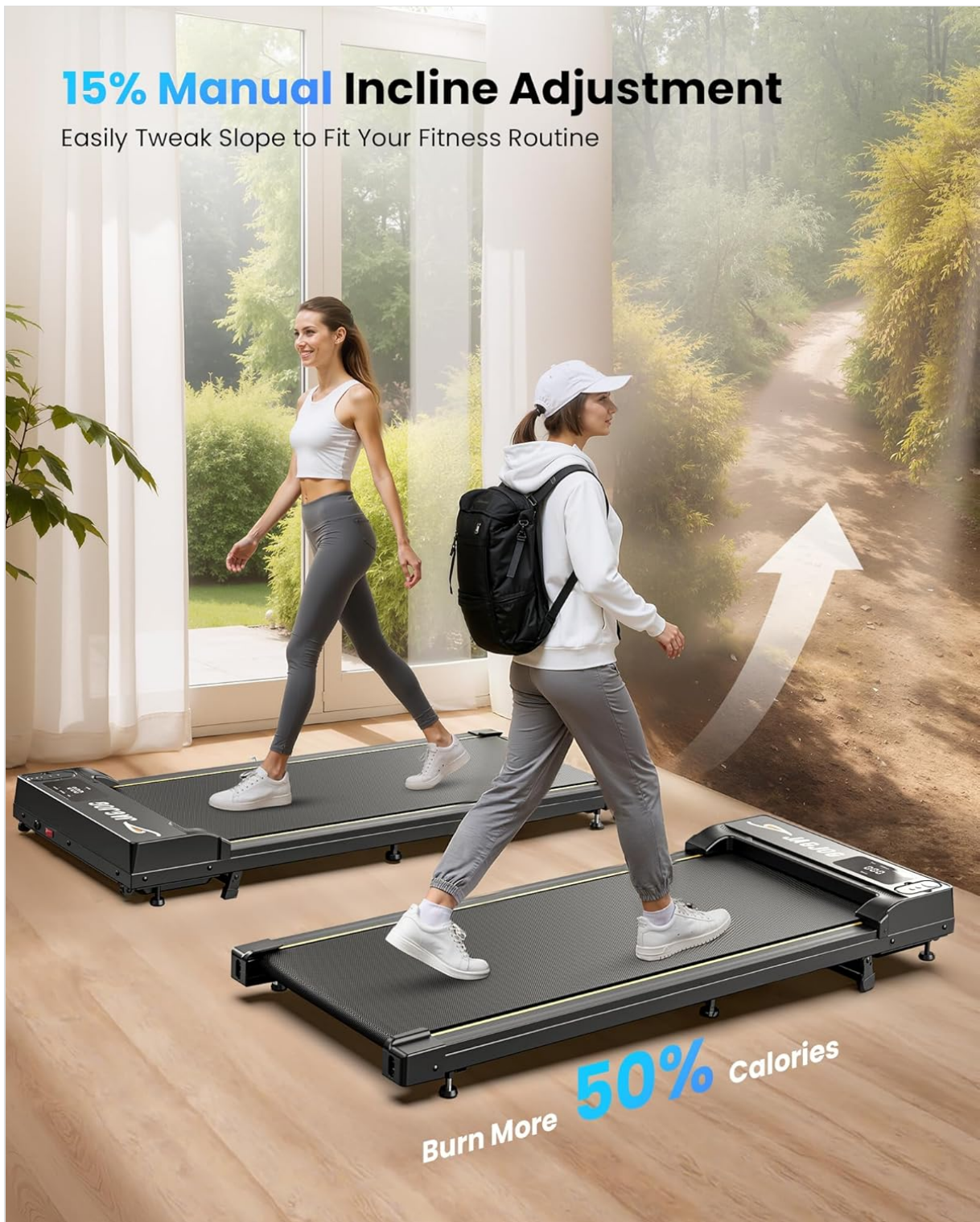
Image: Demonstrating the manual 15° incline adjustment for increased workout intensity.

Easily Tweak Slope to Fit Your Fitness Routine