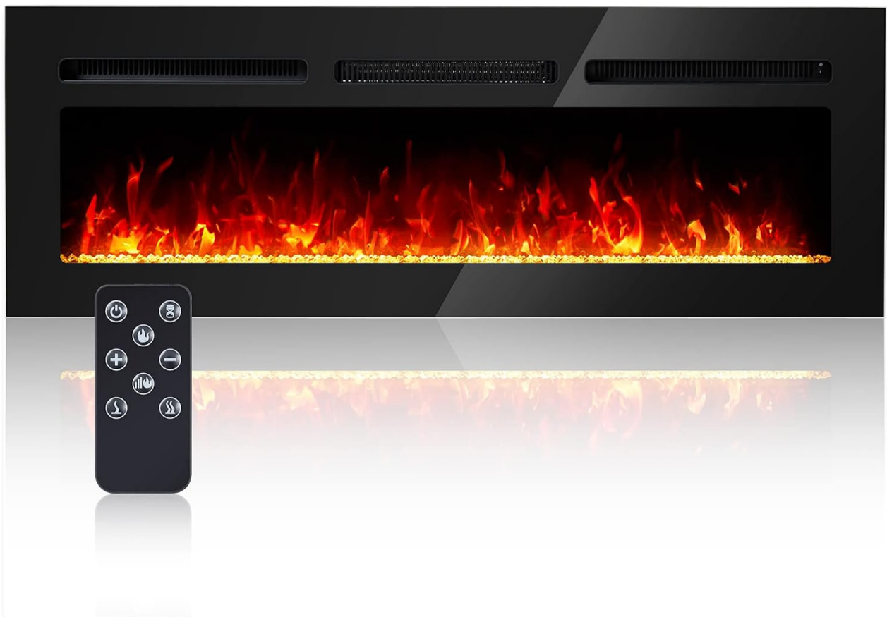
Image 1: The Towallmark 60-Inch Electric Fireplace with its remote control.