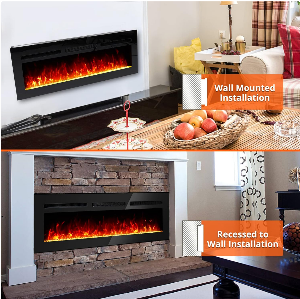
Image 3: Visual representation of Wall-Mounted and Recessed Installation methods.