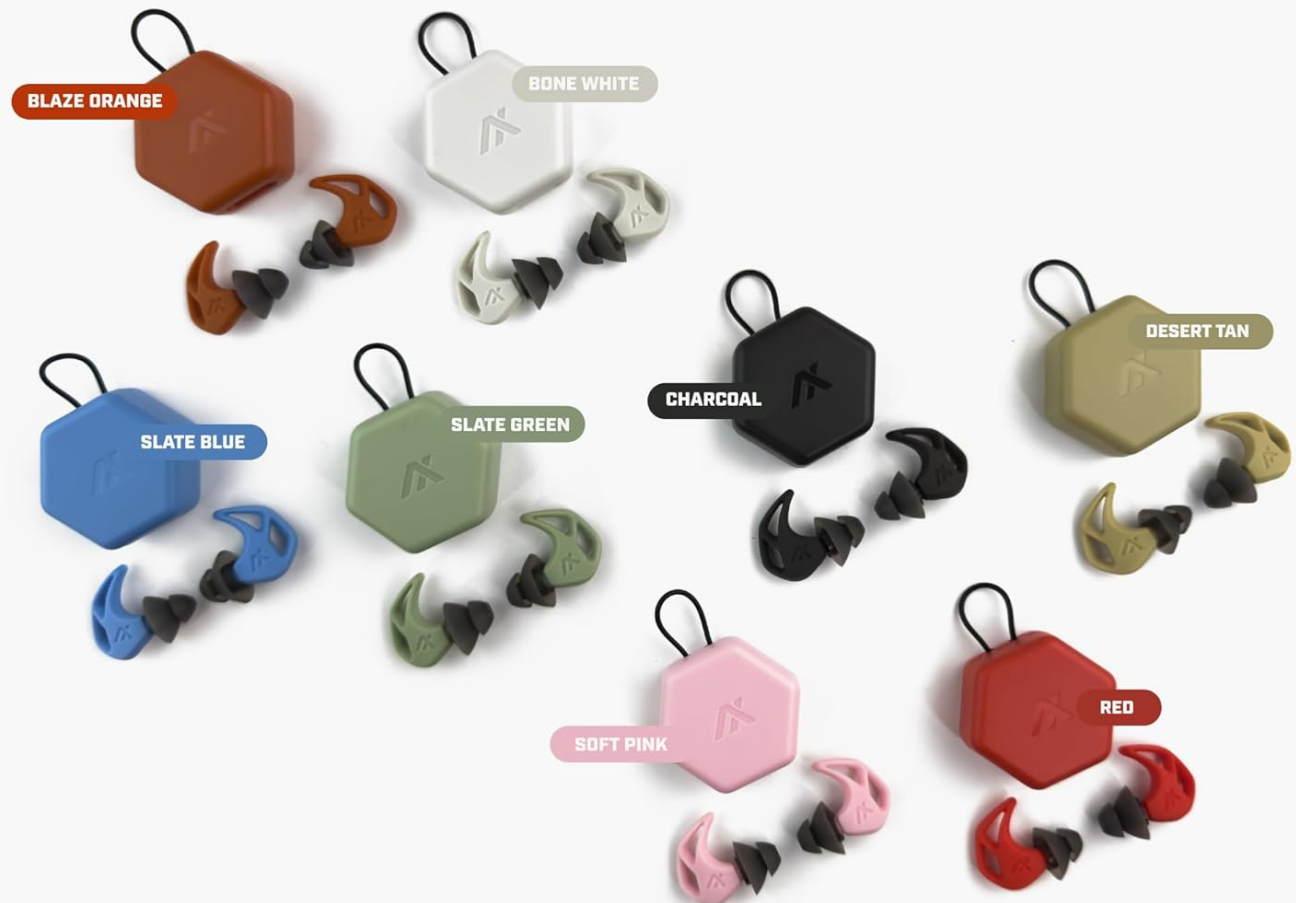
Image: Detailed view of all items included in the AXIL X20 package.