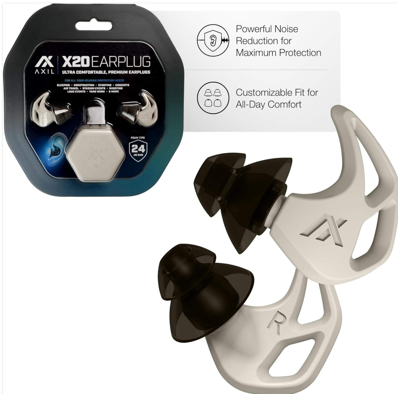
Image: AXIL X20 Ear Plugs, showcasing the product and its packaging.