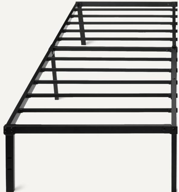
Figure 2: Key Features