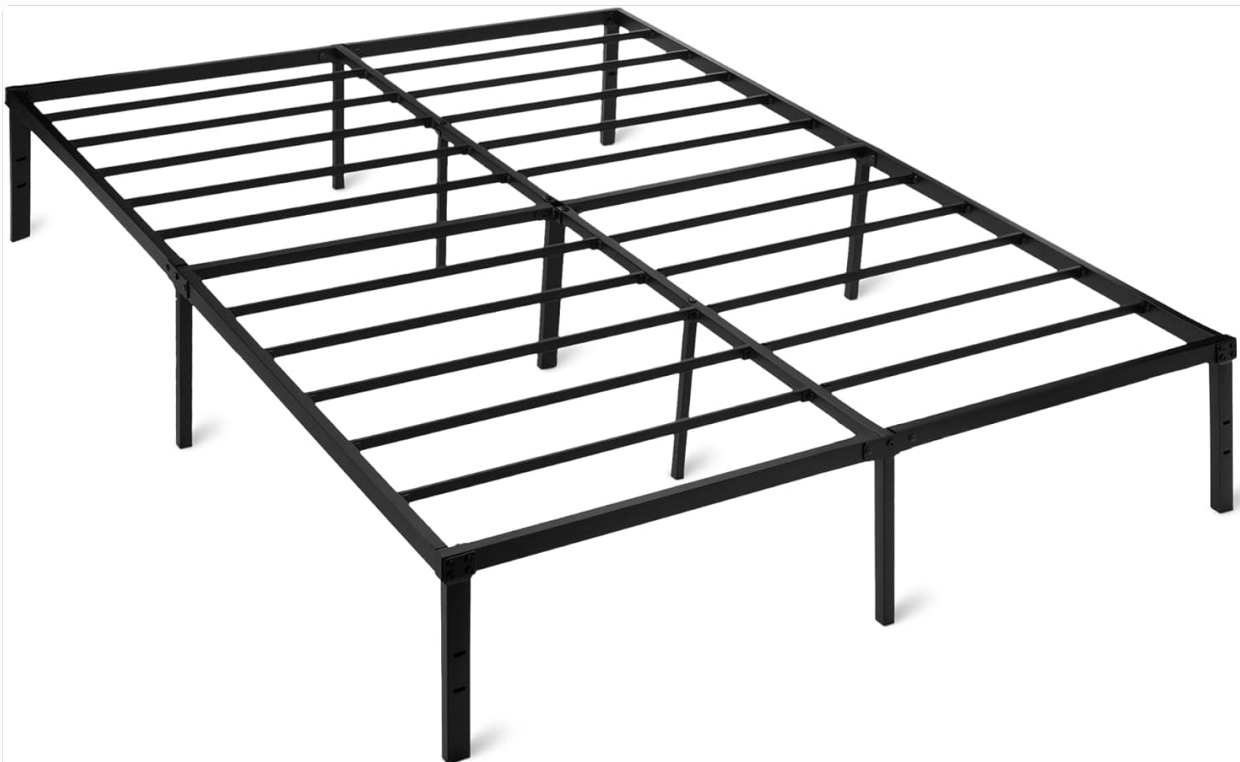
Figure 3: Fully Assembled Bed Frame

Video 1: Assembly Demonstration (Easiest assembly you will ever find)