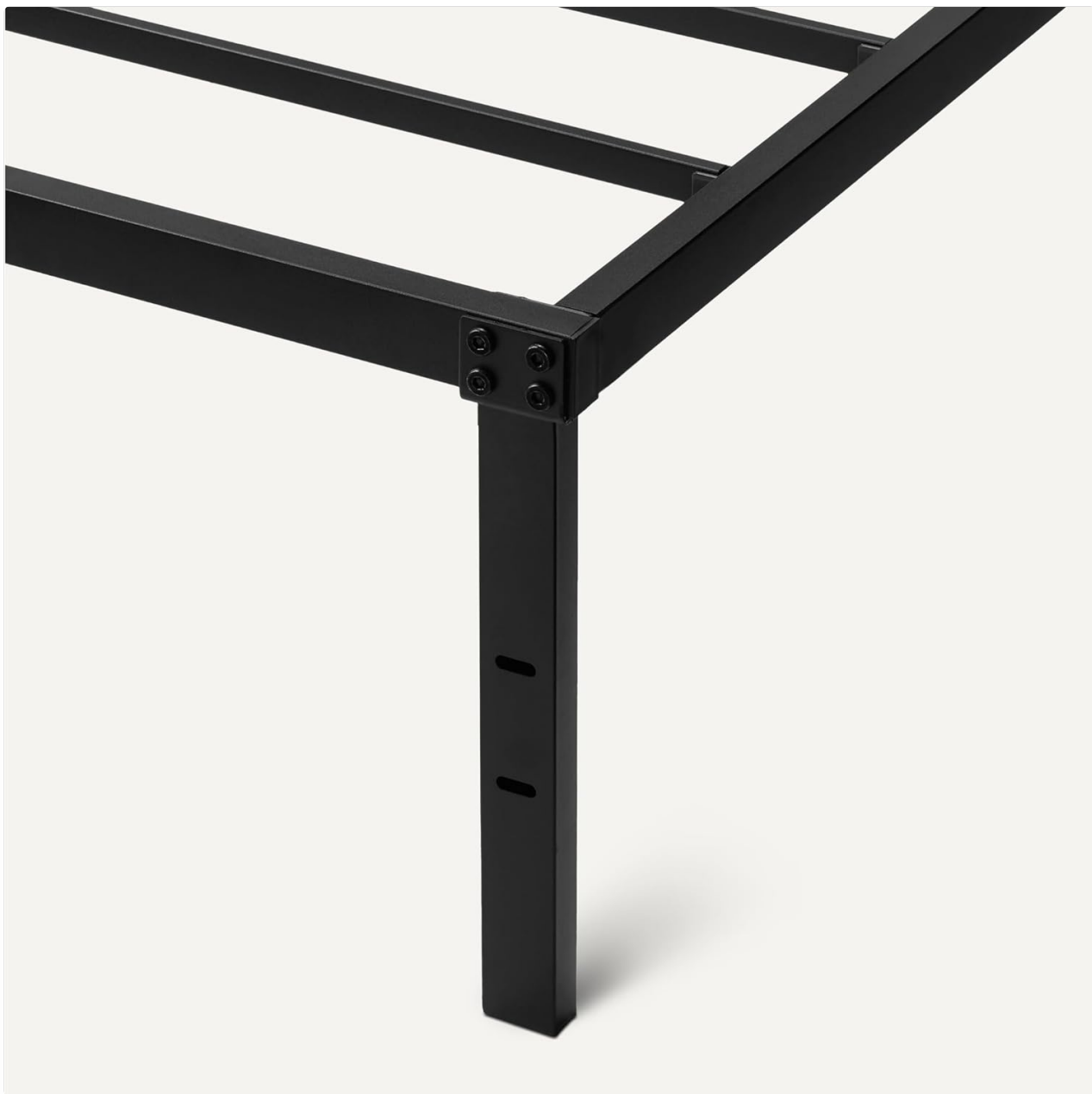
Figure 4: Frame Corner Detail