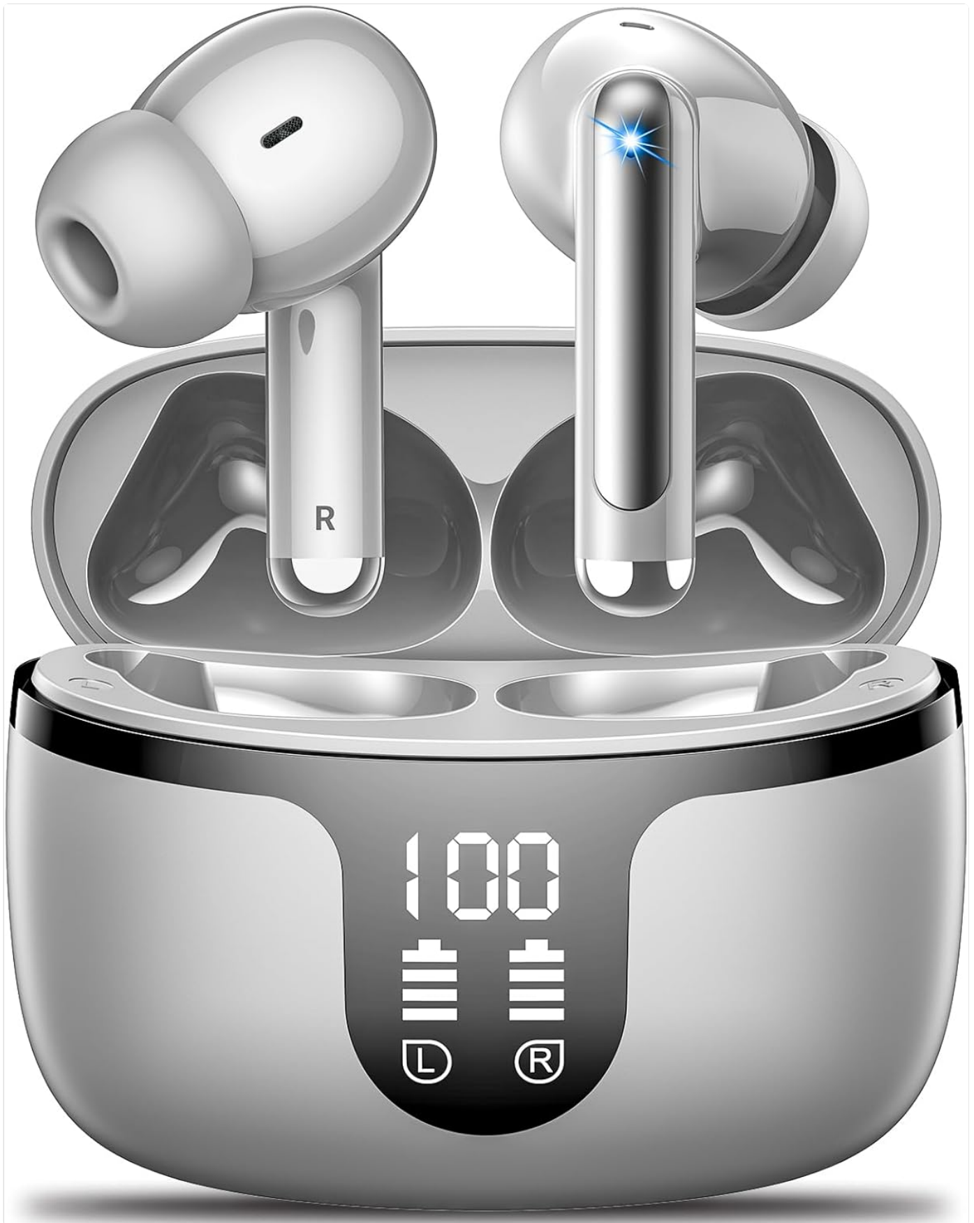
Image: The Monyhigh S48 earbuds resting in their open charging case. The case features a digital display indicating "100" percent charge and individual battery levels for the left (L) and right (R) earbuds. One earbud shows a blue indicator light.

Familiarize yourself with the components of your Monyhigh S48 Wireless Earbuds: