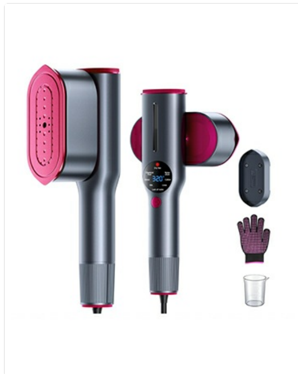
Image: Close-up of the DRFLASH steamer showing the water tank being filled with a measuring cup.