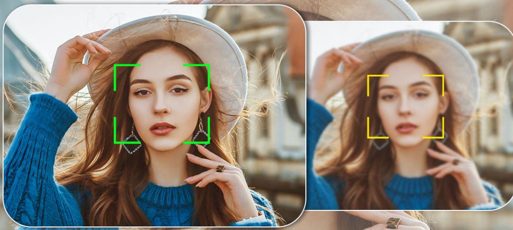
Figure 4.2: Autofocus indicator.

Pressing the shutter release button halfway when taking a photo and again when the focus frame changes from yellow to green ensures that every shot is in sharp focus.