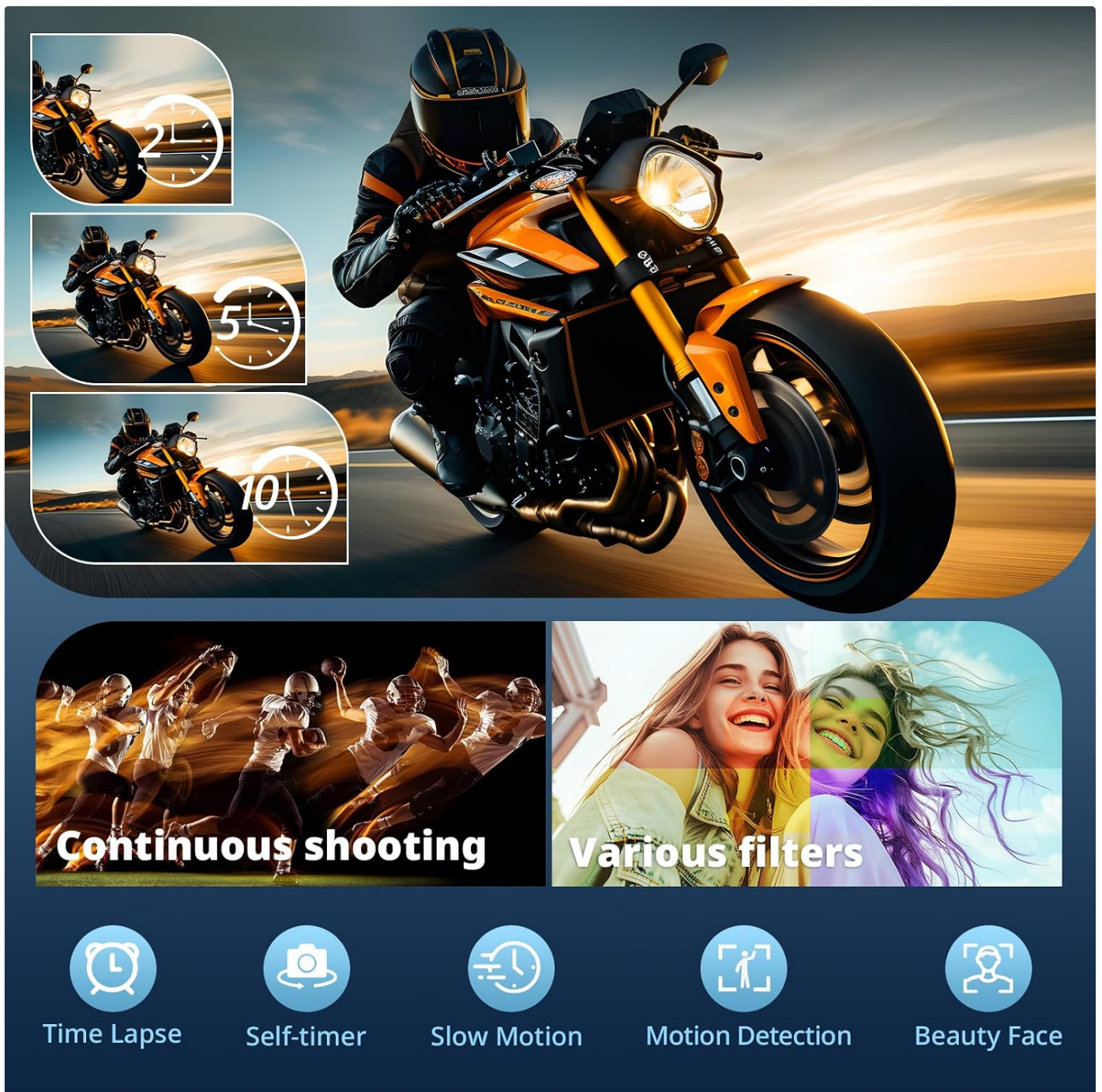
Figure 5.3: Creative shooting modes.