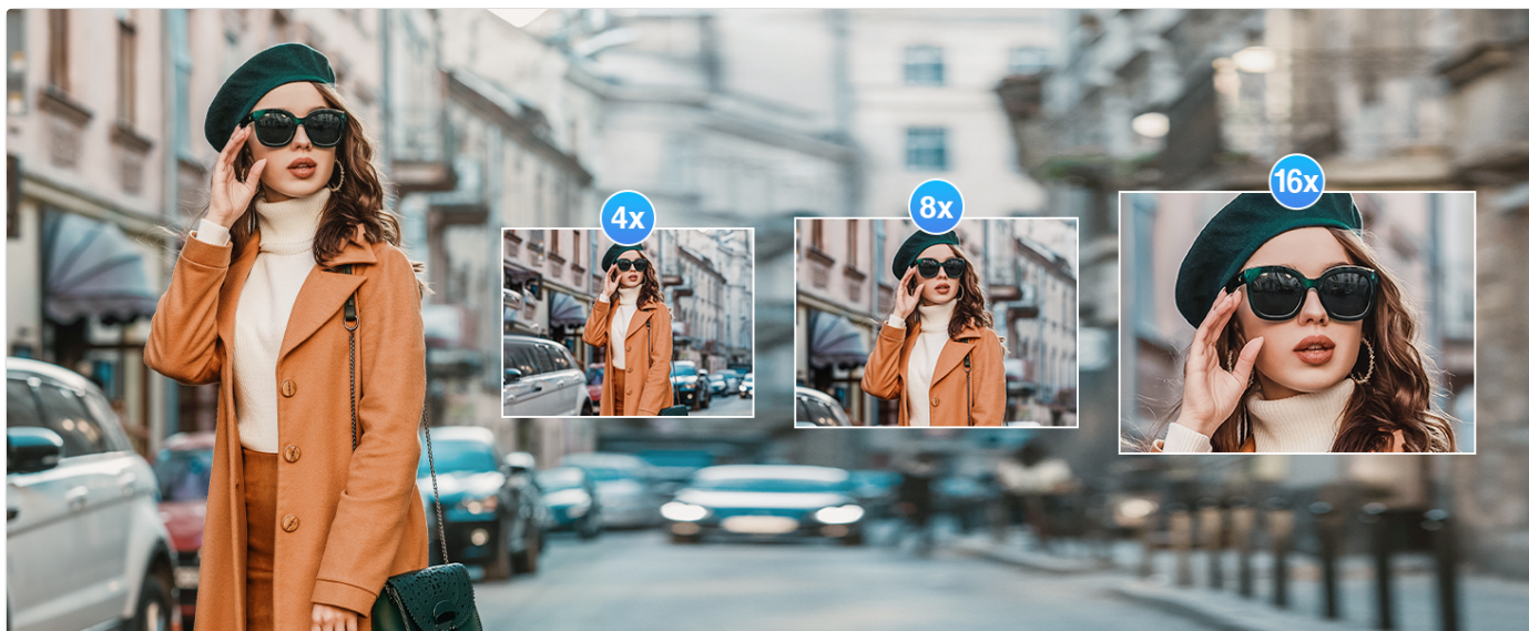
Figure 4.5: Digital Zoom capability.