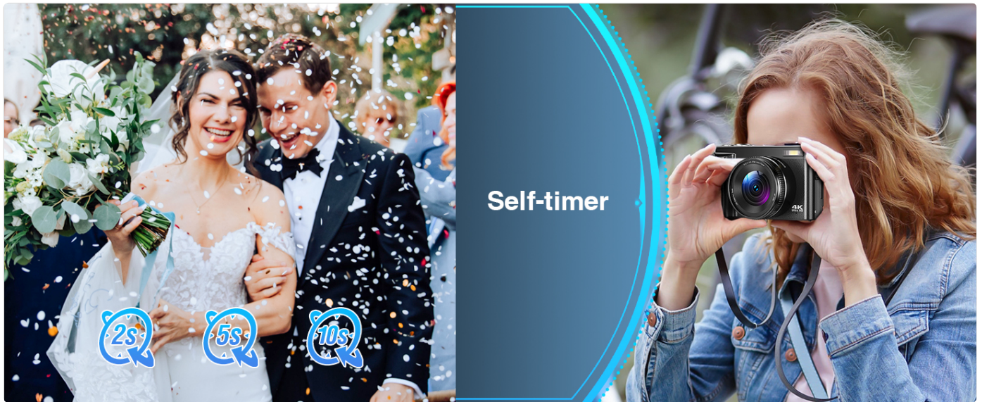
Figure 5.5: Self-timer options.