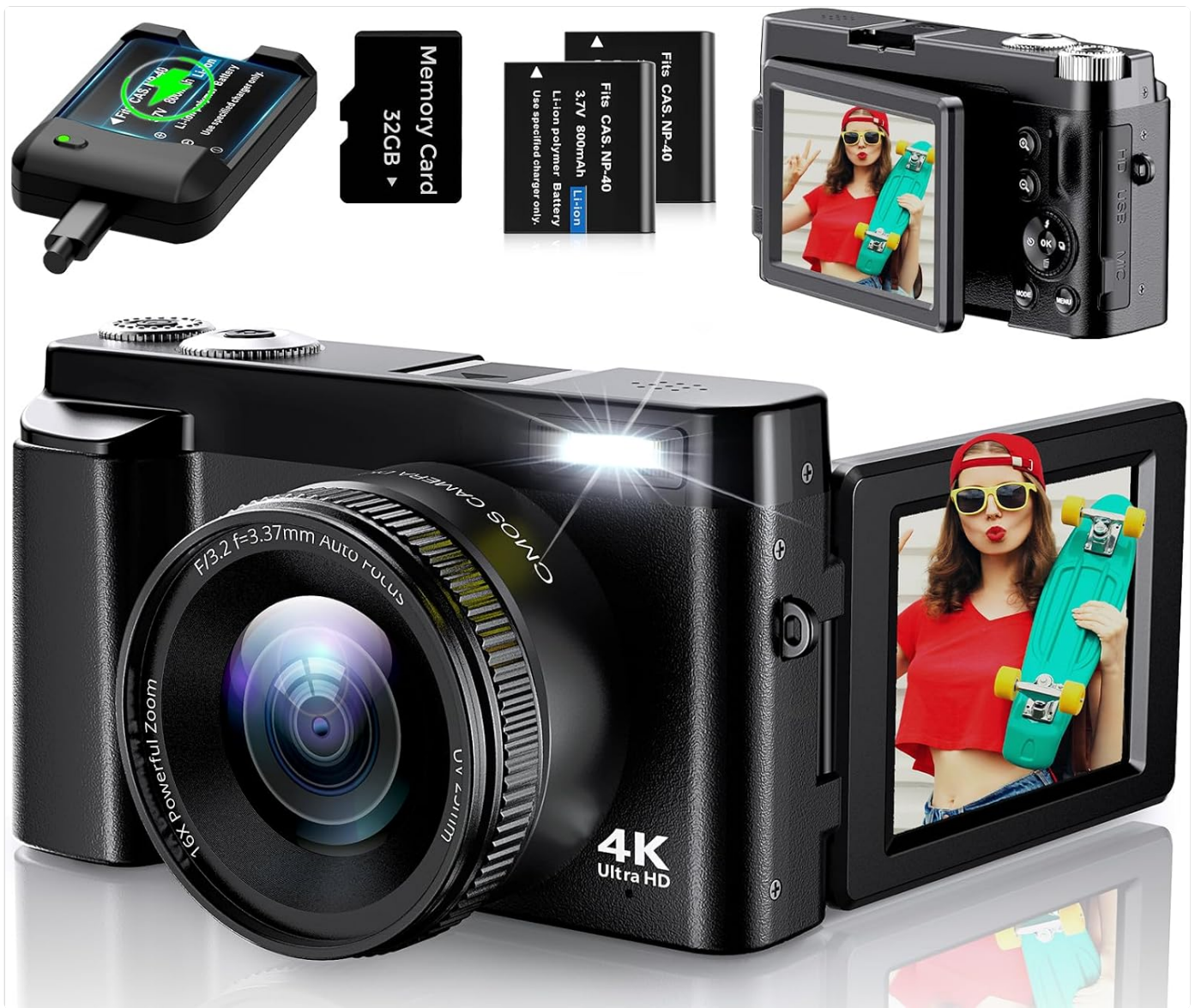
Figure 1.1: JGIPL 4K Digital Camera and accessories.