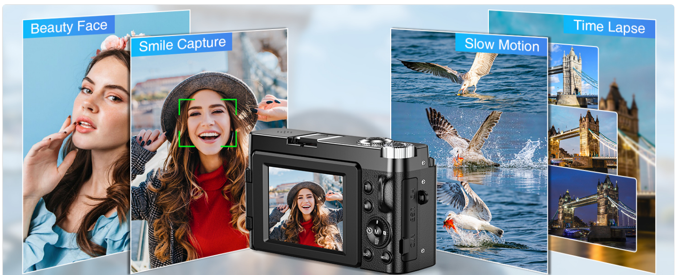
Figure 5.4: Advanced photo and video features.