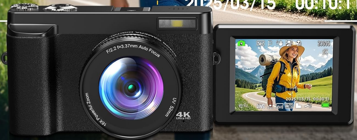
Figure 5.1: 4K UHD and 48MP image clarity.