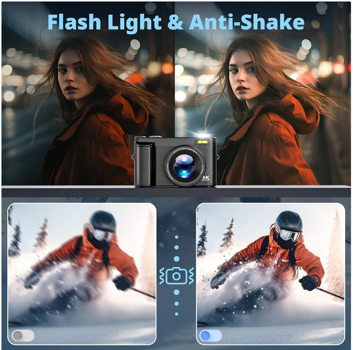
Figure 5.2: Flash Light and Anti-Shake capabilities.