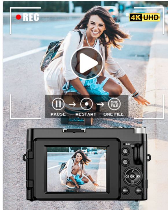
Figure 4.3: Video recording controls.

The camera supports video pause and play functionality during recording.