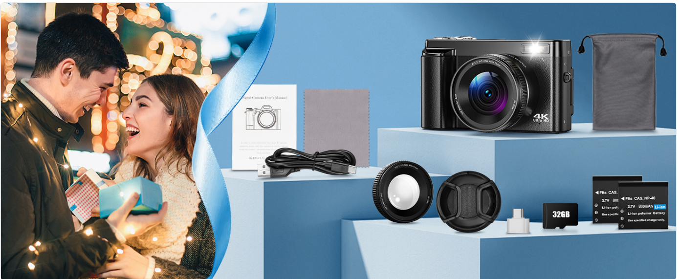
Figure 2.1: All included components.