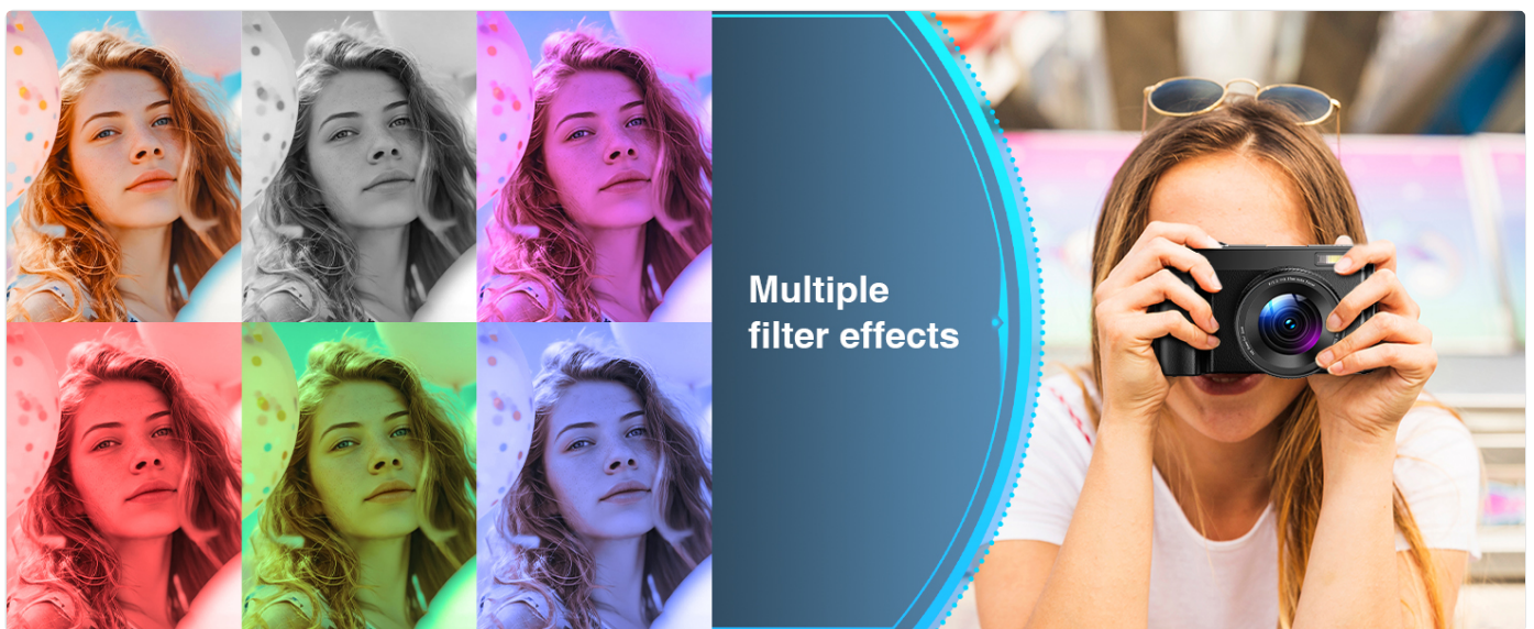
Figure 5.7: Multiple filter effects.