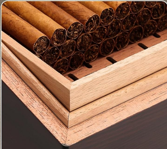
Spanish Cedar Wood Lining