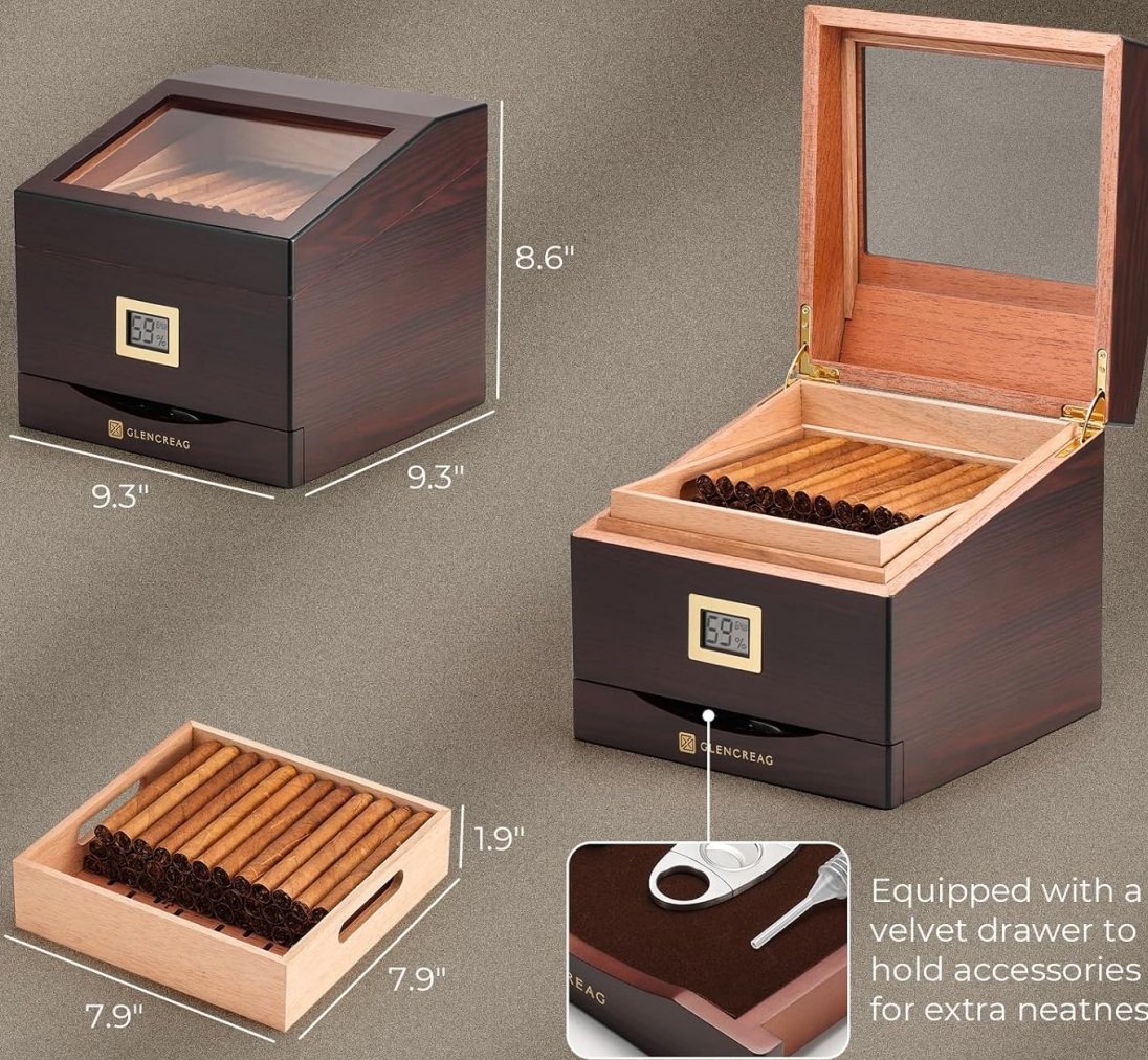
Image: Visual representation of the humidor's dimensions (9.3"L x 9.3"W x 8.6"H) and its capacity for 55-85 cigars, along with the accessory drawer.

The exact capacity depends on the ring gauge of your cigars.