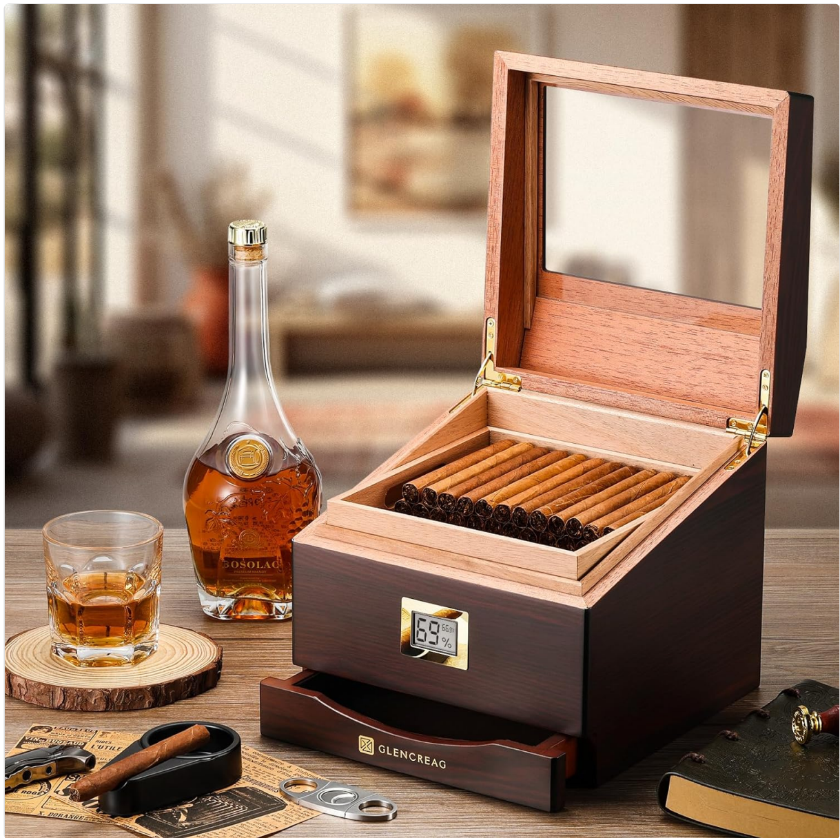
Image: The GLENCREAG FT-2042 Cigar Humidor Box, open and filled with cigars, displayed alongside a glass of whiskey and cigar accessories.