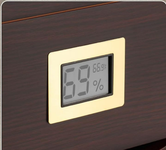
Adjustable Digital Hygrometer