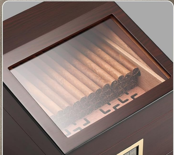
Tight-seal Transparent Door