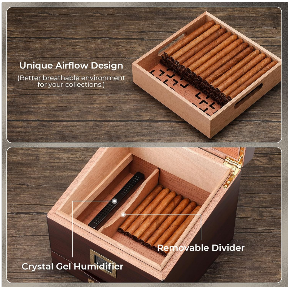
Image: An illustration of the humidor's internal components, including the unique airflow design of the cedar tray, the removable divider, and the crystal gel humidifier.