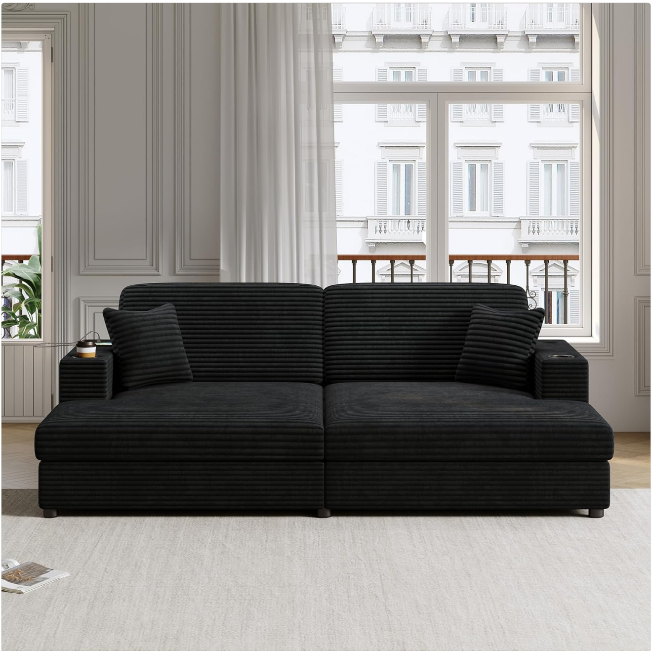
Figure 4.2: Front view of the assembled sofa.