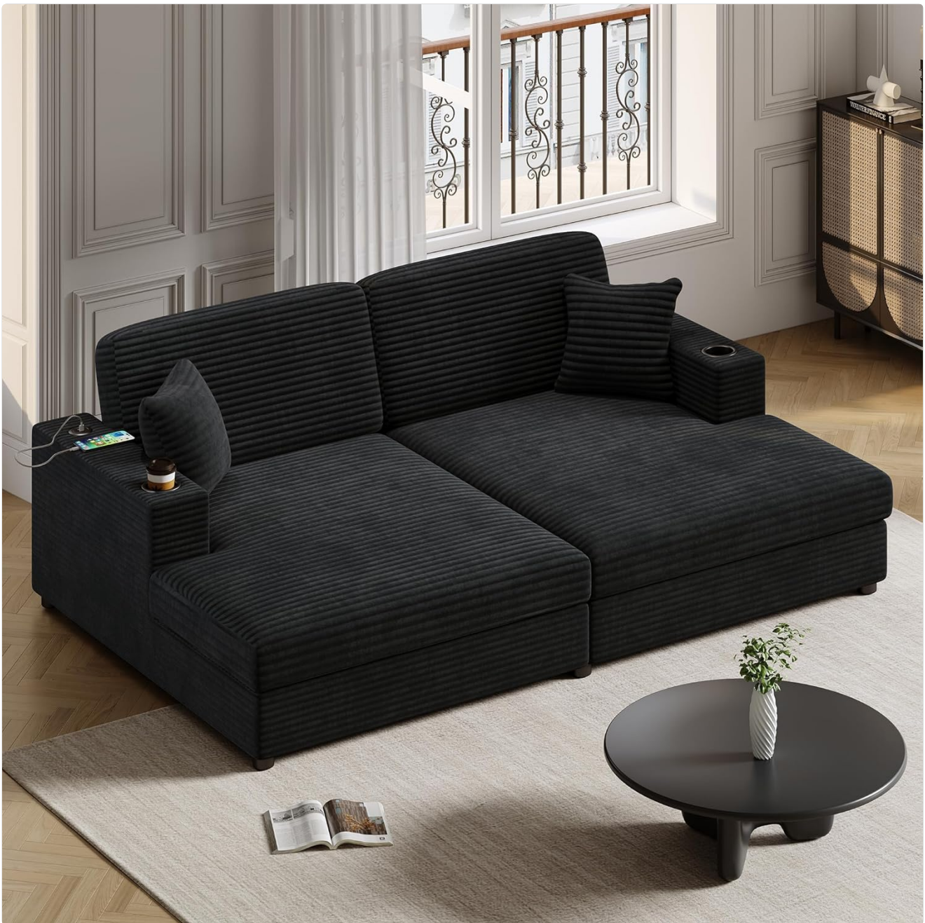
Figure 1.1: The CKLMMC Oversized Loveseat Chaise Lounge, showcasing its spacious design and integrated features.