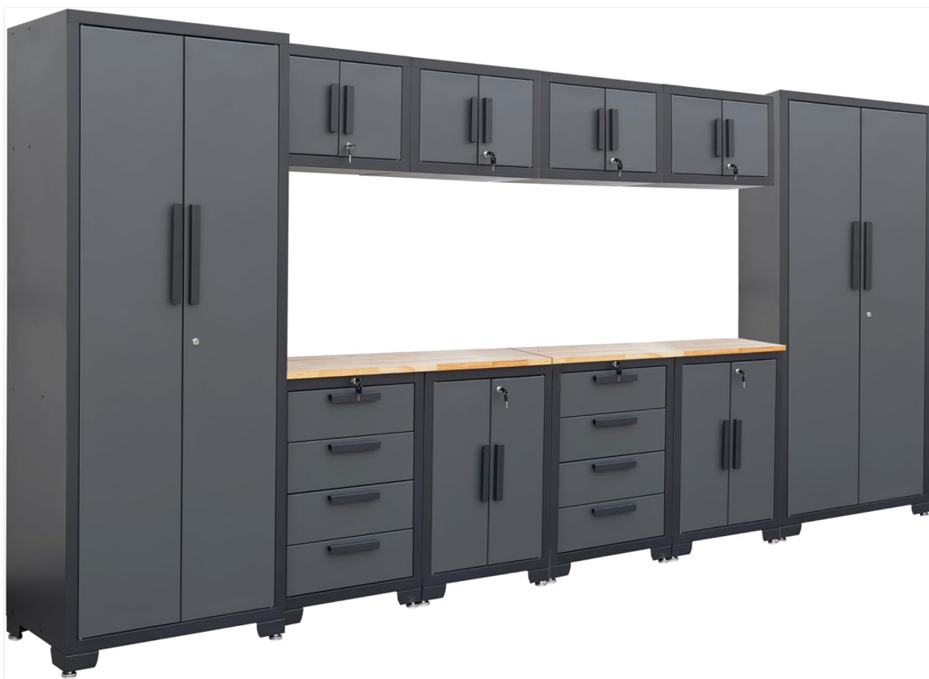
Image 1.1: The complete TCE Heavy Duty 12 Piece Garage Storage System.

This manual provides detailed instructions for the assembly, operation, and maintenance of your TCE Heavy Duty 12 Piece Garage Storage System. Designed for garages, workshops, and other utility areas, this system offers robust organization and storage solutions. Please read this manual thoroughly before installation and use to ensure safe and efficient operation.