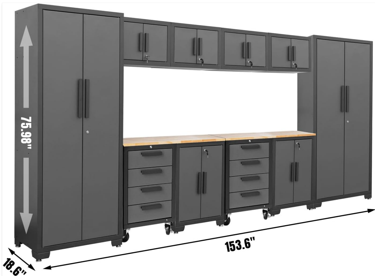
Image 4.1: Overall dimensions of the assembled system (153.6" L x 18.6" D x 75.98" H).