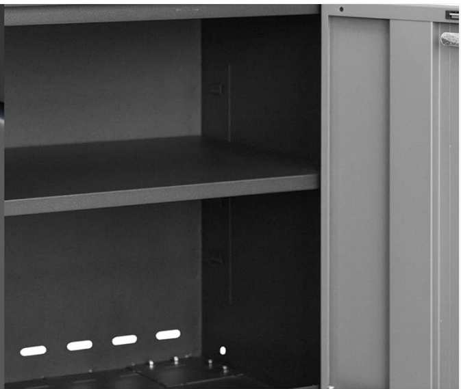
2. Removable Shelves