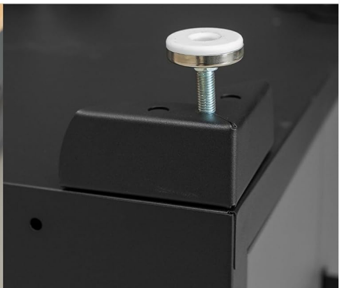
4. Adjustable Feet

Image 4.2: Detail of adjustable feet and other features for assembly and stability.