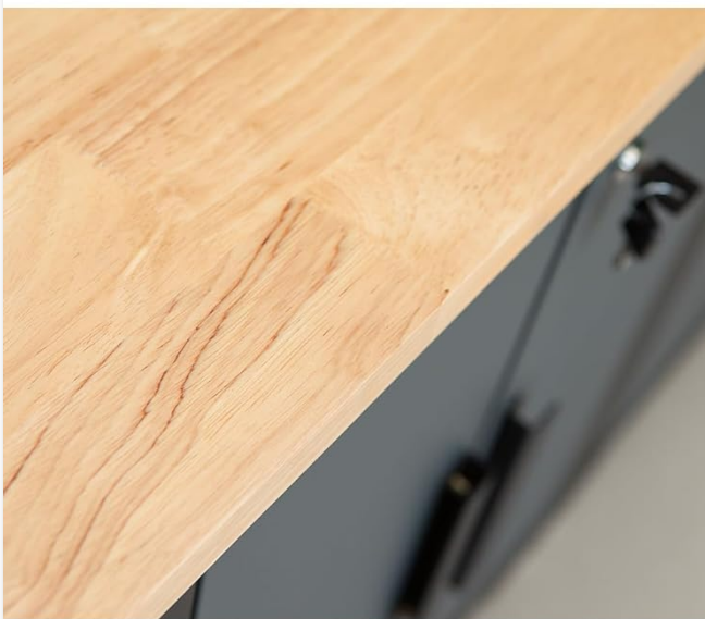
3. Pressed Wood Top