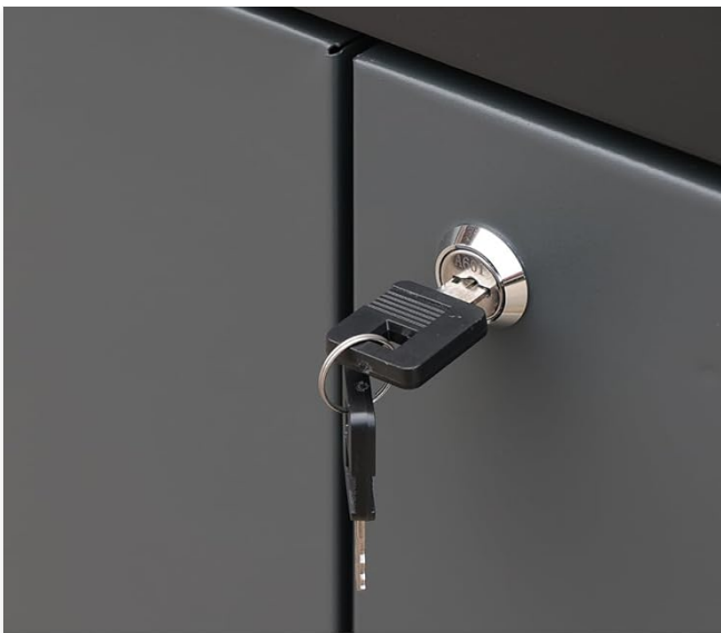
1. Lockable Cabinets