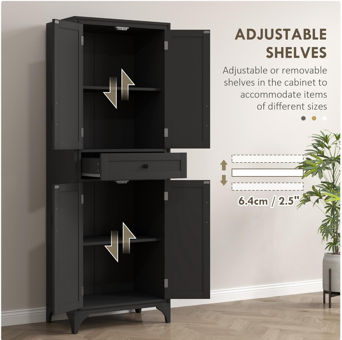
Image: The HOMCOM pantry cabinet with its doors open, highlighting the spacious interior, central drawer, and two-tier cabinets for organized storage.