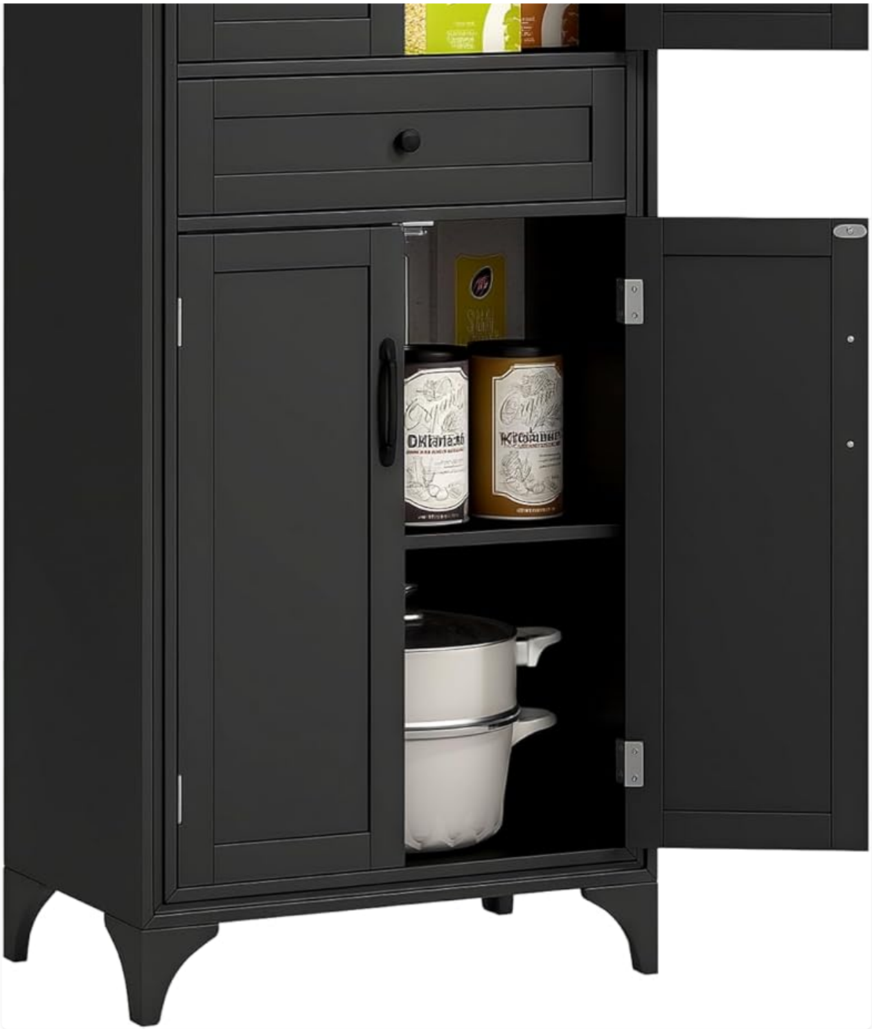
Image: The HOMCOM 67" Tall Freestanding Kitchen Pantry Cabinet in black, with its four doors and central drawer open, showcasing internal storage space.