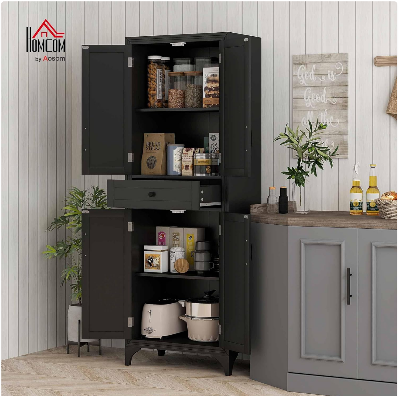
Image: The HOMCOM pantry cabinet positioned in a kitchen, demonstrating its integration into a home environment and its capacity to store various kitchen and dining items.