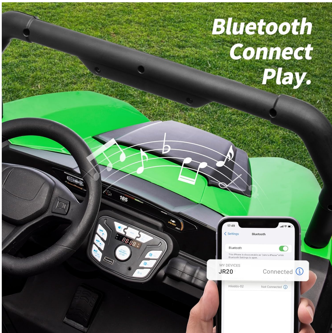
Demonstration of Bluetooth connectivity for playing music through the vehicle's sound system.