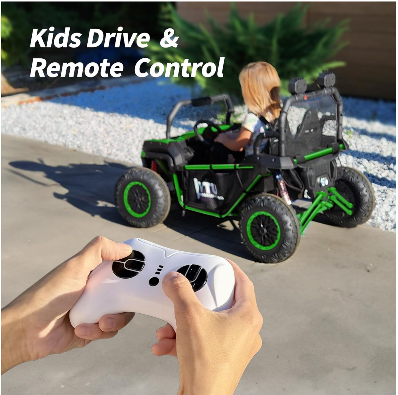
Illustration of a child driving the vehicle while a parent uses the remote control.