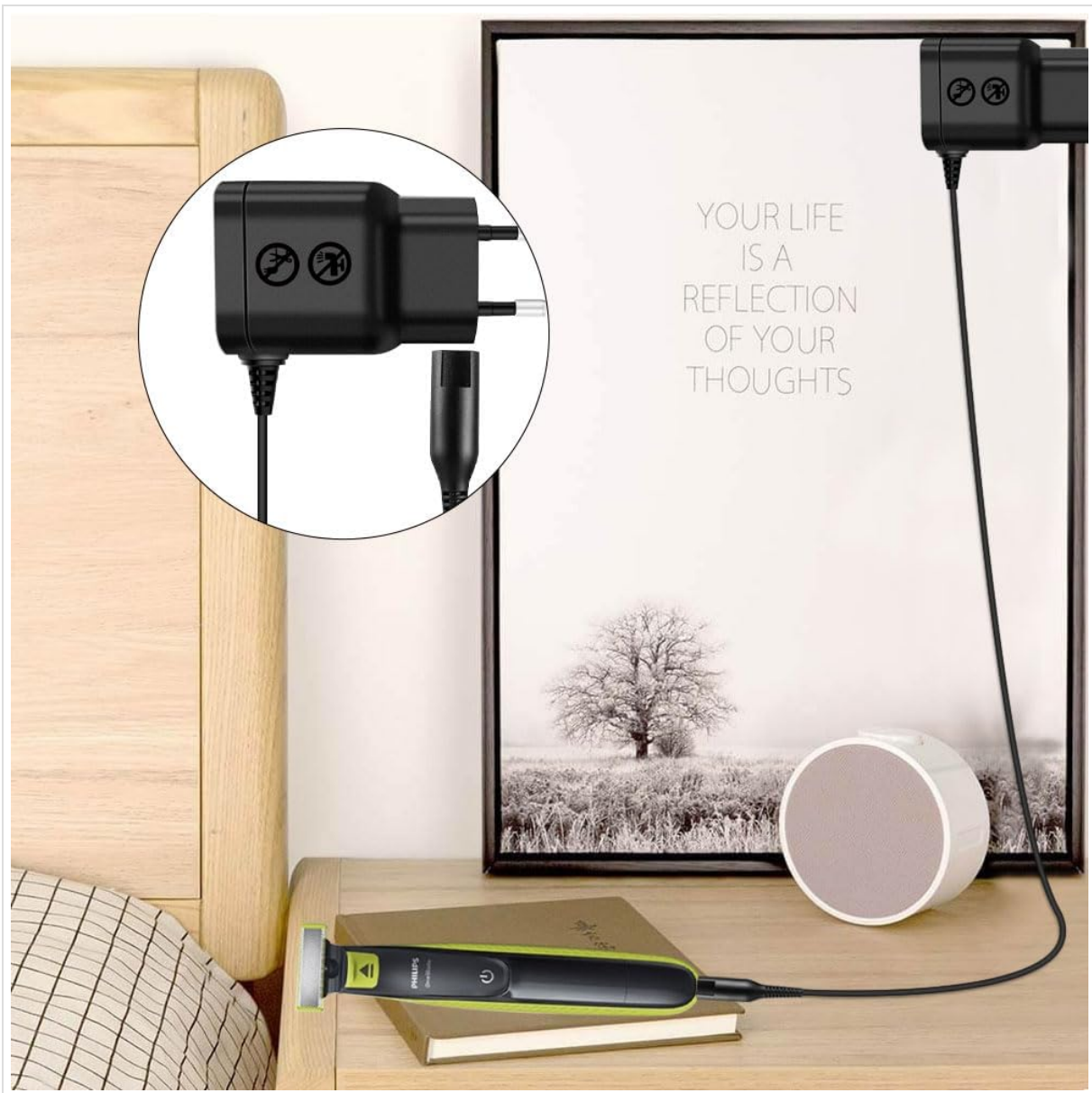
Figure 5.1: The charger in a typical home charging scenario.