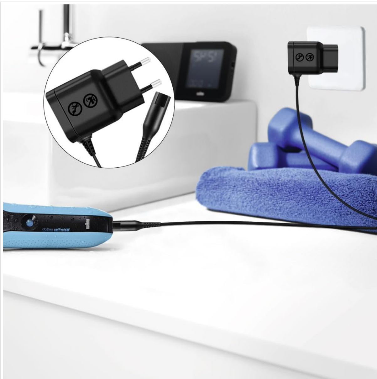
Figure 4.1: Proper setup of the charger, showing it connected to a shaver and a wall outlet.