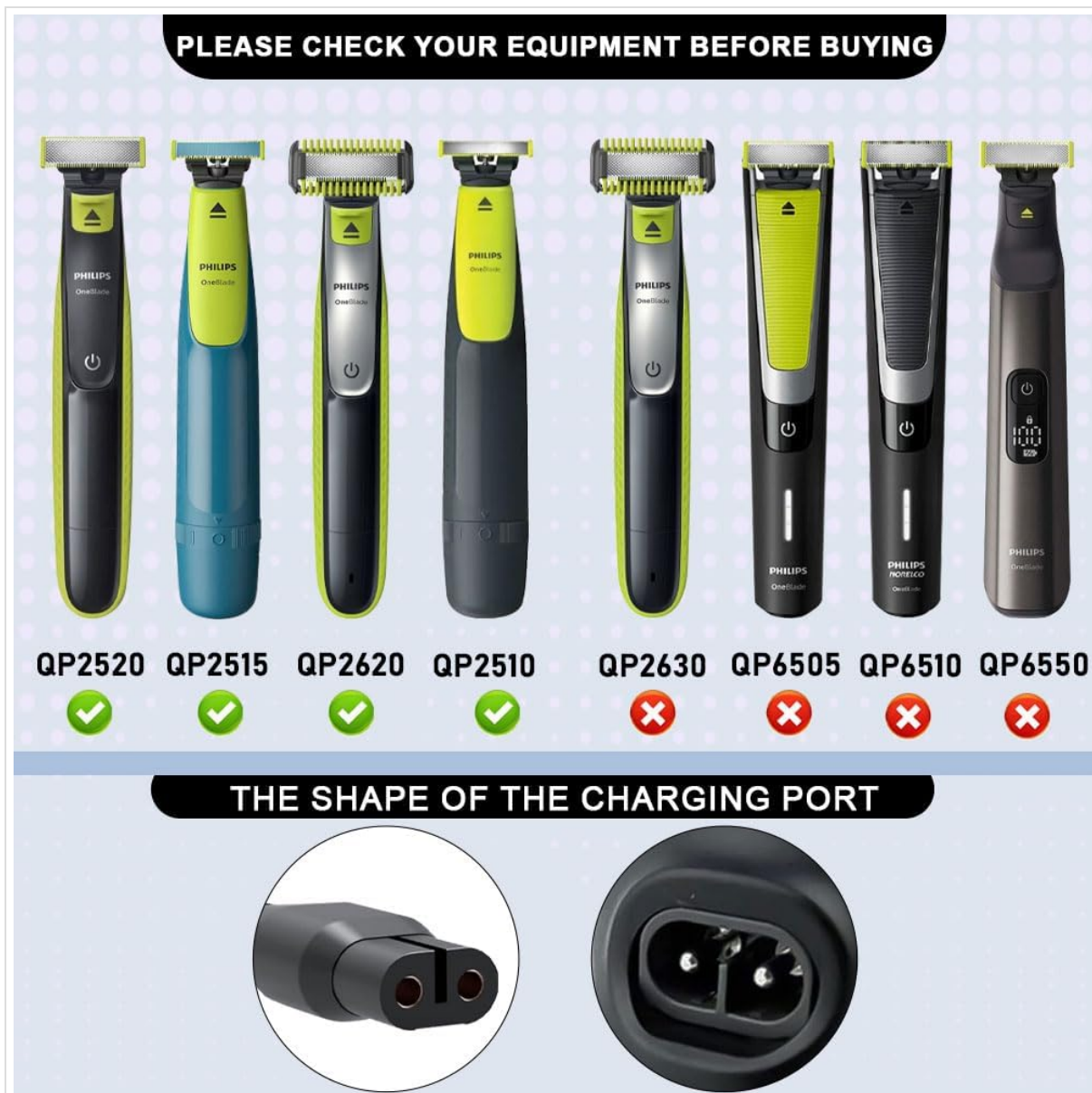
Figure 6.1: Visual guide for shaver model compatibility and charging port shape.