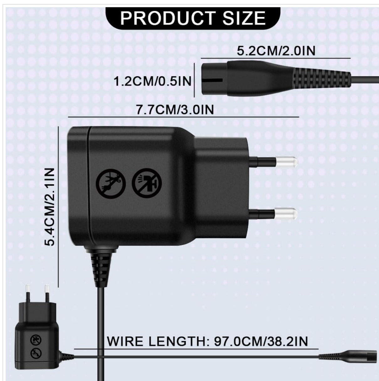
Figure 8.1: Detailed dimensions of the charger components.