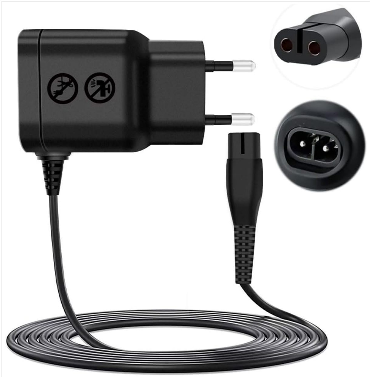
Figure 3.1: Overview of the BufferABC 4.3V Replacement Charger, showing the European plug and the shaver-compatible connector.

The BufferABC 4.3V Replacement Charger is a compact and efficient power supply designed for specific Philips Norelco shavers. It features a durable cable and a European-standard plug.