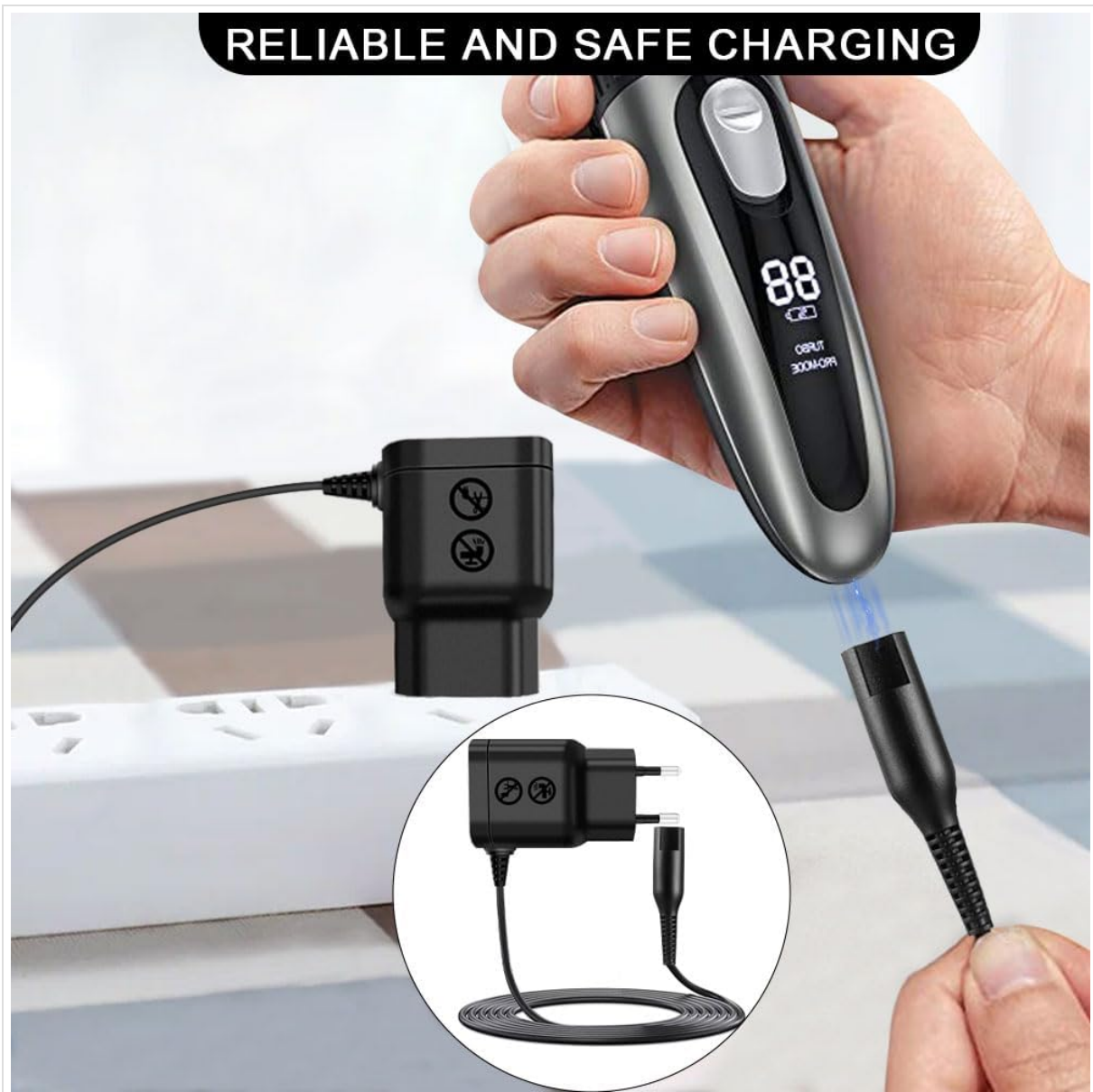
Figure 3.2: The charger in use, connected to a shaver and a power outlet, demonstrating reliable and safe charging.