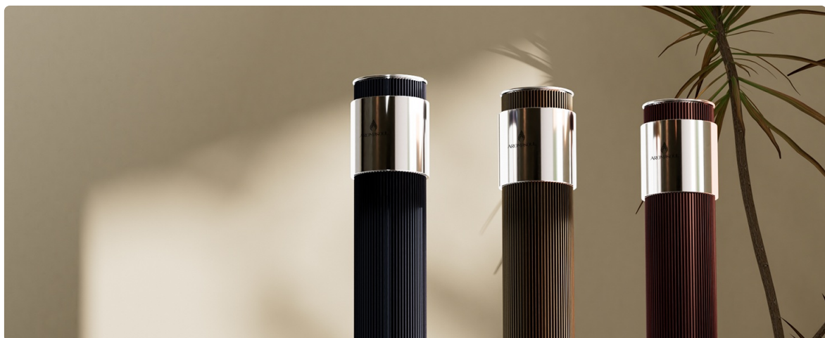
Figure 8: Diffuser usage in different environments.