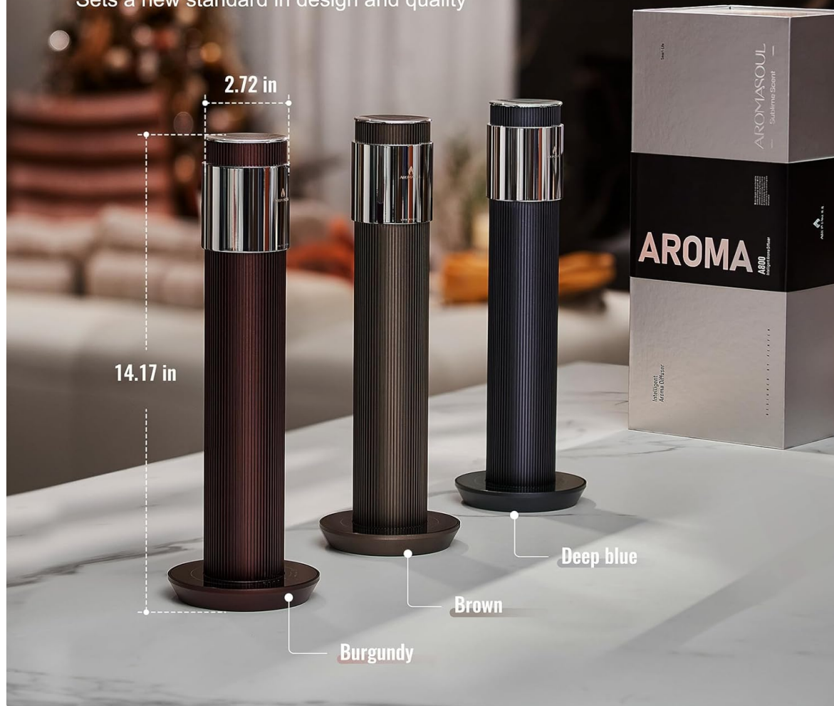
Figure 4: AROMASOUL A800 design and dimensions.

Sets a new standard in design and quality