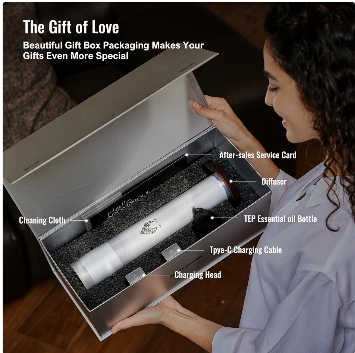
Figure 2: All items included in the AROMASOUL A800 package.