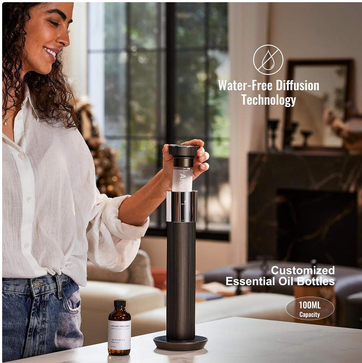
Figure 5: Inserting the essential oil bottle.