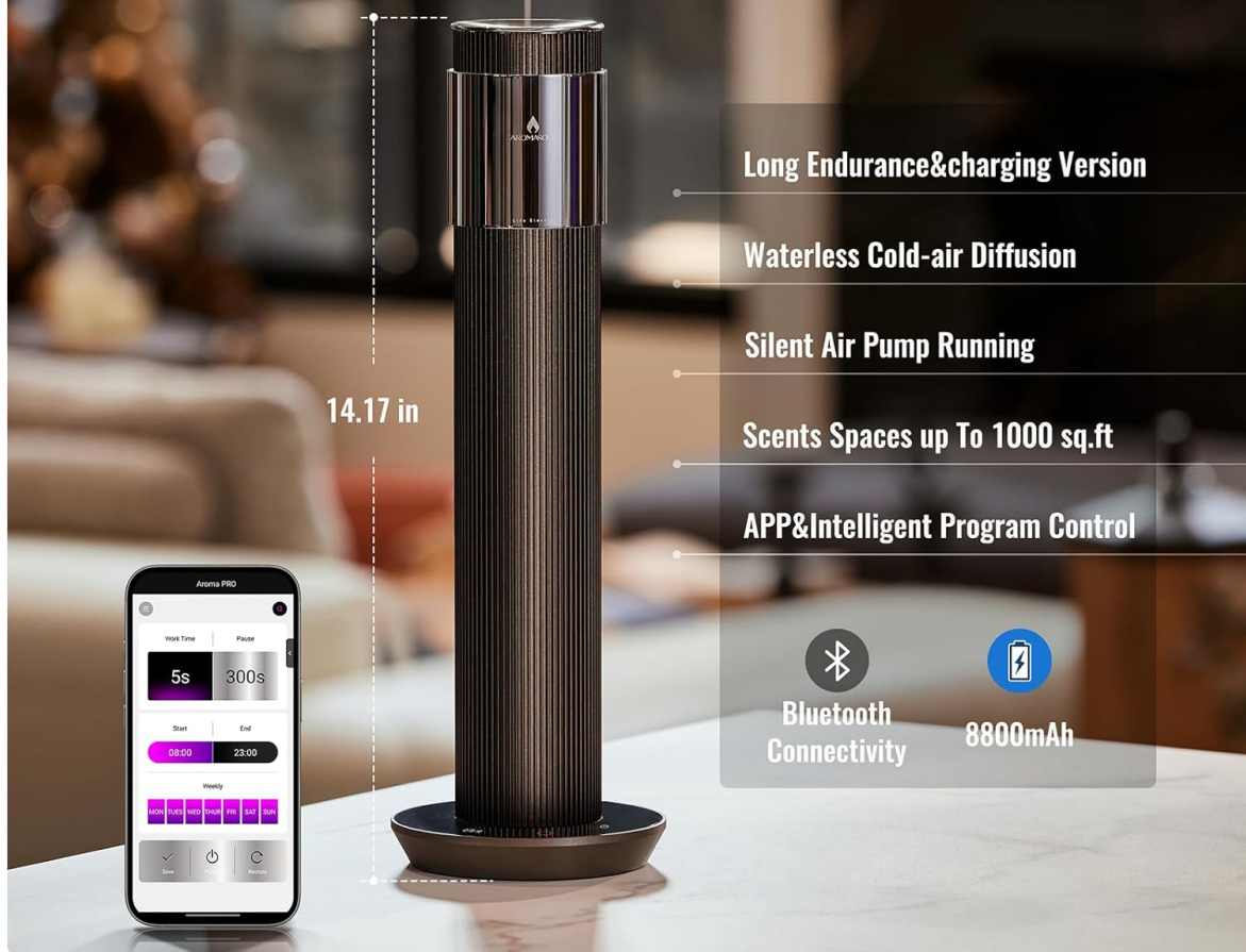
Figure 3: AROMASOUL A800 features overview.