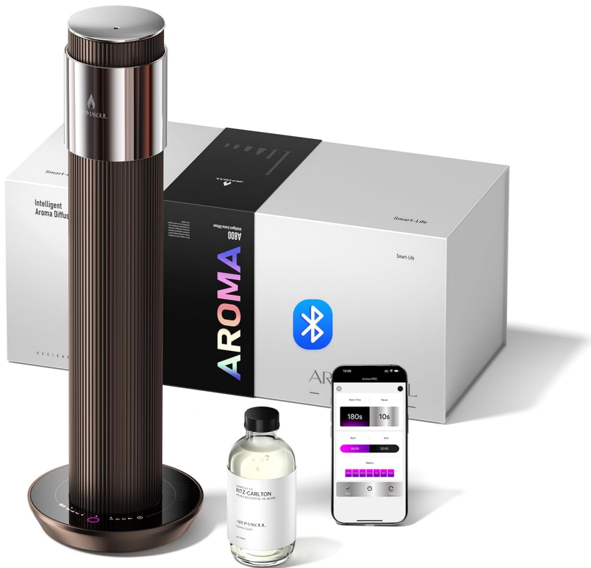
Figure 1: AROMASOUL A800 Diffuser and accessories.