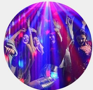
Image: The Kreiaoer Stage Light shown alongside three circular insets depicting its use in a concert, a lounge, and a party setting. This highlights the versatility of the light for various applications.