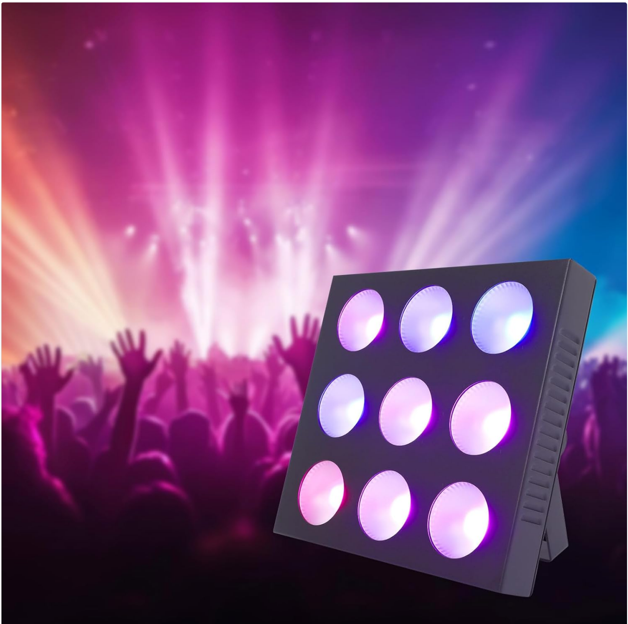
Image: The Kreiaoer Stage Light illuminating a space with vibrant purple and pink hues, demonstrating its color mixing

The light supports 0%-100% linear dimming, allowing you to adjust the brightness precisely.