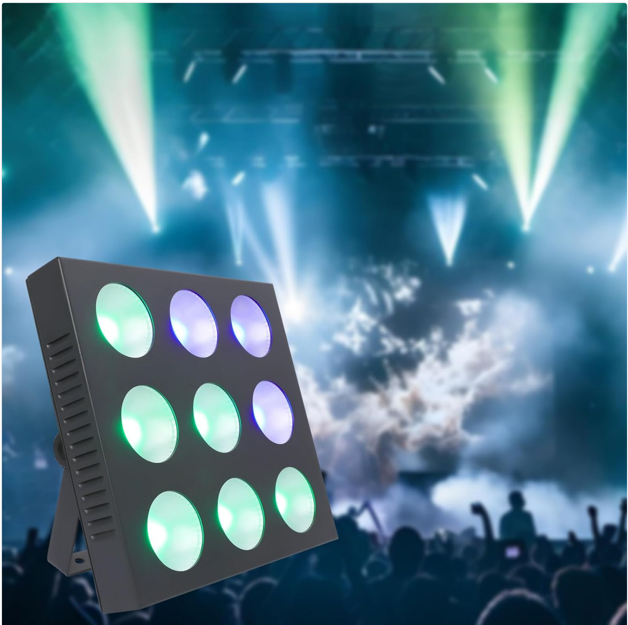
Image: The Kreiaoer Stage Light projecting green and purple lights onto a crowd at an event. This illustrates the vibrant lighting capabilities of the device.