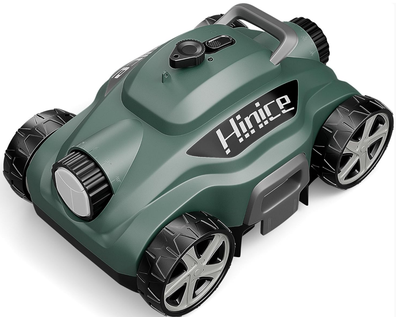
Image 1.1: The Hinice Cordless Robotic Pool Vacuum, showcasing its compact and robust design.