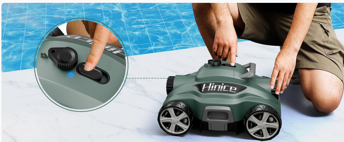
Image 6.1: Activating the pool cleaner by pressing the power switch.