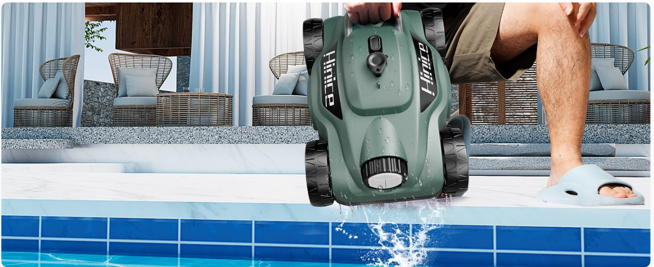
Image 6.3: Lifting the pool cleaner from the water after a cleaning cycle.