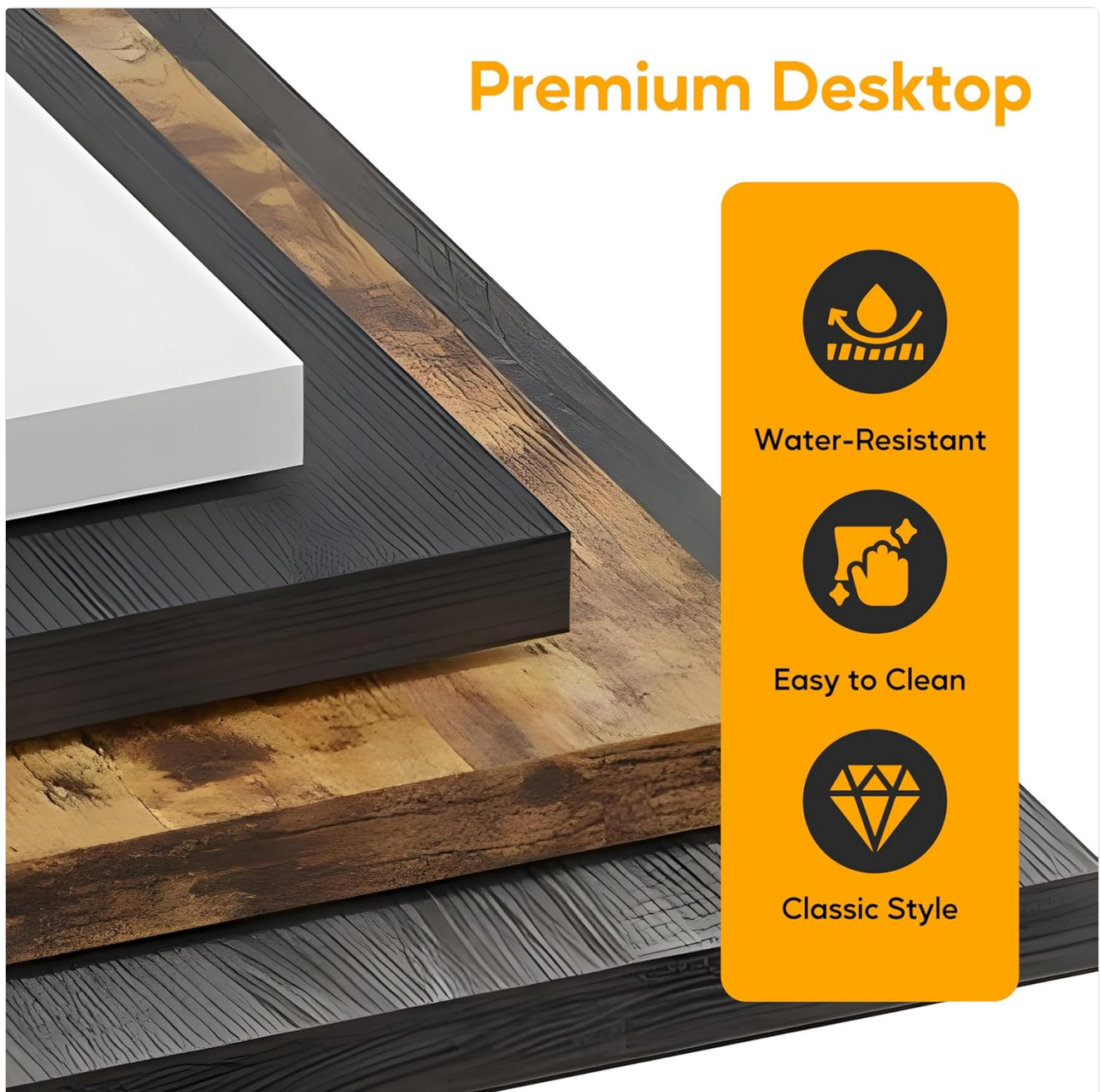
Image: Premium Desktop features: Water-Resistant, Easy to Clean, Classic Style.