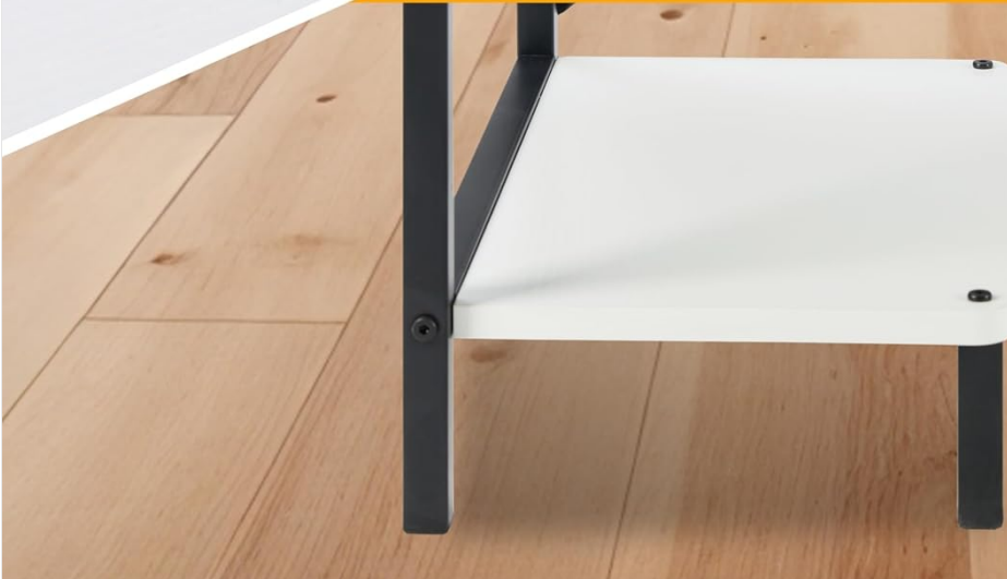
Image: Functional elements of the desk: Waterproof Desktop, Side Storage Bag, and CPU Tray.