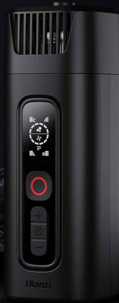
Figure 2: A clear view of the ULANZI FM01 FILMOG Ace Portable Fog Machine, showing its compact design and main body.