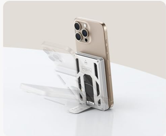
Figure 6: The foldable stand allows for versatile viewing angles while charging.