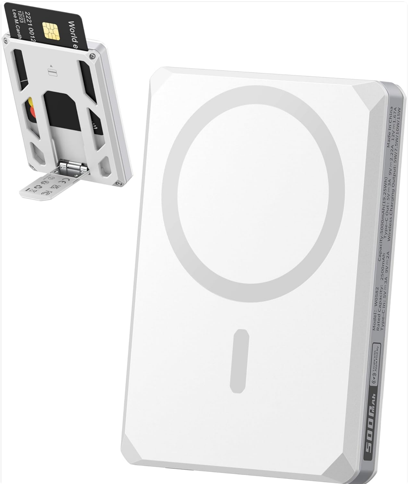
Figure 1: The VEGER Wireless Portable Charger, showcasing its sleek design and integrated card holder.