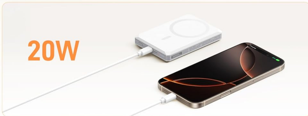
Figure 5: The power bank offers both 15W wireless and 20W wired fast charging.