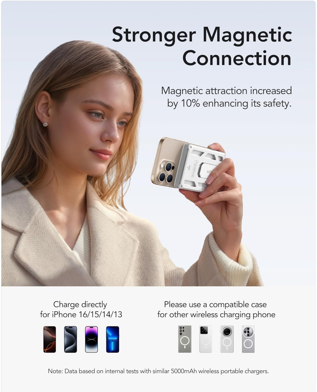
Figure 3: Demonstrating the strong magnetic connection for wireless charging.

The power bank supports 15W wireless fast charging for iPhone 16/15/14/13/12 series and other compatible wireless-charging devices. Simply align your device with the magnetic charging area on the power bank. The powerful magnetic attachment ensures stable and efficient charging.