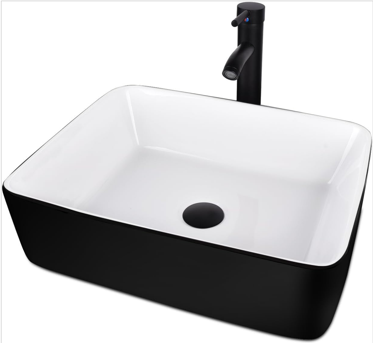
A detailed view of the black and white ceramic vessel sink, showcasing its rectangular shape and contrasting colors.

Install the faucet and pop-up drain onto the ceramic vessel sink. Carefully place the assembled sink onto the vanity cabinet. Ensure all plumbing connections are secure and watertight.