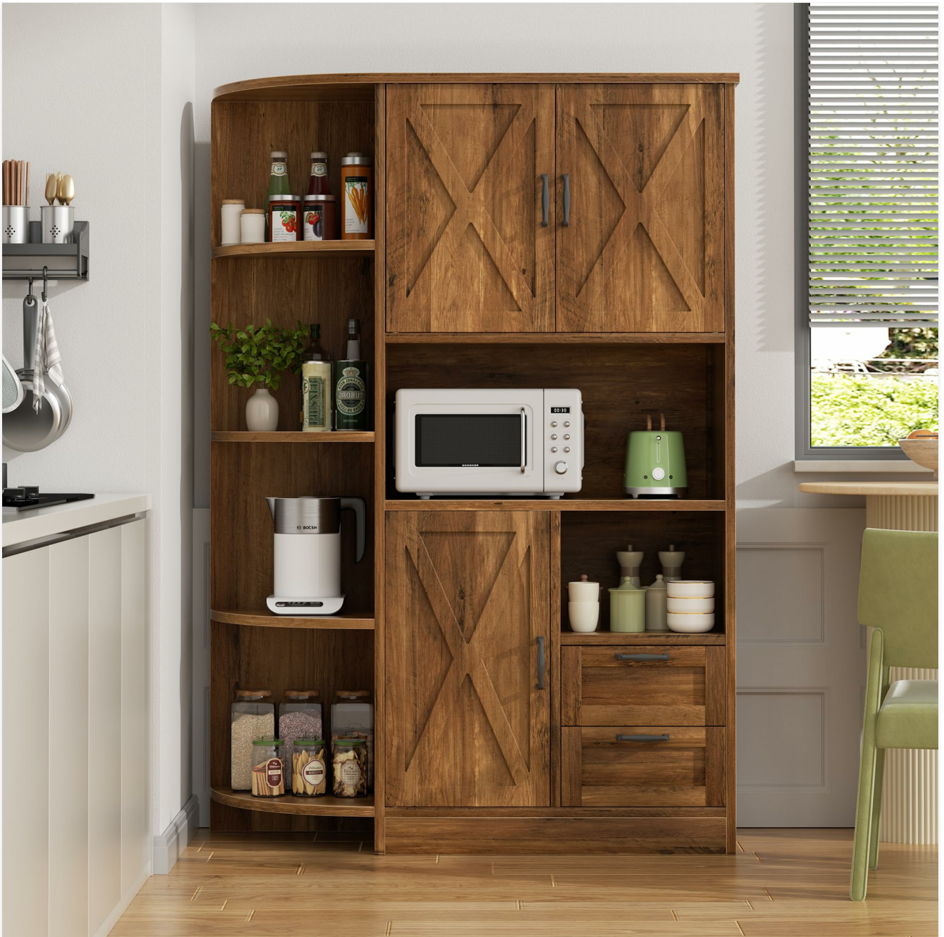
Image: The Shintenchi 61" Tall Kitchen Pantry Storage Cabinet, showcasing its overall design and rustic brown finish.