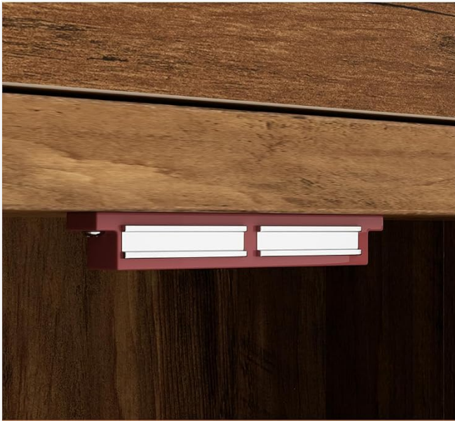
Magnetic Door Catch