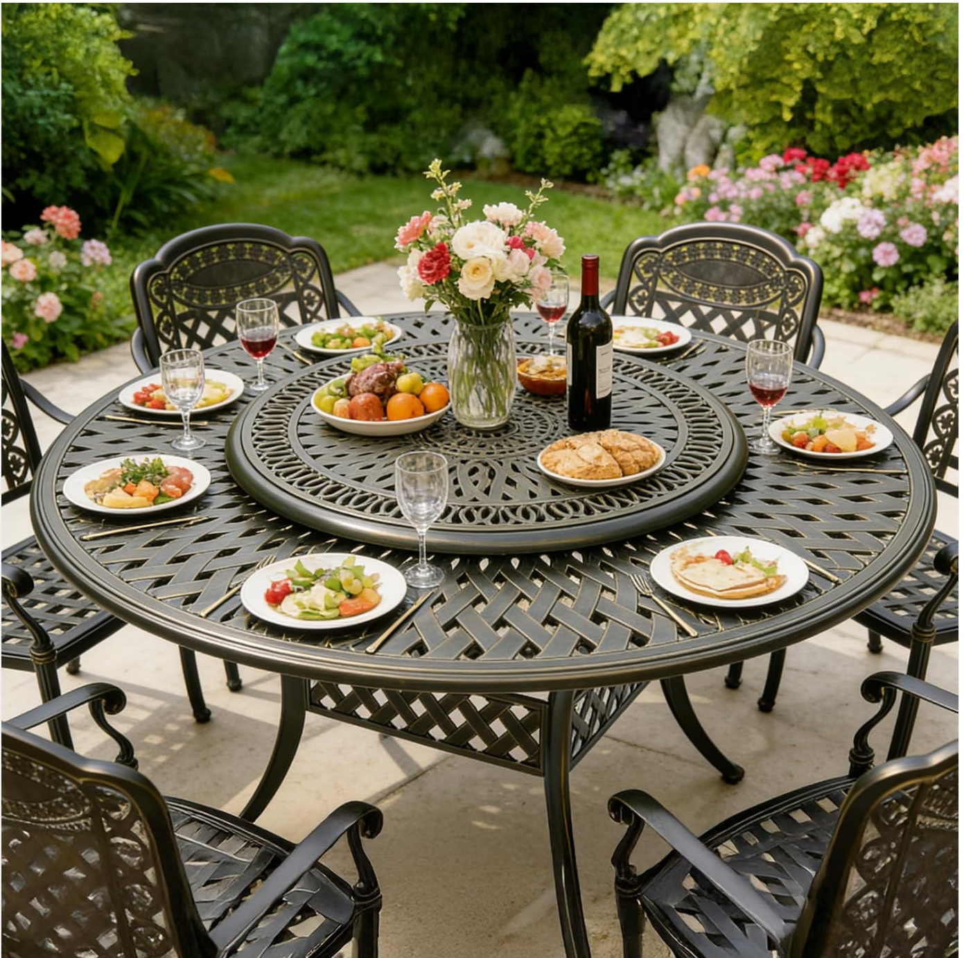
Image: The MEETWARM 61-inch round patio dining table with its detachable lazy susan, shown fully assembled and set for dining in an outdoor garden setting.