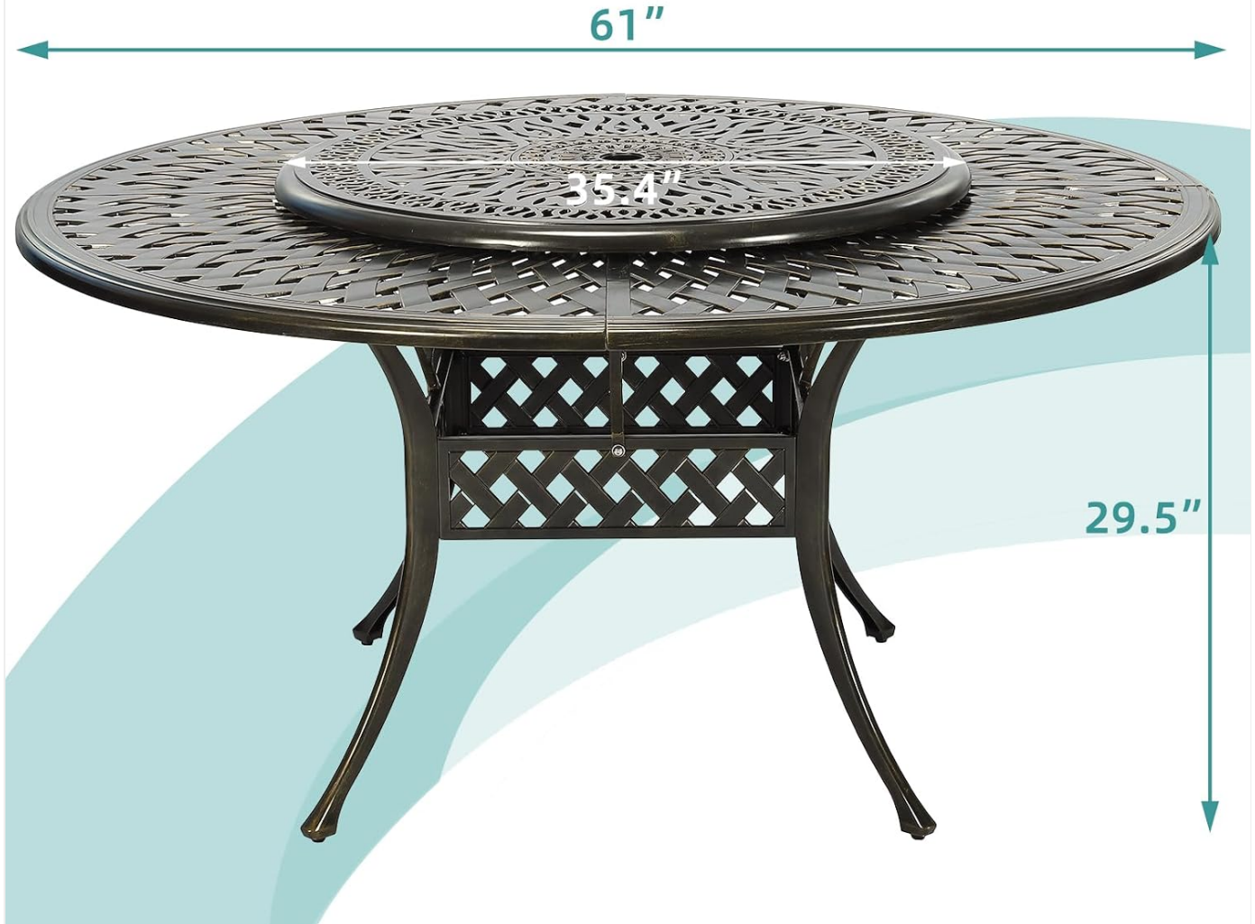
Image: A visual representation of the table's key dimensions, including the overall diameter, height, and lazy susan diameter.