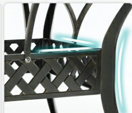
Reinforced Leg Frame/ Support Plate