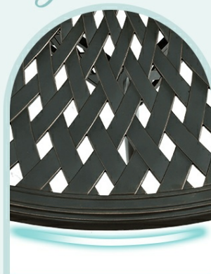
Retro Pattern/ Smooth Rounded Corners