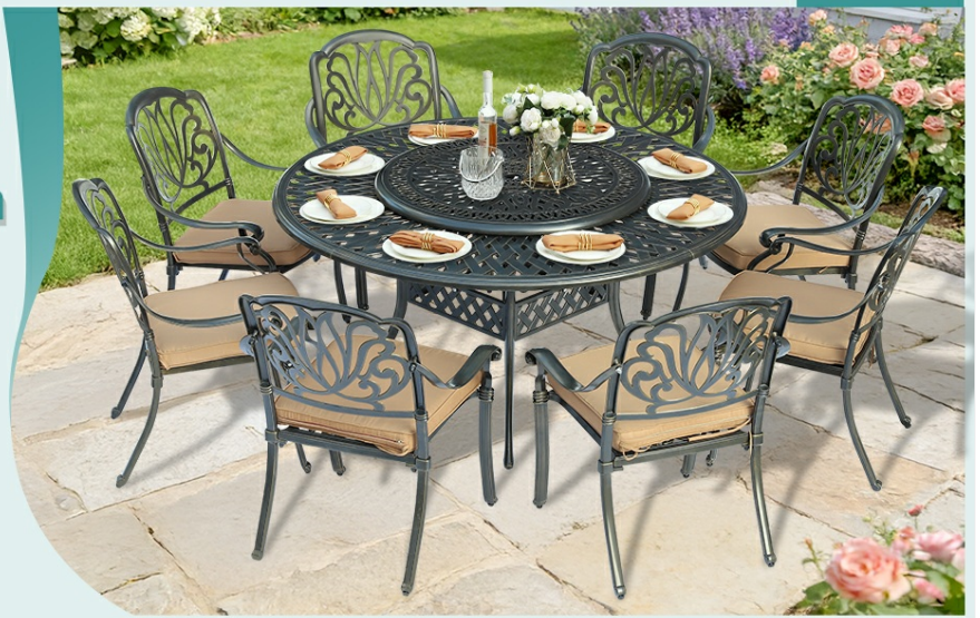
Image: The detachable lazy susan in action, demonstrating its smooth 360-degree rotation for easy access to items.