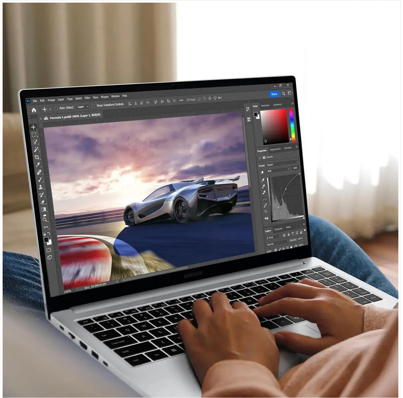
Image: A user engaged in photo editing on the SAMSUNG Galaxy BOOK4, highlighting the laptop's vibrant display and capability for demanding applications.