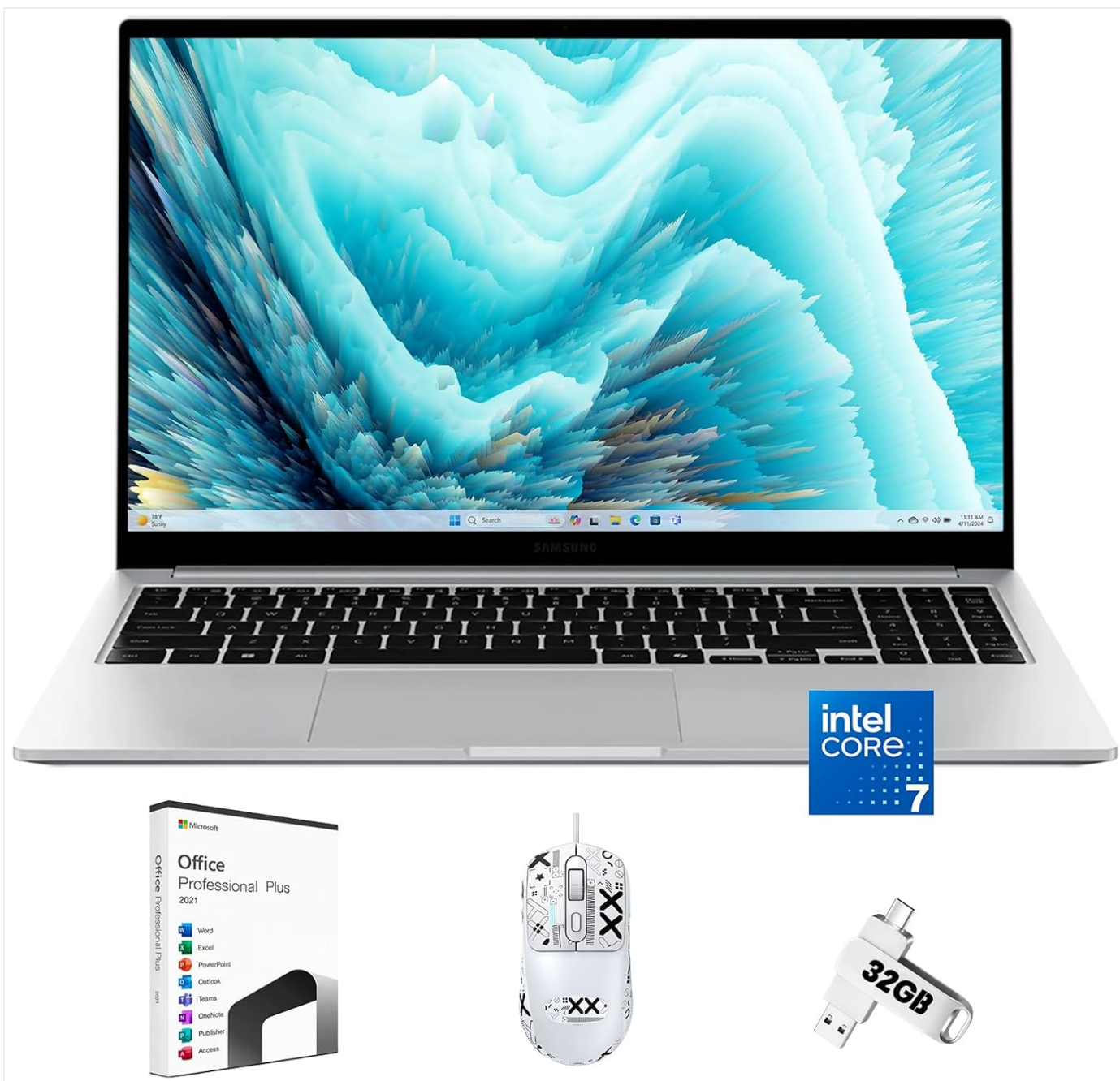
Image: The SAMSUNG Galaxy BOOK4 laptop, showcasing its sleek design, accompanied by the Microsoft Office software box, a wireless mouse, and a 32GB flash drive, all included with the product.