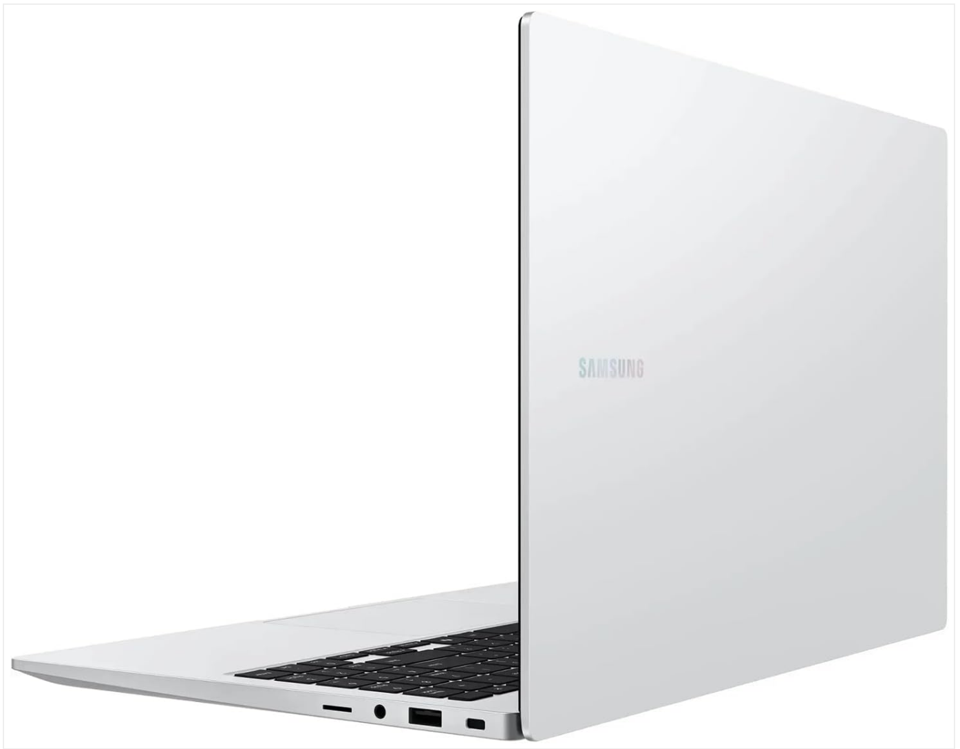
Image: A side view of the SAMSUNG Galaxy BOOK4, emphasizing its slim and elegant profile, which contributes to its portability.