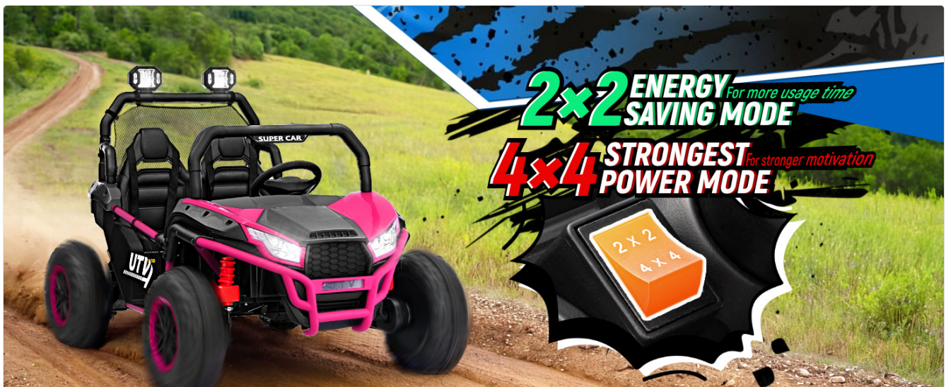
Image: A close-up of the 2WD/4WD switch, illustrating the energy-saving mode (2x2) for longer usage time and the strongest power