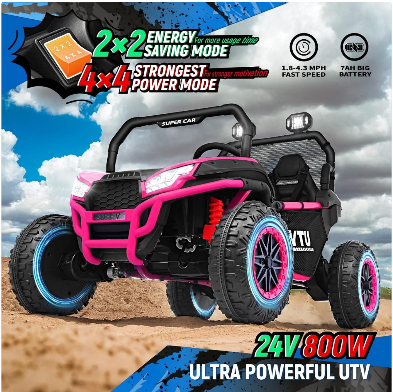
Image: Visual representation of the UTV's key features including 2WD/4WD switchable modes, 24V 800W ultra-powerful engine, 1.8-4.3 MPH fast speed, and 7AH big battery.