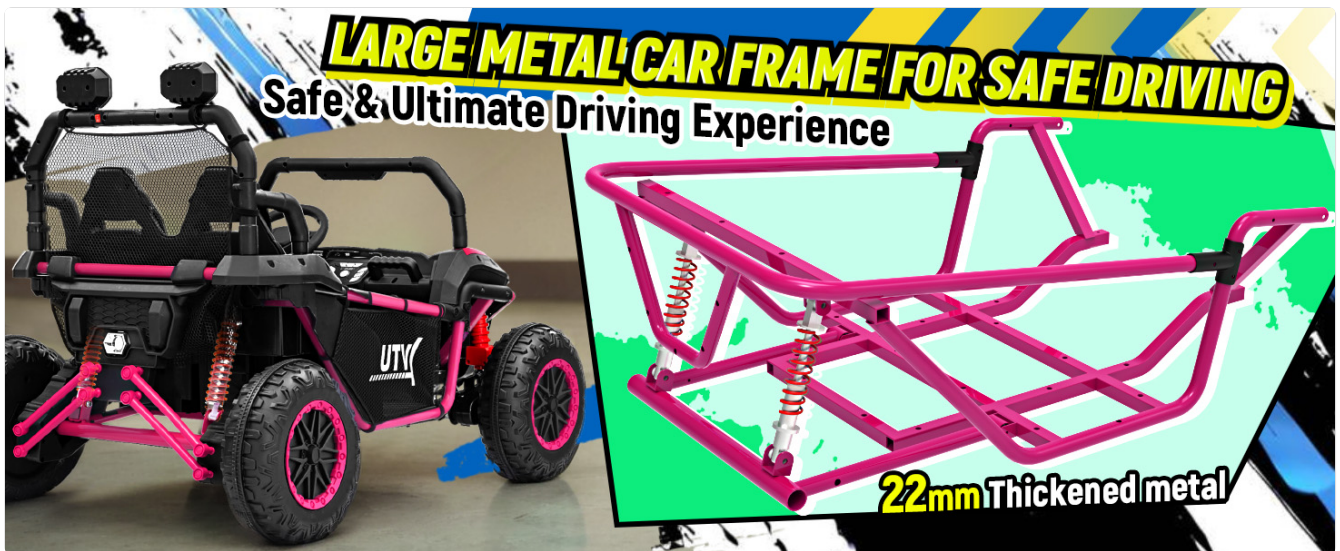
Image: A detailed view of the UTV's large metal car frame, emphasizing its 22mm thickened metal construction for safe and ultimate driving experience.