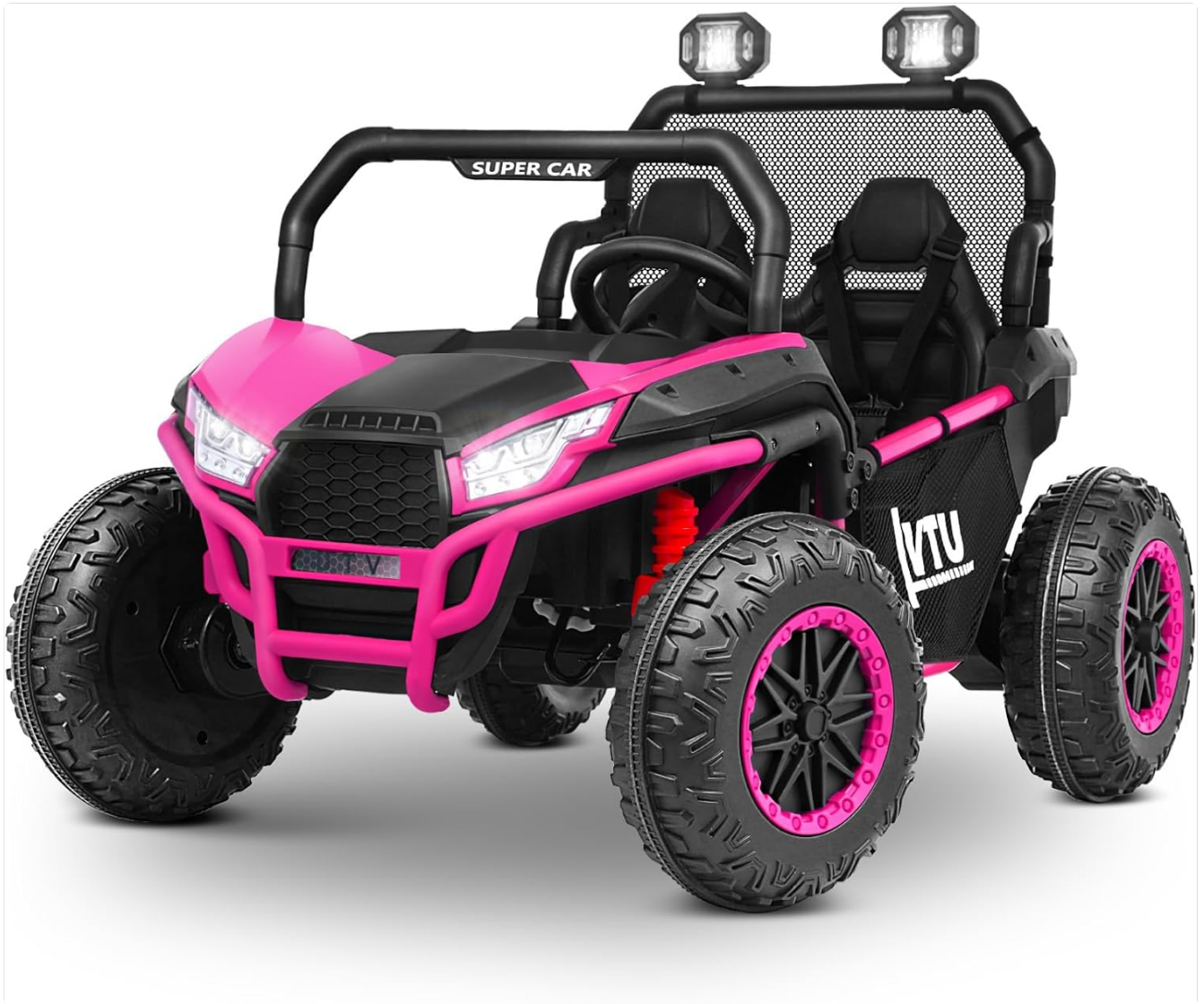
Image: The Joywhale 24V 2-Seater Kids Ride on UTV in pink, showcasing its robust design and dual headlights.