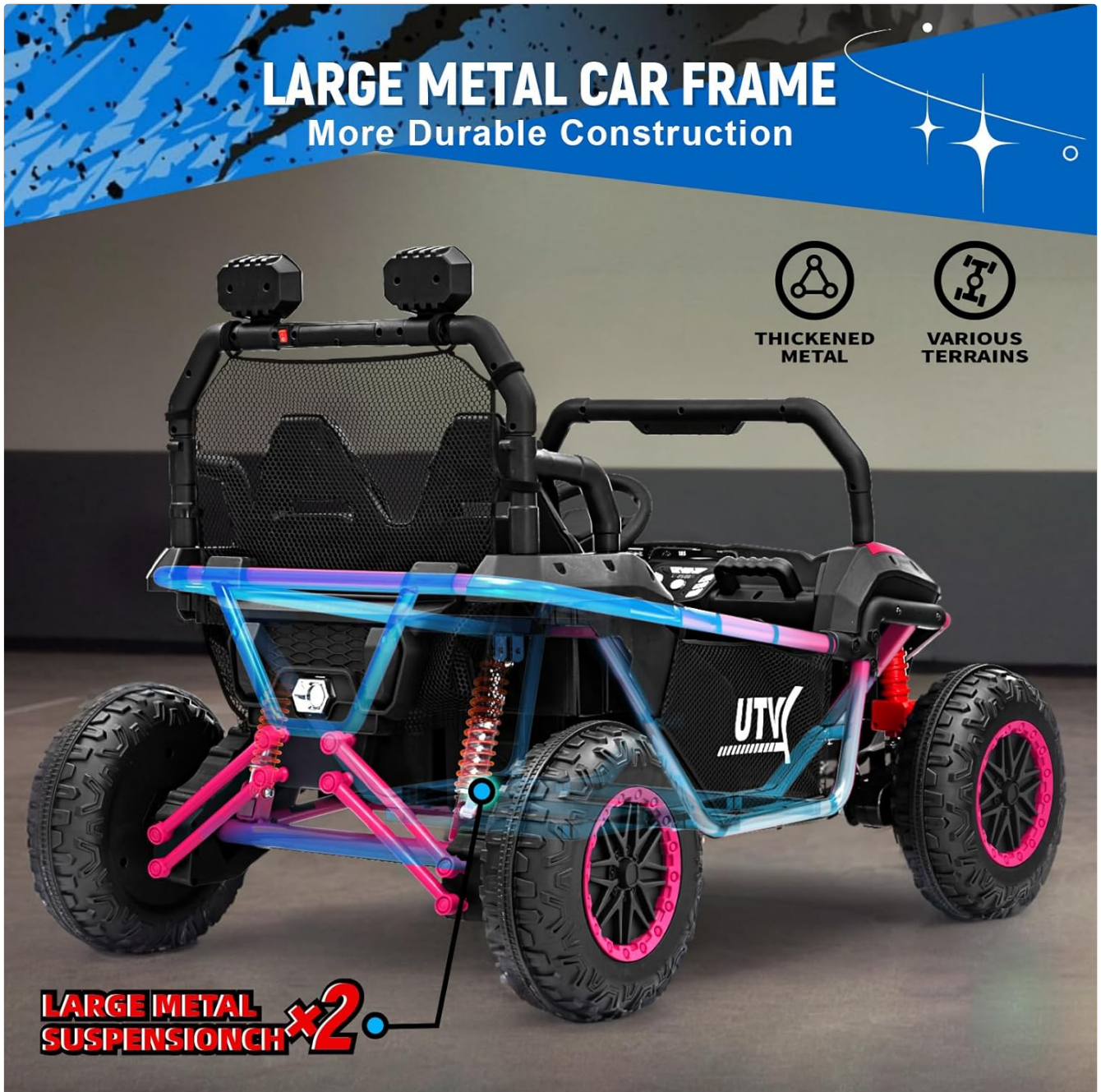
Image: The UTV's sturdy metal car frame and large metal suspension system, highlighting the durable construction.