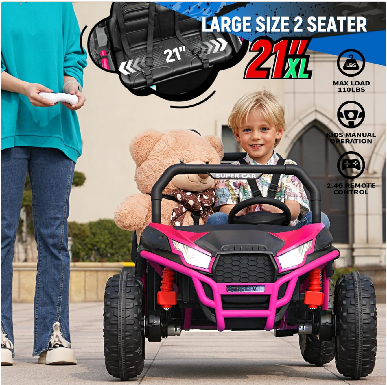
Image: A child seated in the 21-inch XL wide UTV, demonstrating the two-seater capacity and the option for kids' manual operation or 2.4G remote control by an adult.