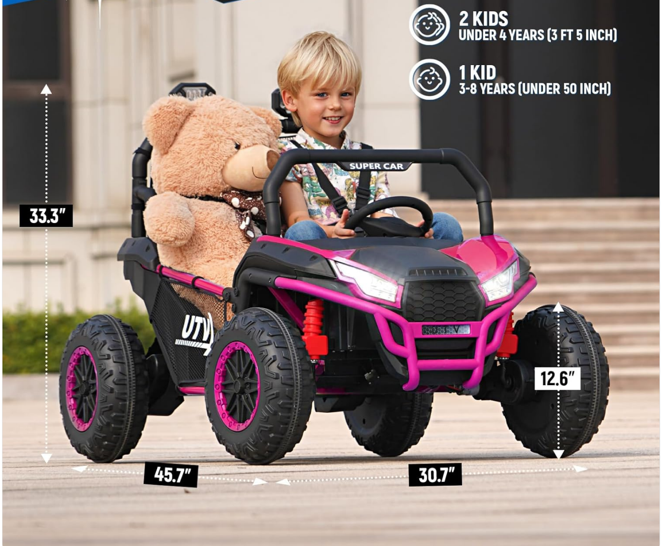
Image: A visual representation of the UTV's dimensions, including overall length (45.7"), width (30.7"), height (33.3"), and wheel diameter (12.6").