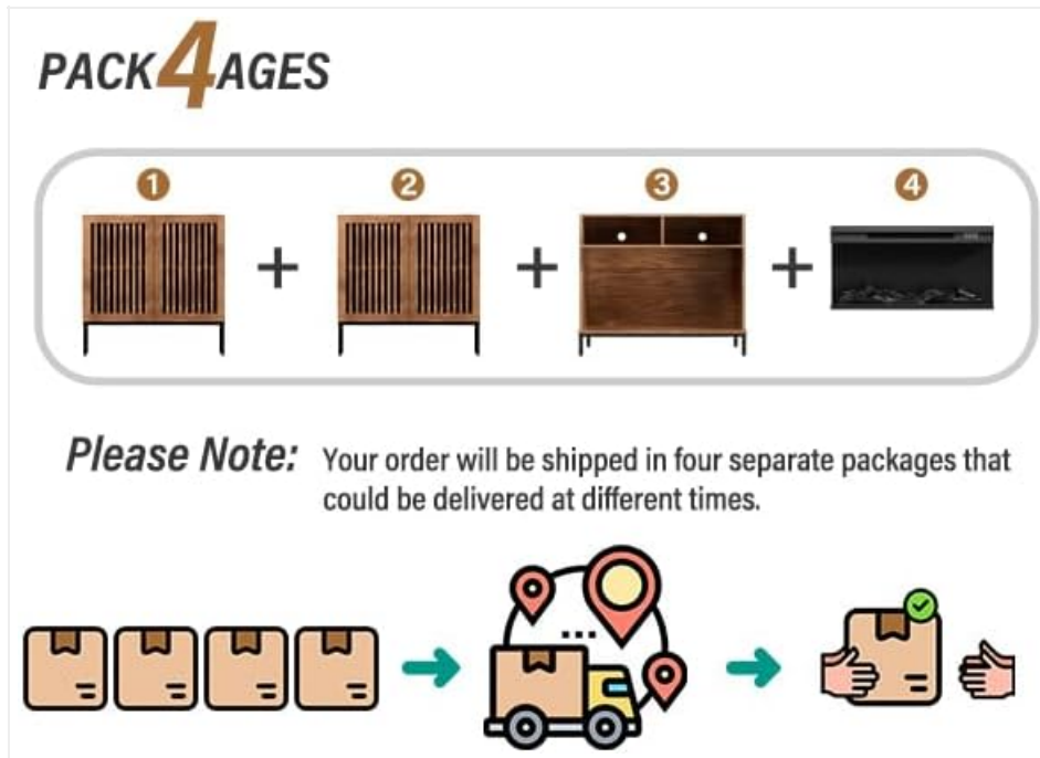
Image: A diagram illustrating that the product is delivered in four separate packages, which may arrive at different times.

have arrived before beginning assembly. Verify that all components and hardware listed in the instruction manual are present and undamaged.