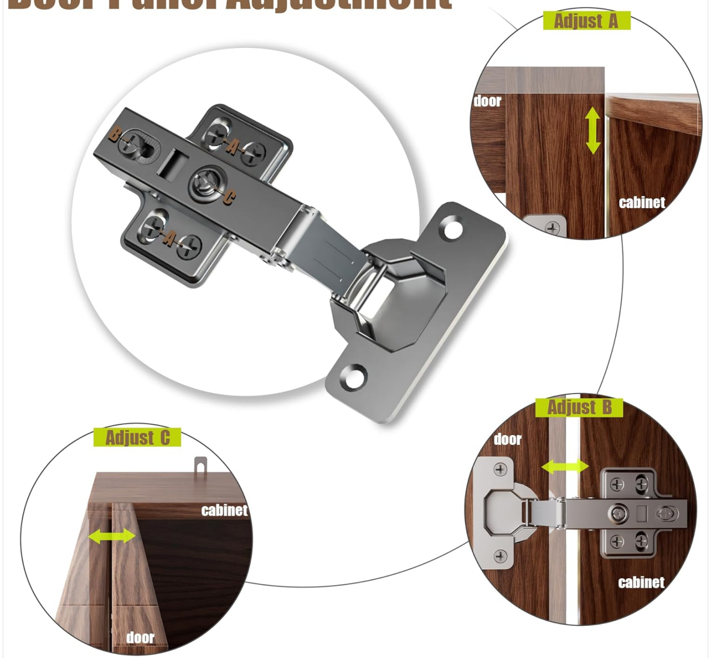
Image: A detailed diagram illustrating how to adjust the door panels for proper alignment and function.