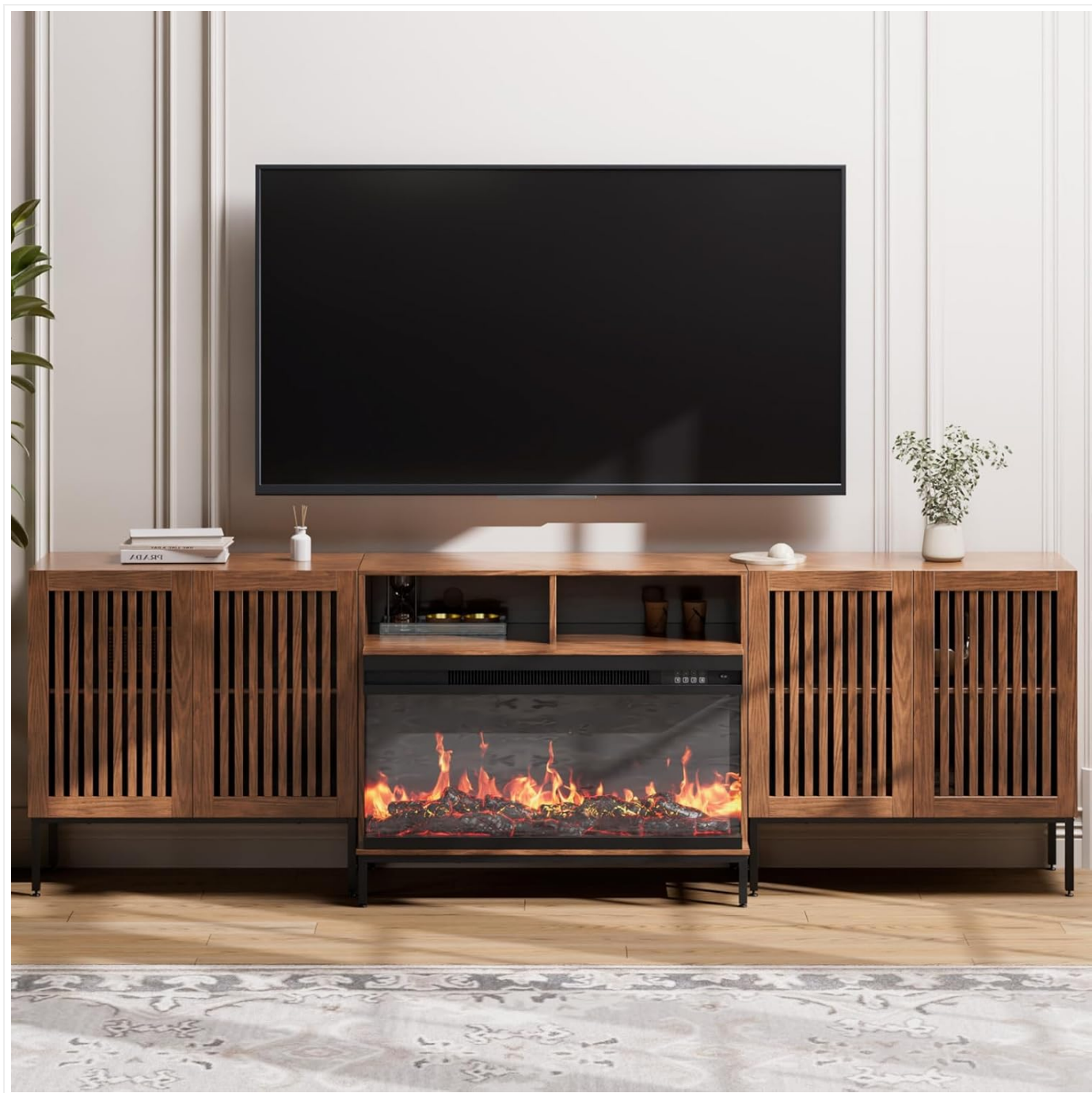
Image: The BVIUN TWO 100 Inch Farmhouse Fireplace TV Stand, fully assembled, featuring a 36-inch electric fireplace and ample storage, with a television placed on top.