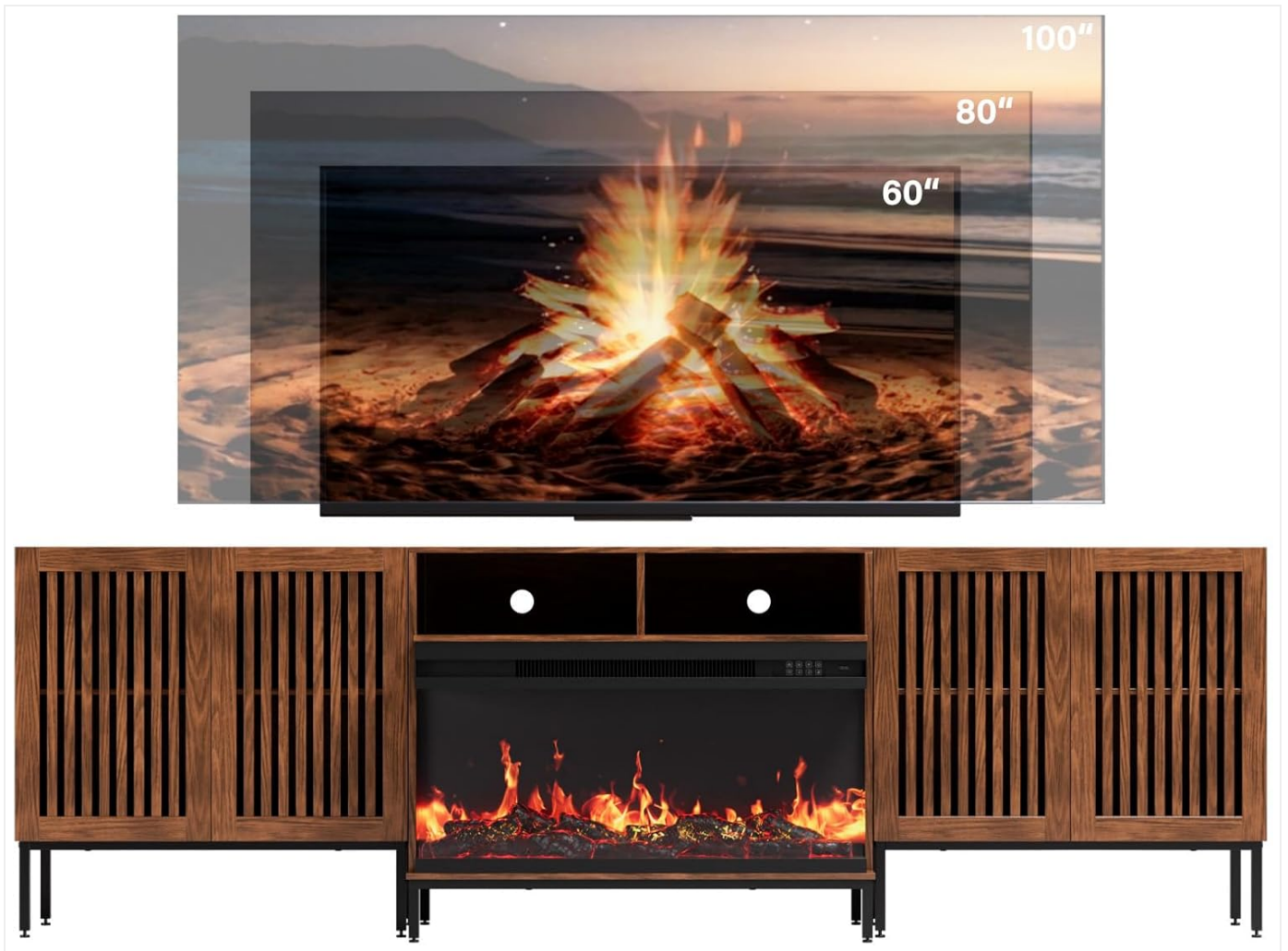
Image: A visual comparison demonstrating how different TV sizes (60, 80, and 100 inches) fit on or above the TV stand.