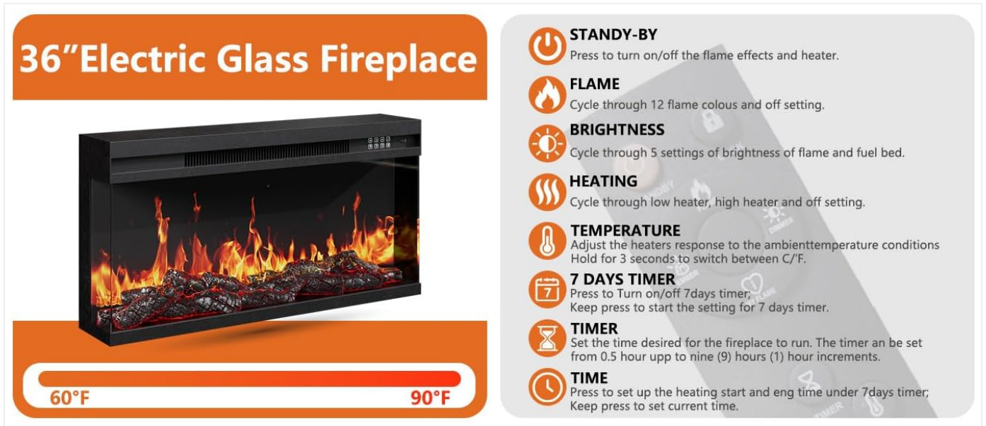
Image: A visual guide detailing the functions of the 36-inch electric glass fireplace controls, including temperature range and timer settings.