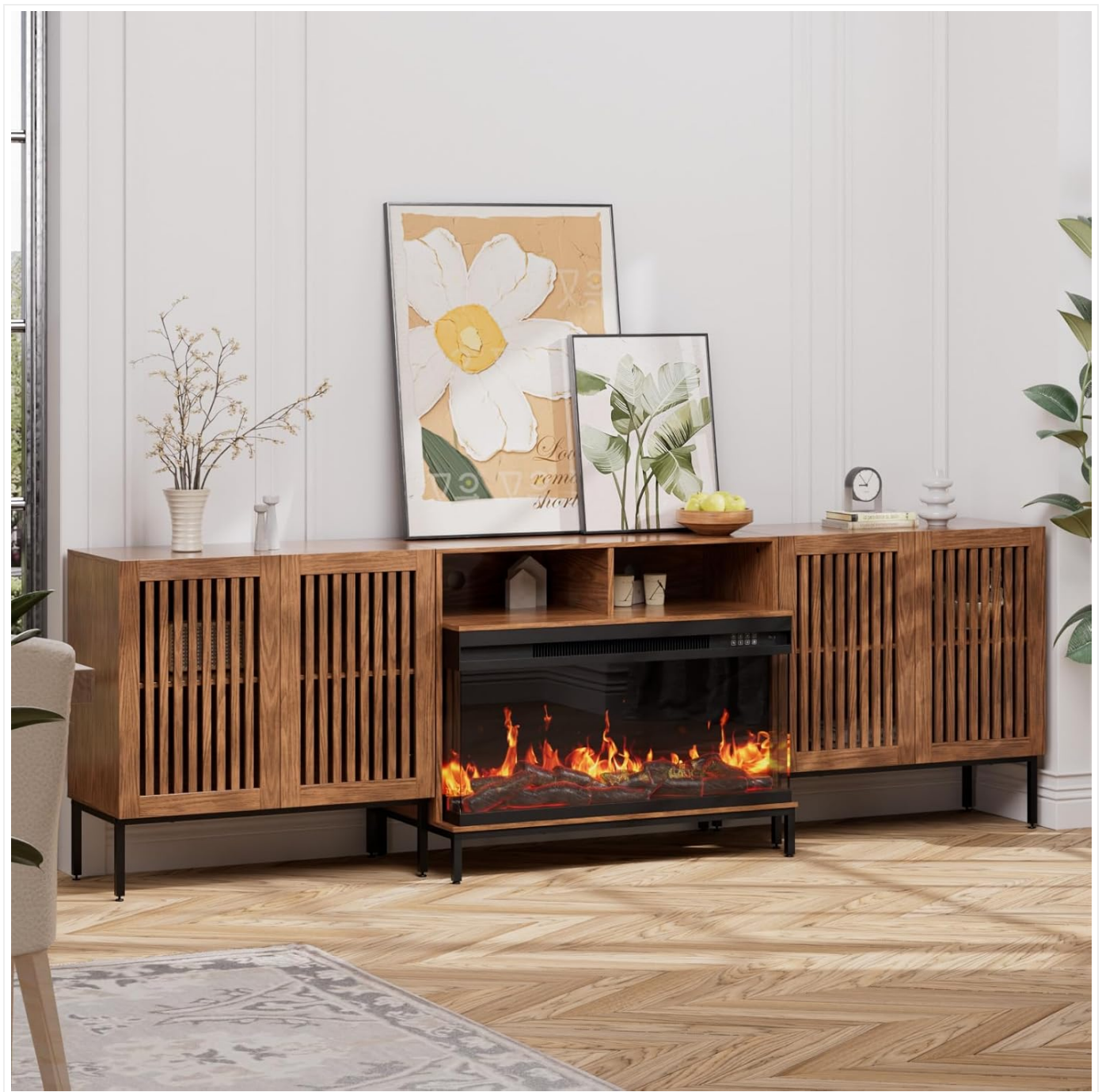
Image: A lifestyle view of the BVIUN TWO 100 Inch Farmhouse Fireplace TV Stand, showcasing its design and functionality within a living room environment.