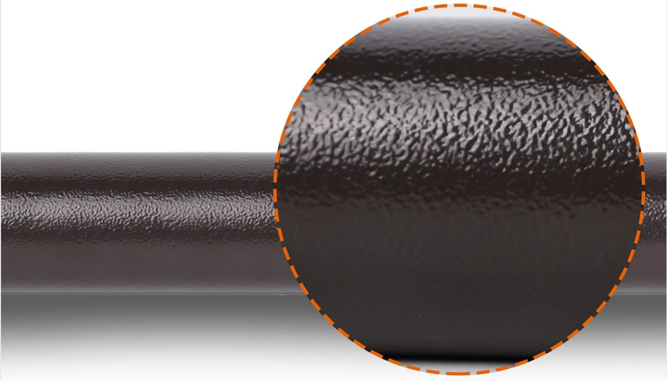
Image 2.2: Close-up view highlighting the heavy-duty aluminum construction and textured powder-coated finish.