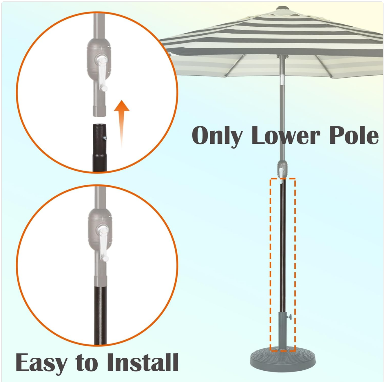
Image 4.1: Visual guide demonstrating the simple process of connecting the lower pole to the umbrella's upper section.