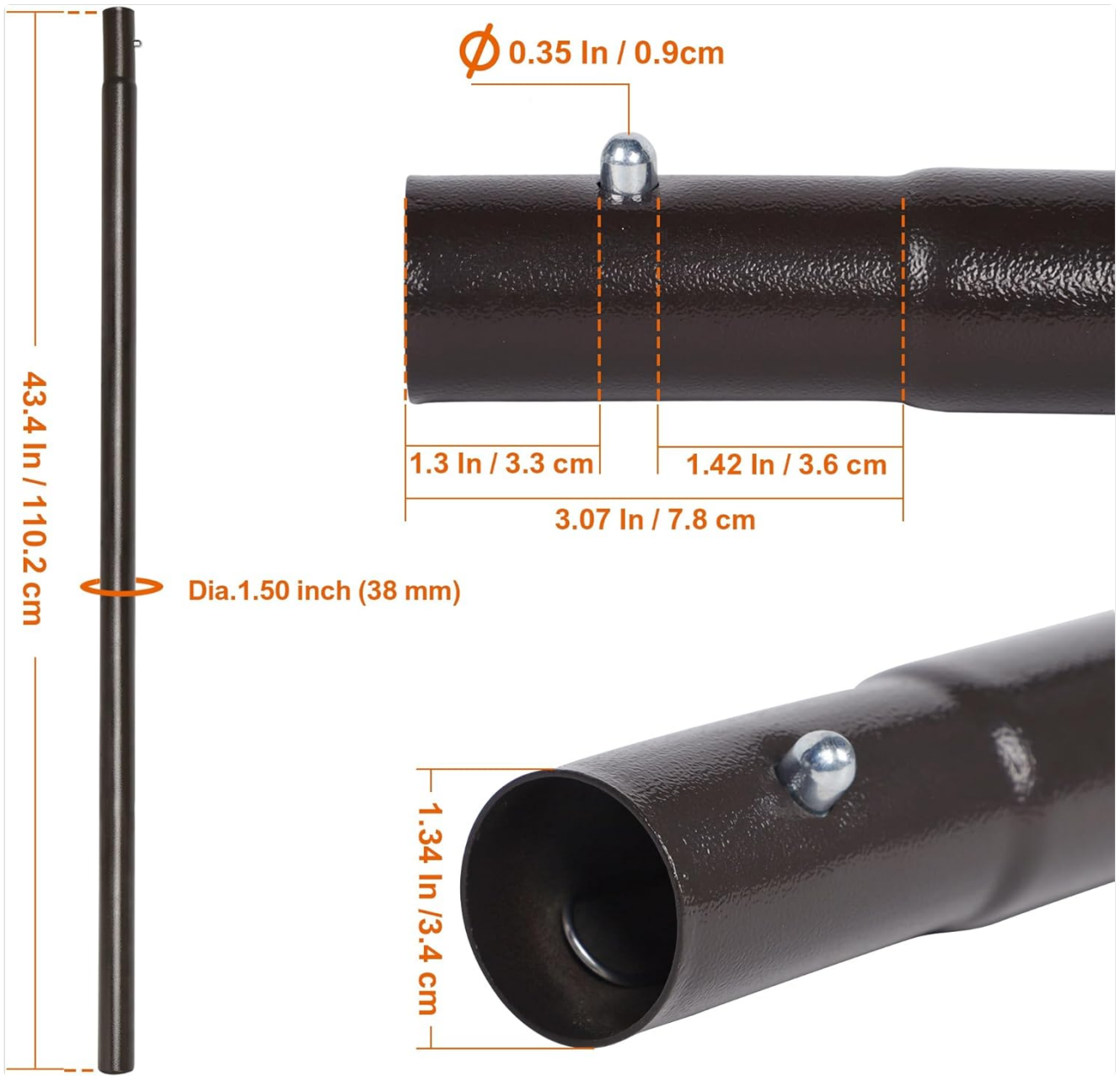
Image 2.1: Detailed measurements of the replacement lower pole, including overall length, diameters, and connection section dimensions.