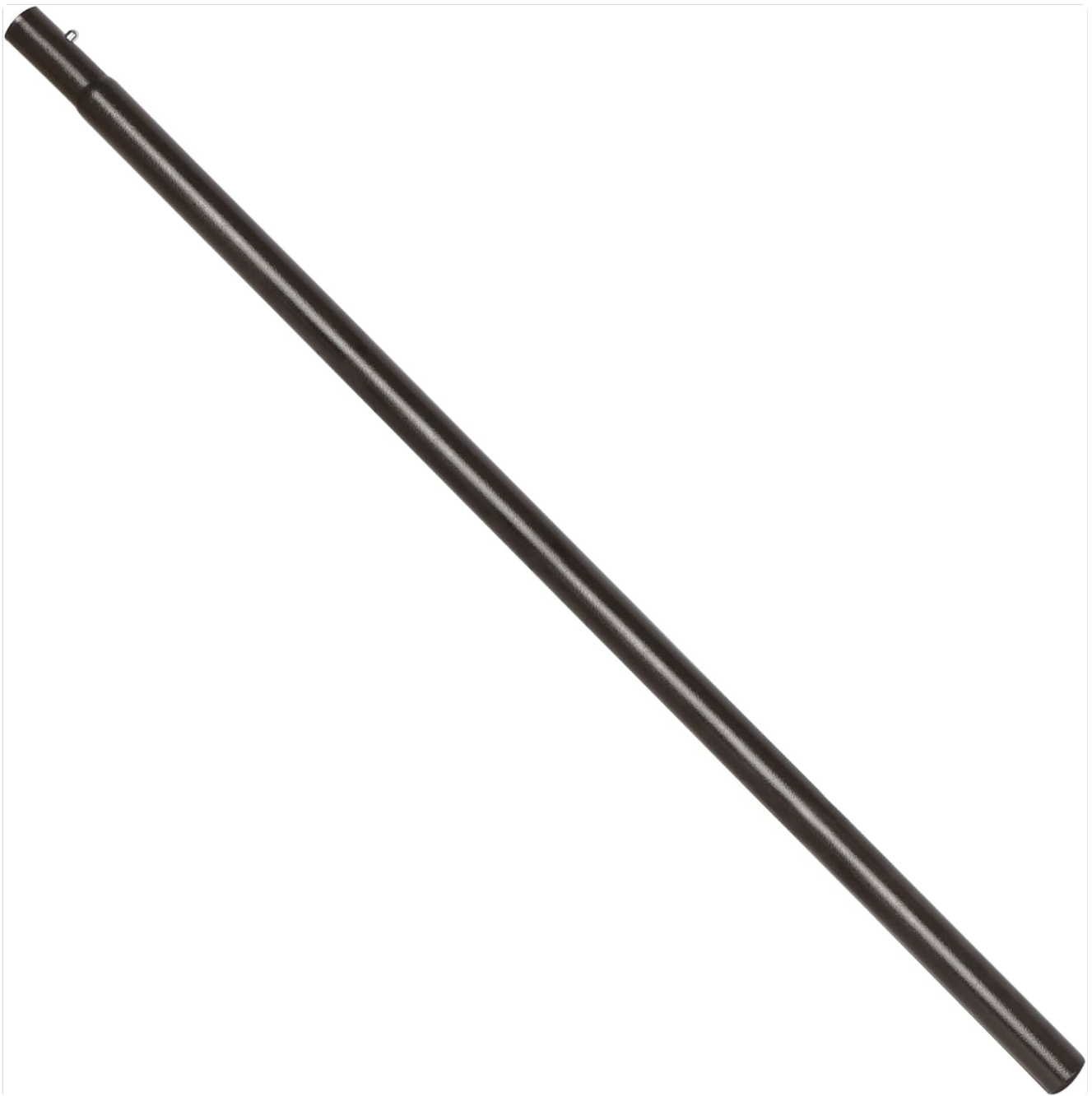
Image 1.1: The Blissun Umbrella Replacement Lower Pole, bronze color.