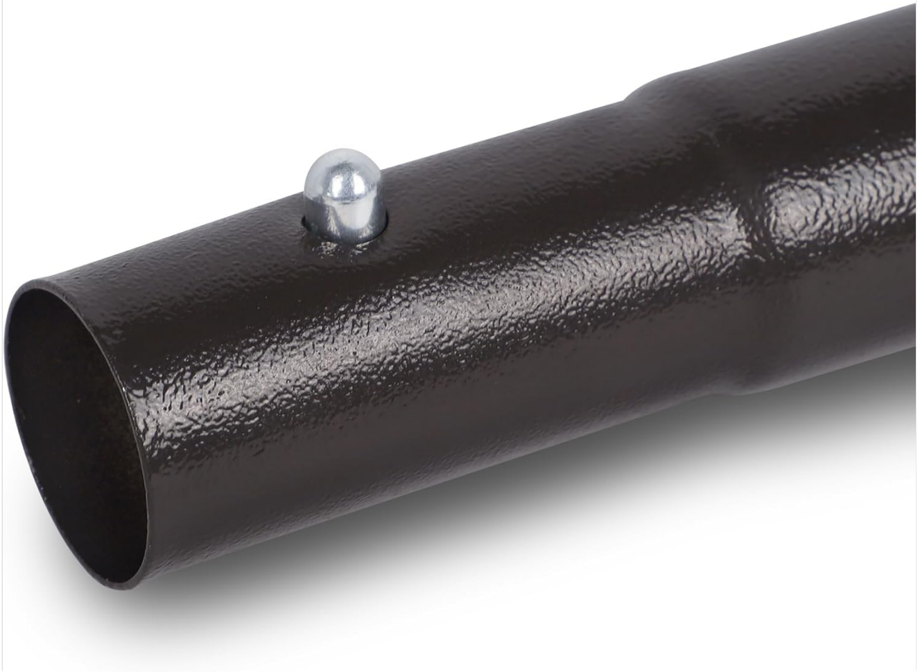
Image 4.2: Detail of the bullet buckle, which provides a secure and stable connection for the umbrella pole.

Umbrella lower pole with bullet buckle for improved stability and easy installation