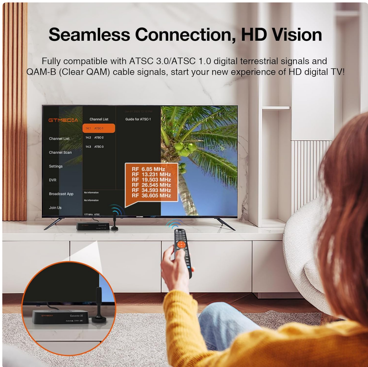
Image: Seamless connection and HD vision through the converter's interface.