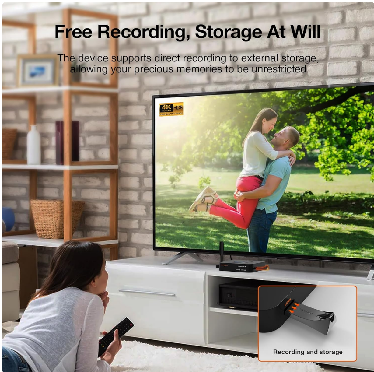
Image: Demonstrating DVR recording to external storage.

Your browser does not support the video tag.