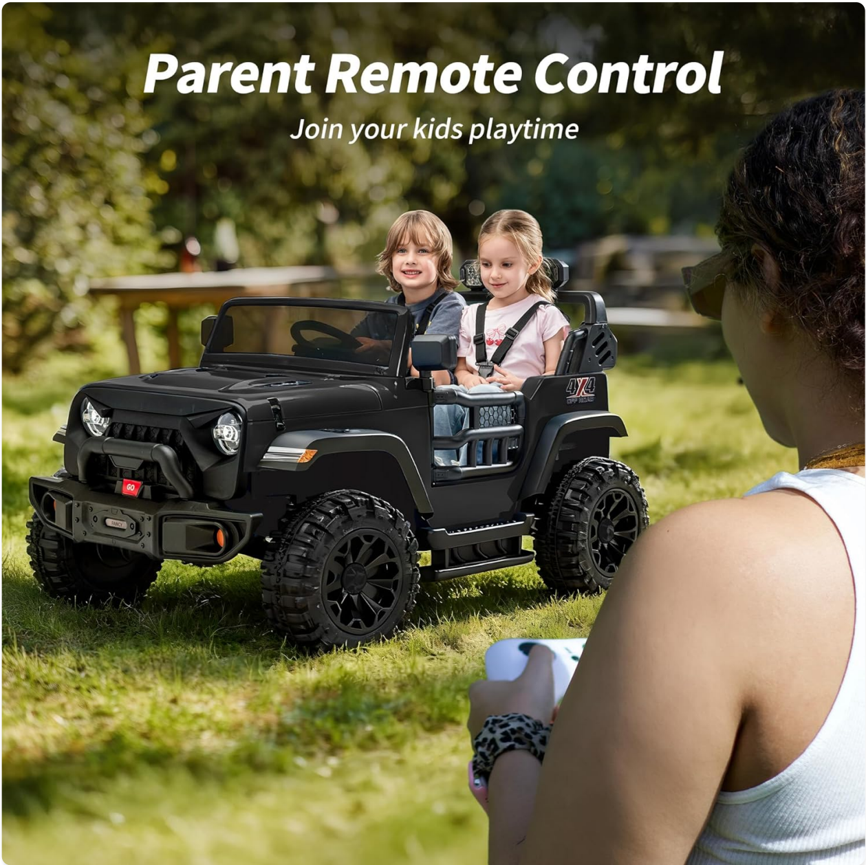
Image: A parent operating the ride-on car using the remote control, demonstrating the parental control feature.

Your browser does not support the video tag.