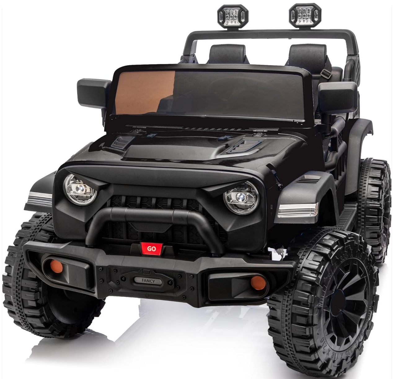
Image: The Outfunny 24V 4WD Electric Ride-On Car, showcasing its robust design and features.