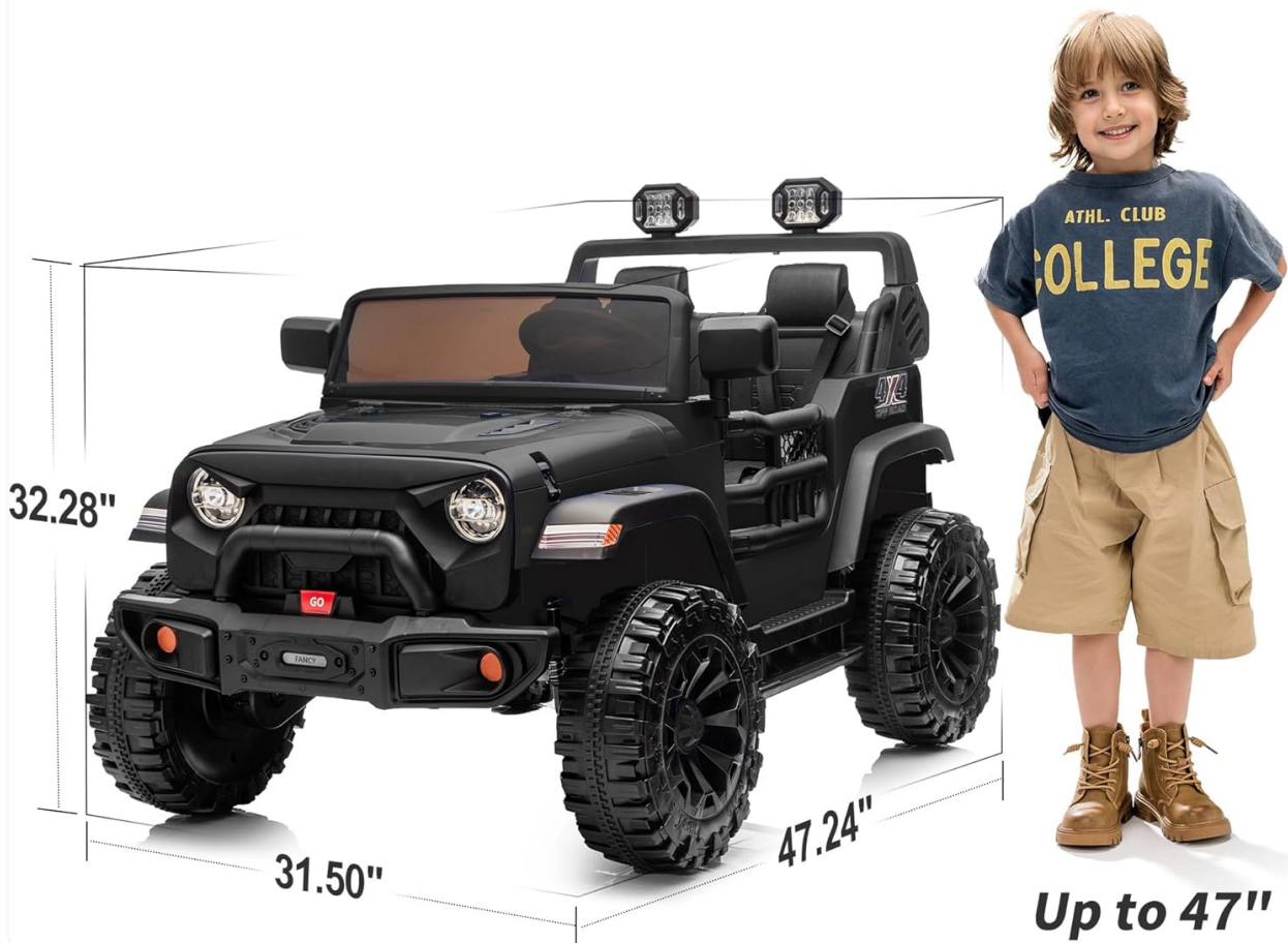
Image: Visual representation of the product dimensions, recommended age, and load capacity.