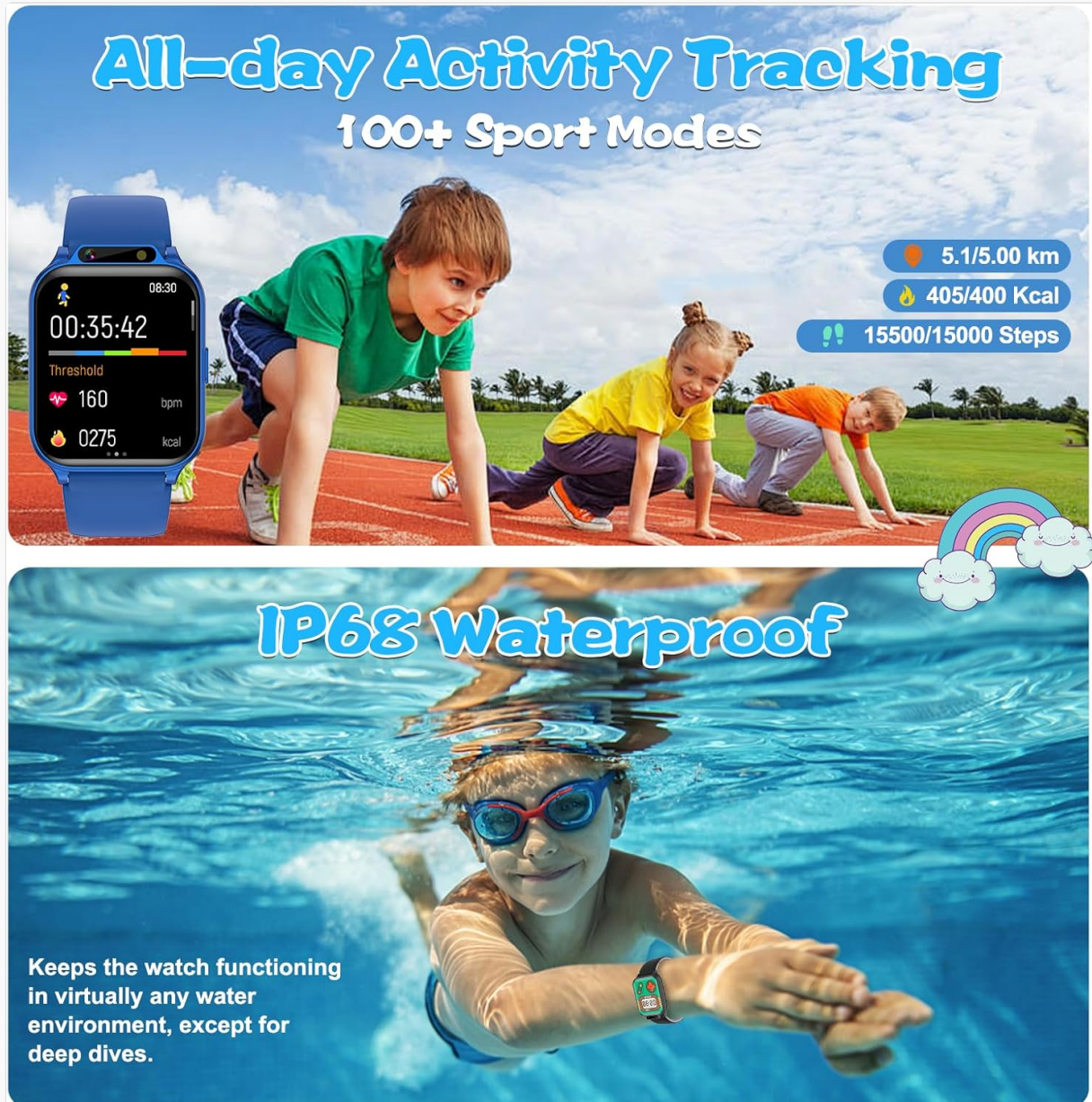
Figure 4: The smart watch tracks daily activity and offers over 100 sport modes for various physical activities.

The watch automatically tracks steps, distance, calories burned, and active minutes. It supports over 100 sport modes, allowing users to monitor specific activities like running, walking, cycling, and more. Data can be viewed on the watch and in the connected app.