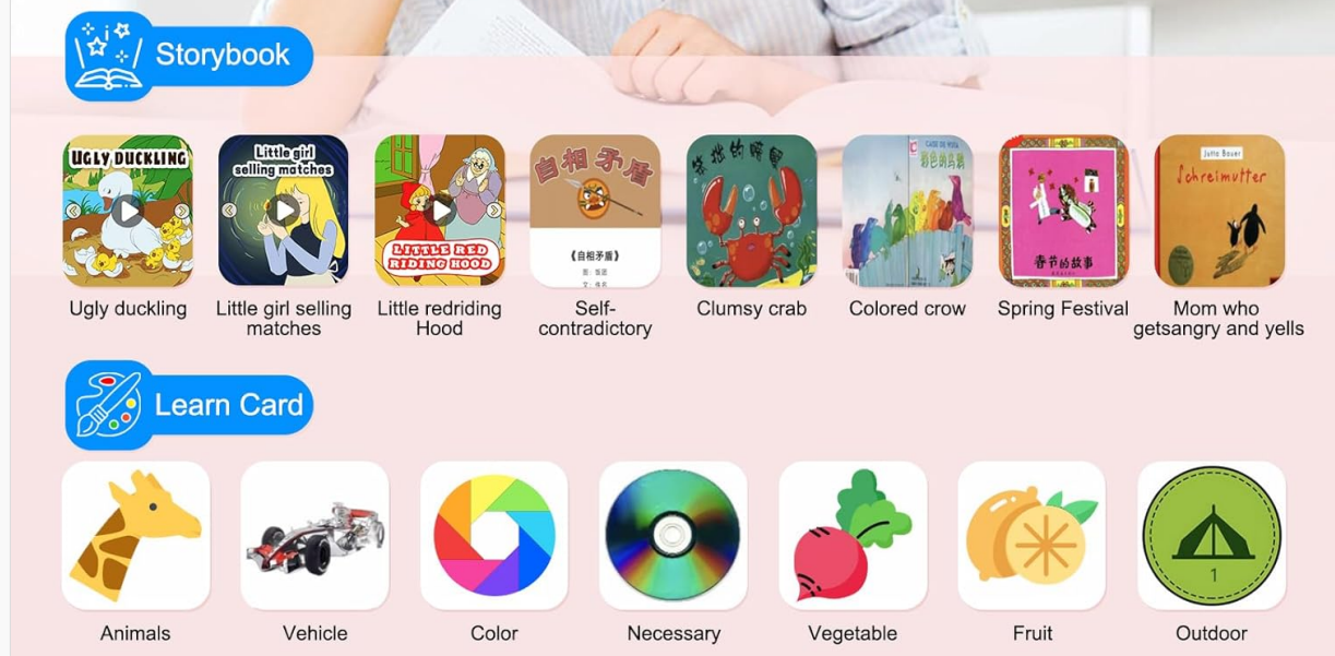
Figure 8: The watch offers audiobooks and learning cards to assist children's studies.