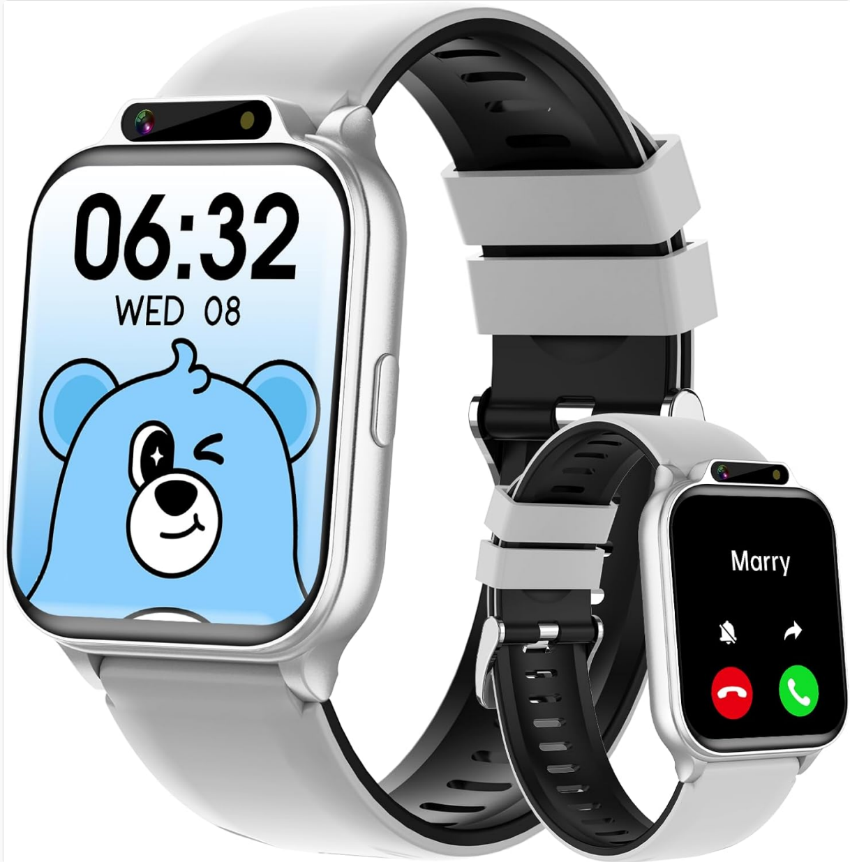
Figure 1: The Monowul Smart Watch for Kids, Model P70.