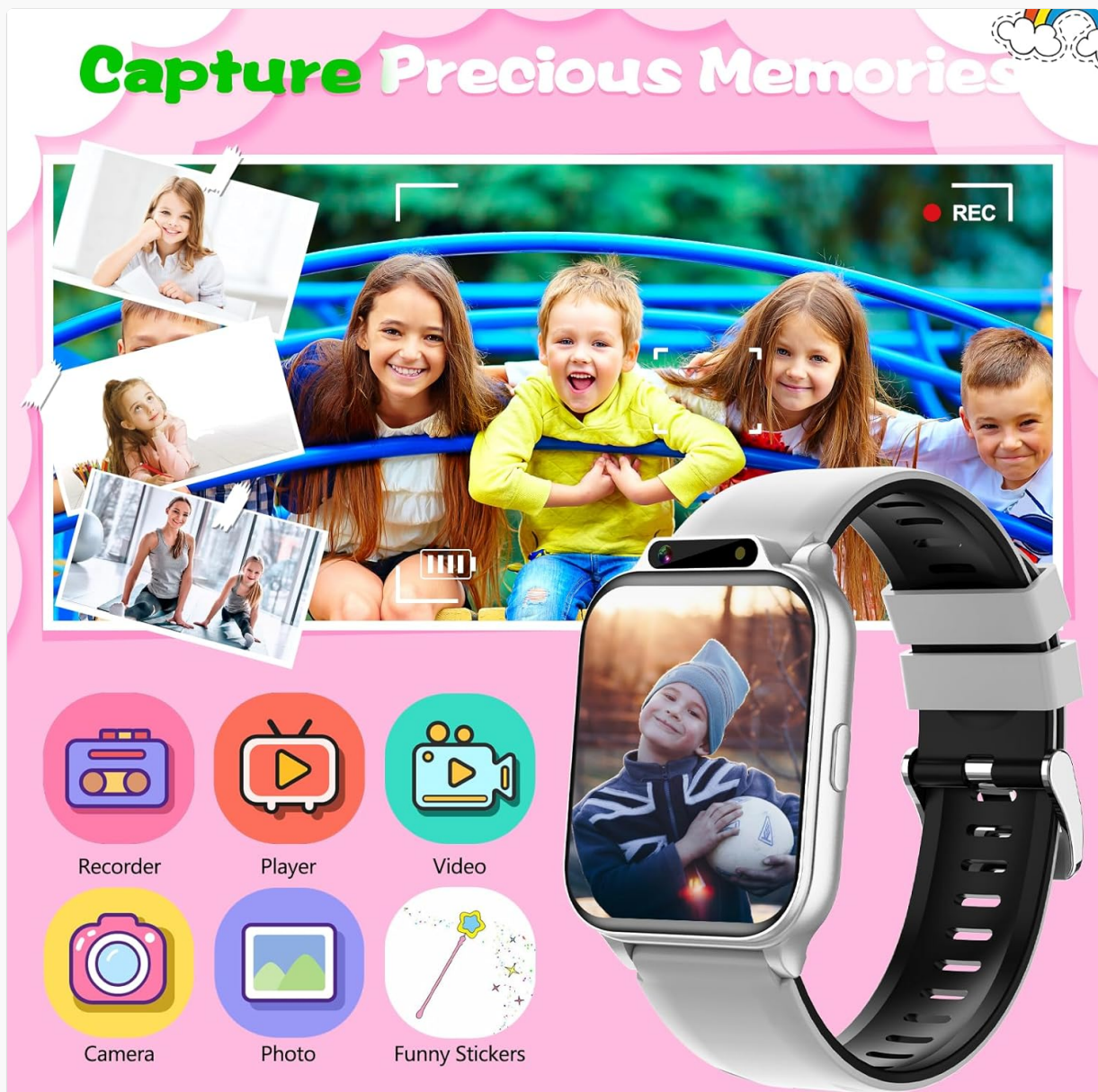
Figure 3: The smart watch allows users to capture photos and videos, with options for fun stickers.

The watch is equipped with a camera to take photos and record videos. Access the camera application from the main menu. Photos and videos can be viewed in the gallery. Pop big head stickers are available for creative photo taking.