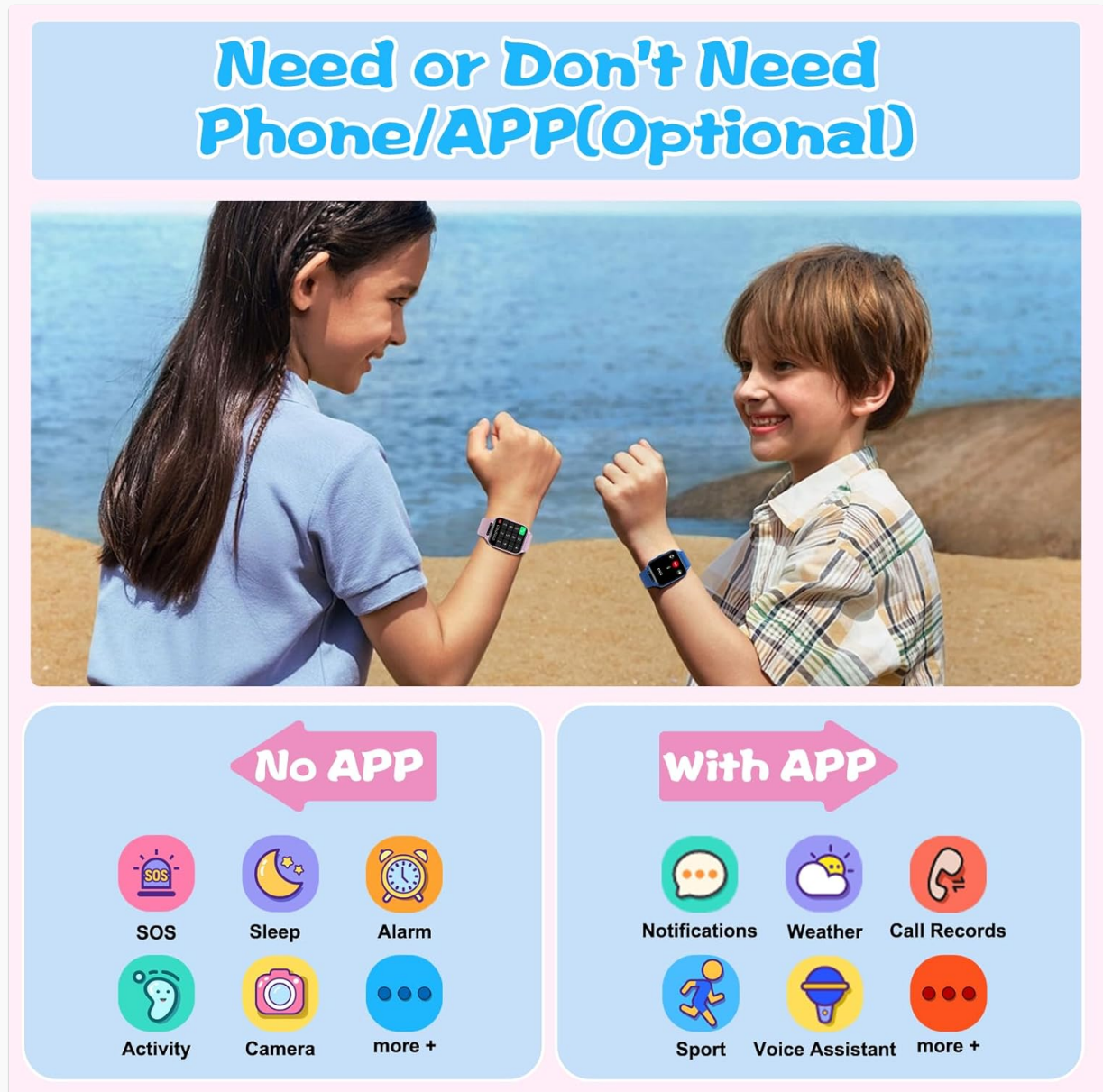
Figure 2: Smart Watch features with and without app connection. Basic functions like SOS, Sleep, Alarm, Activity, Camera work without an app. Advanced features like Notifications, Weather, Call Records, Sport, and Voice Assistant are available with app connection.

The Monowul Smart Watch can function independently for basic features. For advanced functions such as detailed health data analysis, app scheduling for class mode, and downloading storybooks/learning cards, connect the watch to a compatible smartphone (Android 5.0+ or iOS 9.0+). Refer to the watch's settings for Bluetooth pairing instructions.