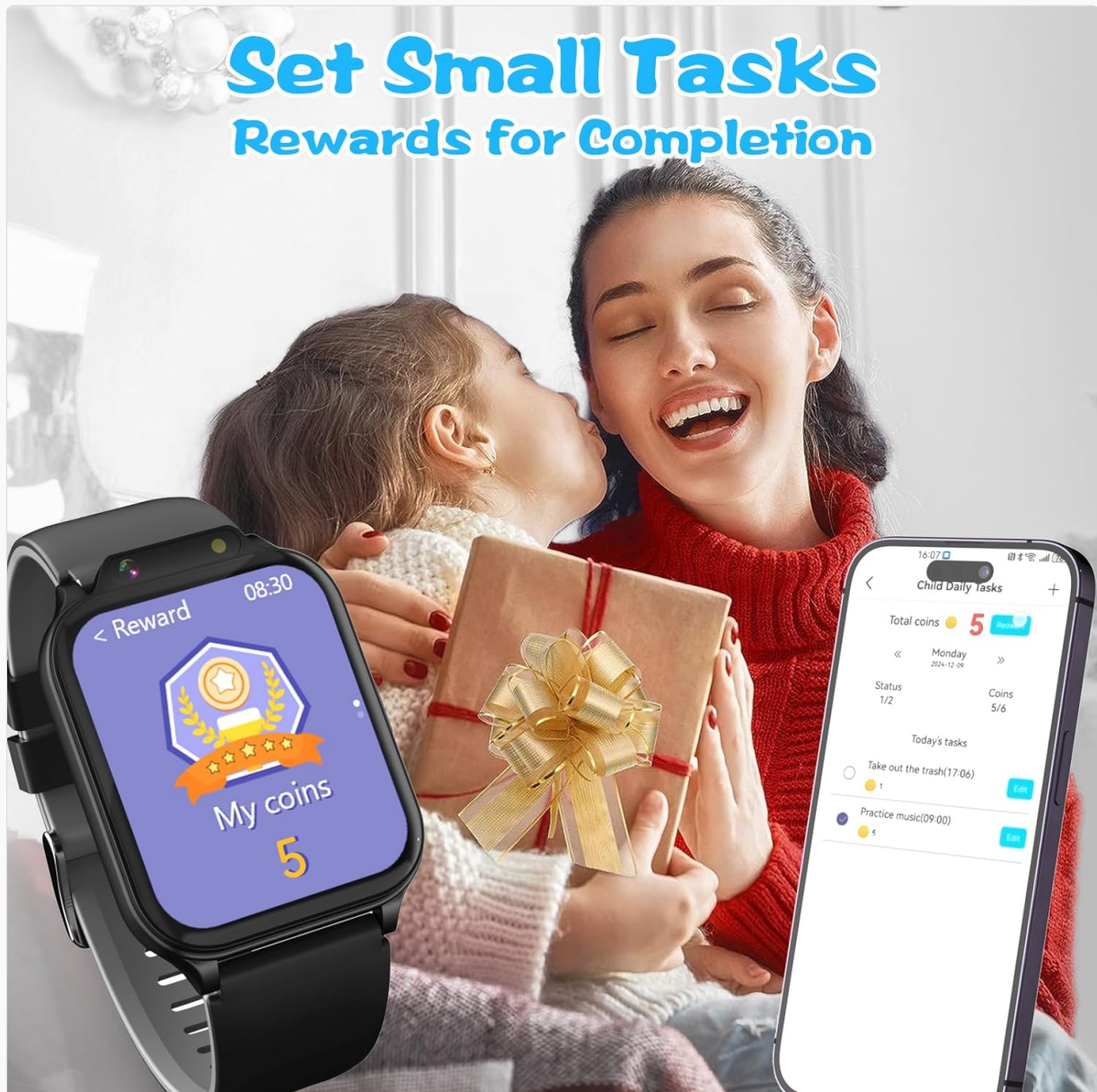
Figure 9: The reward system allows children to earn virtual coins for completing tasks, redeemable for various rewards.