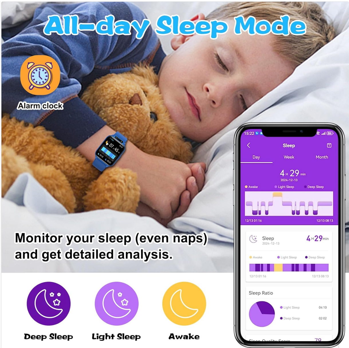
Figure 6: The watch monitors sleep patterns, including light and deep sleep, providing detailed analysis.