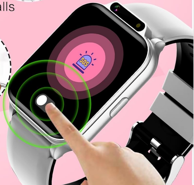
Figure 7: The SOS function can be activated by pressing and holding the side button in emergencies.