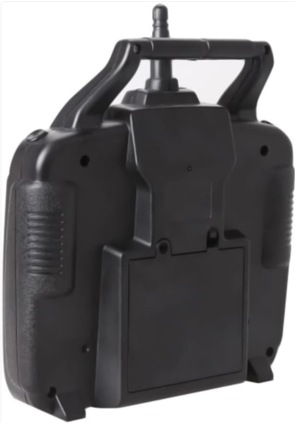
Image: Rear view of the remote control, highlighting the battery compartment for battery installation.