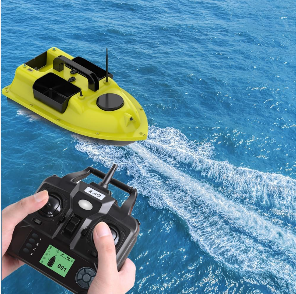
Image: The remote control in use, demonstrating its function in guiding a bait boat across the water.

This section details the functions of the remote control for navigating and operating your GPS fishing bait boat.