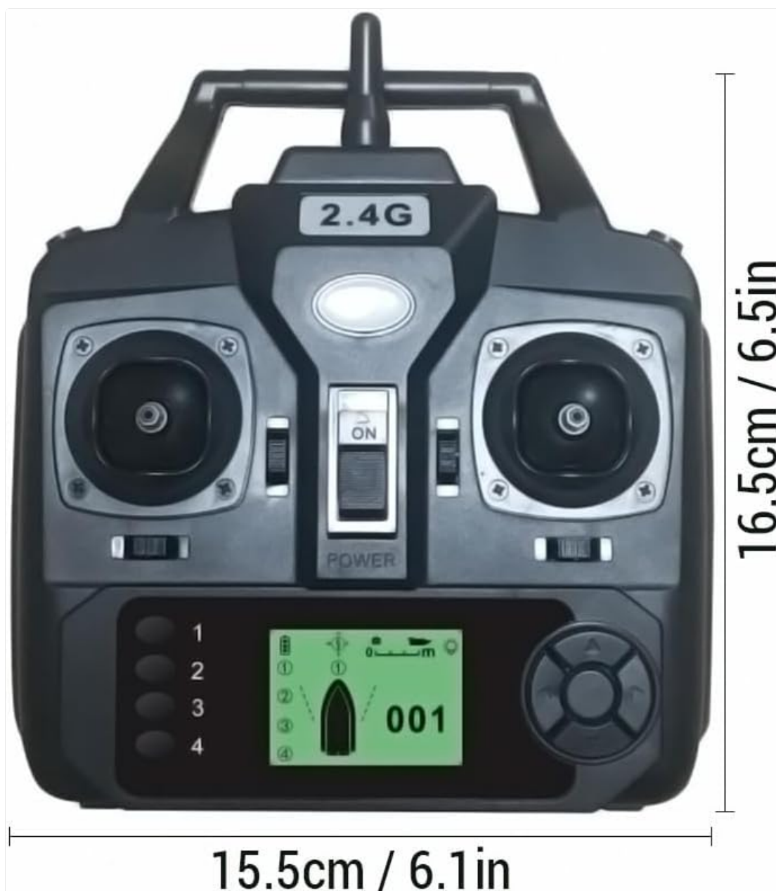
Image: Front view of the remote control, illustrating its physical dimensions for reference.