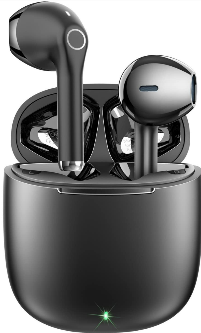
Figure 2: Included components: earbuds, charging case, and USB-C cable.