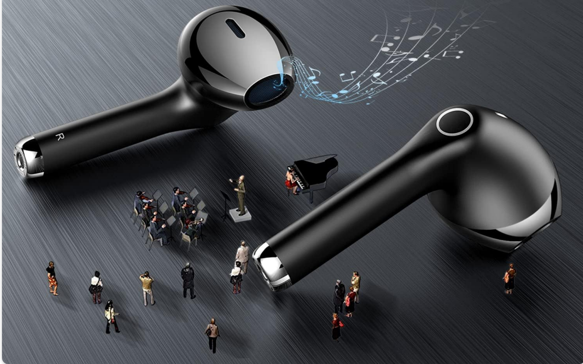
Figure 6: Earbuds designed for superior music quality with strong bass and clear audio.