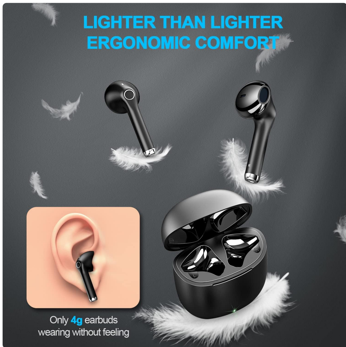
Figure 8: Ergonomic design ensures a comfortable and barely-there feel.