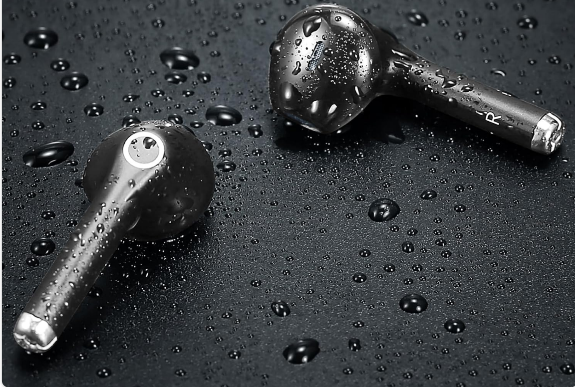
Figure 7: IPX5 water resistance protects against sweat and splashes.