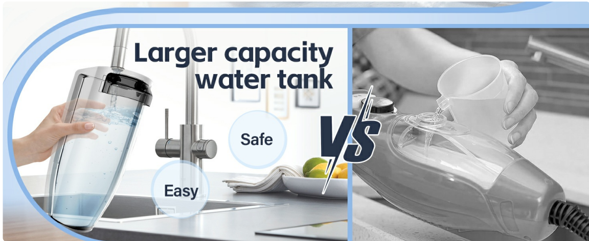
Figure 5: The steam mop features a larger capacity water tank for extended cleaning sessions. Fill the tank with water before use.

Ensure the steam mop is unplugged before filling the water tank. Use the provided measuring cup to add distilled or demineralized water.