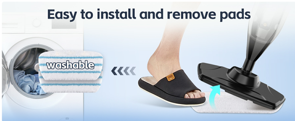
Figure 13: Mop pads are easy to install and remove, and are washable for repeated use.

The microfiber mop pads are reusable and washable. Remove them from the mop head after use and wash them according to their care instructions.