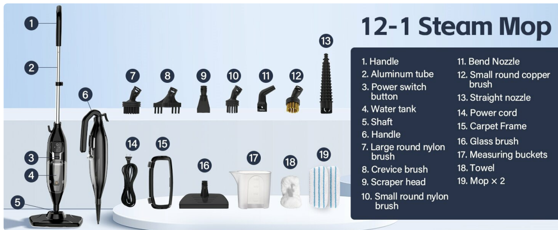
Figure 1: Diagram illustrating the various components and accessories of the 12-in-1 Steam Mop.