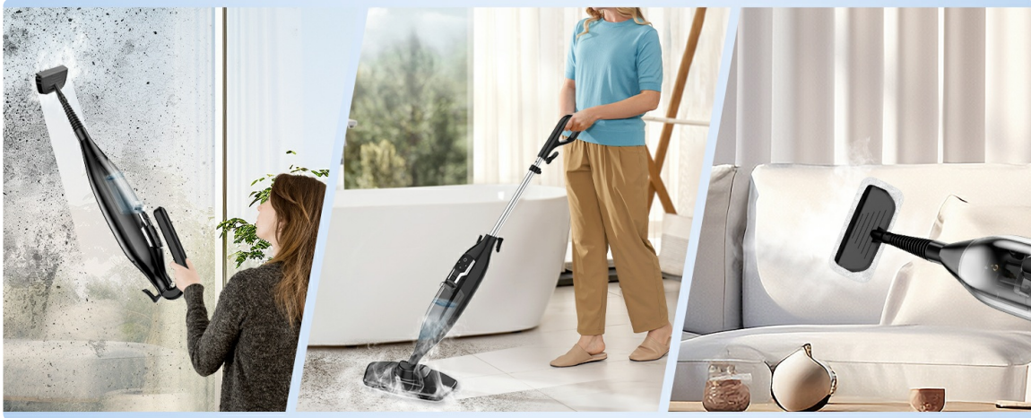
Figure 9: The versatile handheld unit can be used for cleaning windows, refreshing upholstery, and targeting specific floor areas.