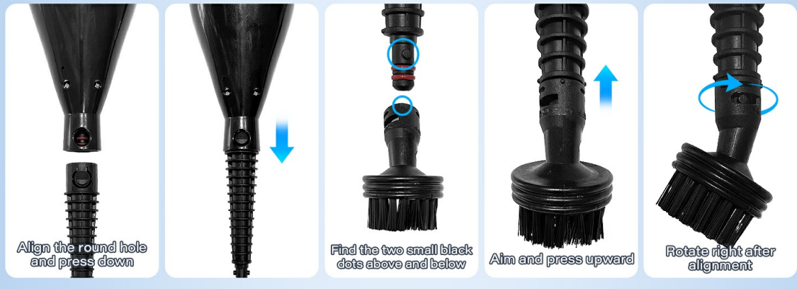
Figure 4: Guide for installing accessories: align the round hole and press down, find the two small black dots, aim and press upward, then rotate right after alignment.