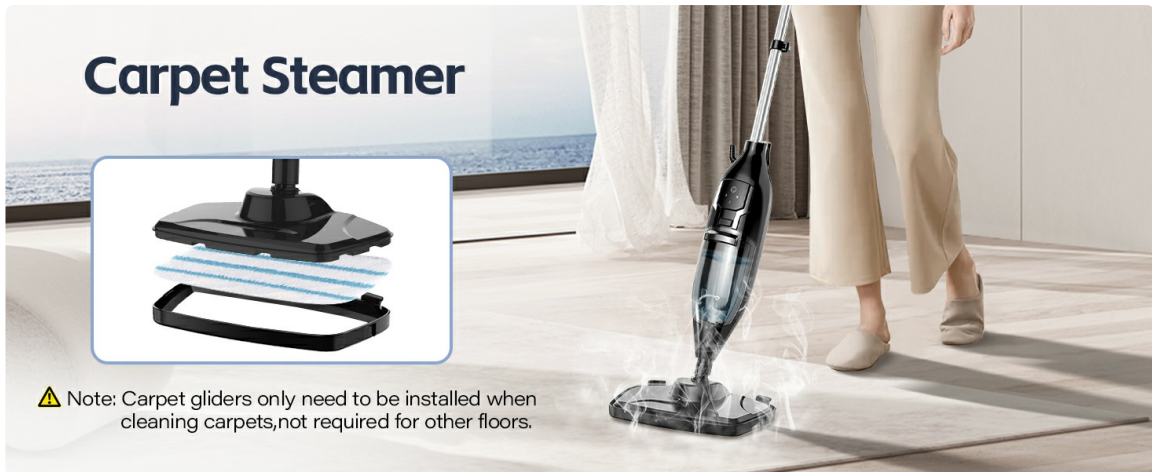
Figure 7: For carpet steaming, attach the carpet glider. Note: Carpet gliders are only needed for carpets, not other floor types.

Attach a microfiber mop pad to the mop head. For carpet cleaning, attach the carpet glider over the mop pad. Move the mop slowly over the surface to allow the steam to penetrate and clean effectively.