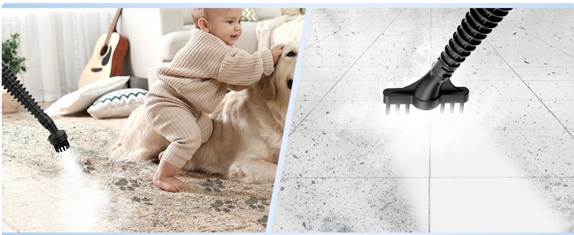
Figure 10: Utilize specialized nozzles for deep cleaning carpets and grout lines on tile floors.