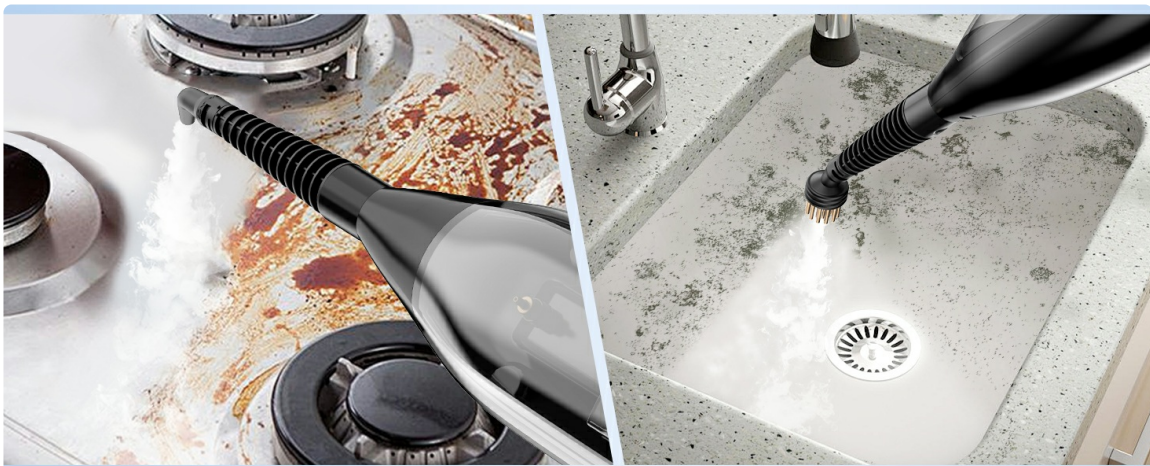
Figure 11: The handheld steamer is effective for sanitizing and cleaning kitchen surfaces such as stoves and sinks.