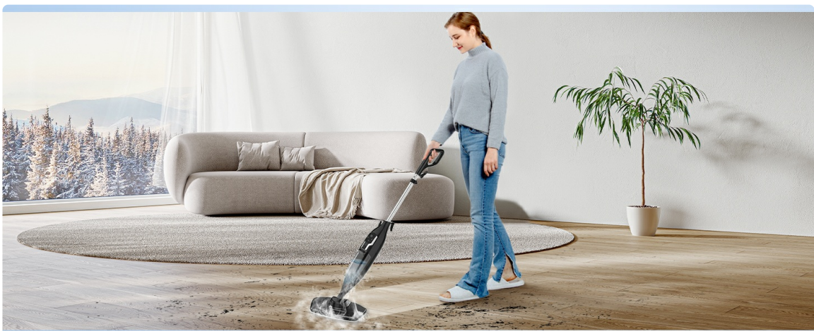
Figure 8: The steam mop effectively cleans various floor types, removing dirt and grime with ease.