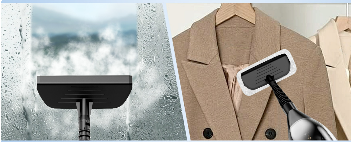
Figure 12: Easily clean windows and refresh garments with the appropriate handheld attachments.

Video 1: This video demonstrates various applications of the Leiksen 12-in-1 Steam Mop, showcasing its versatility for different cleaning tasks around the home.