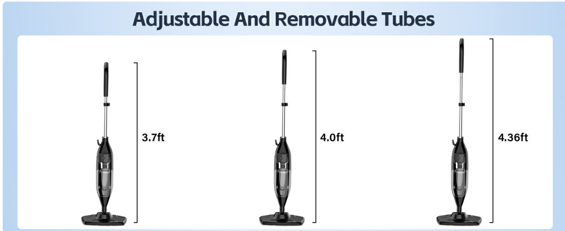
Figure 2: The steam mop features adjustable and removable tubes, allowing for different heights (3.7ft, 4.0ft, 4.36ft) to suit various cleaning needs.

Assemble the main body of the steam mop by connecting the handle and shaft components.