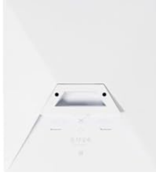
Image: Back view of the Starlink Mini Satellite Dish, showing the kickstand and connection ports.