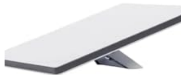
Image: Front view of the Starlink Mini Satellite Dish.