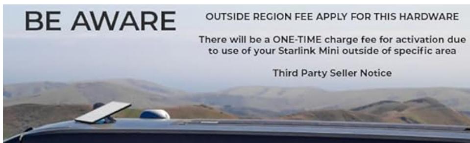
Image: Important notice regarding potential fees for using Starlink Mini outside designated regions or during congestion.

Important Notice: Outside region fees may apply. A one-time activation fee of $300 may be charged for use of your Mini outside a specific area. A one-time congestion fee of $100 may also apply in some areas, which Starlink plans to remove when network capacity improves.