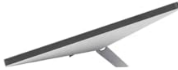
Image: Side view of the Starlink Mini Satellite Dish, highlighting its slim profile.