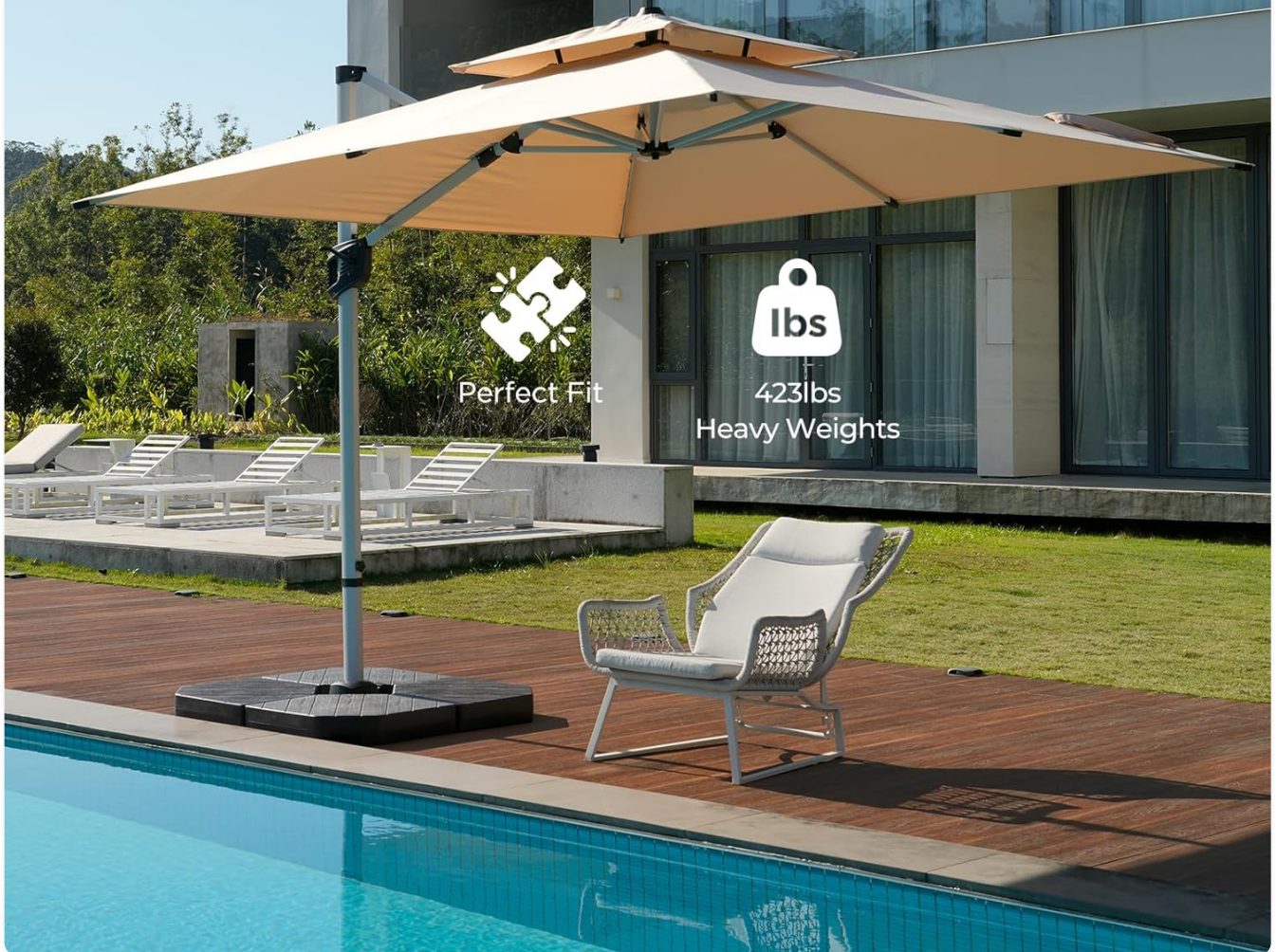
Image: A large cantilever umbrella demonstrating the secure fit and stability provided by the 423lbs base.

423lbs Base Exclusively to Secure Offset Umbrellas