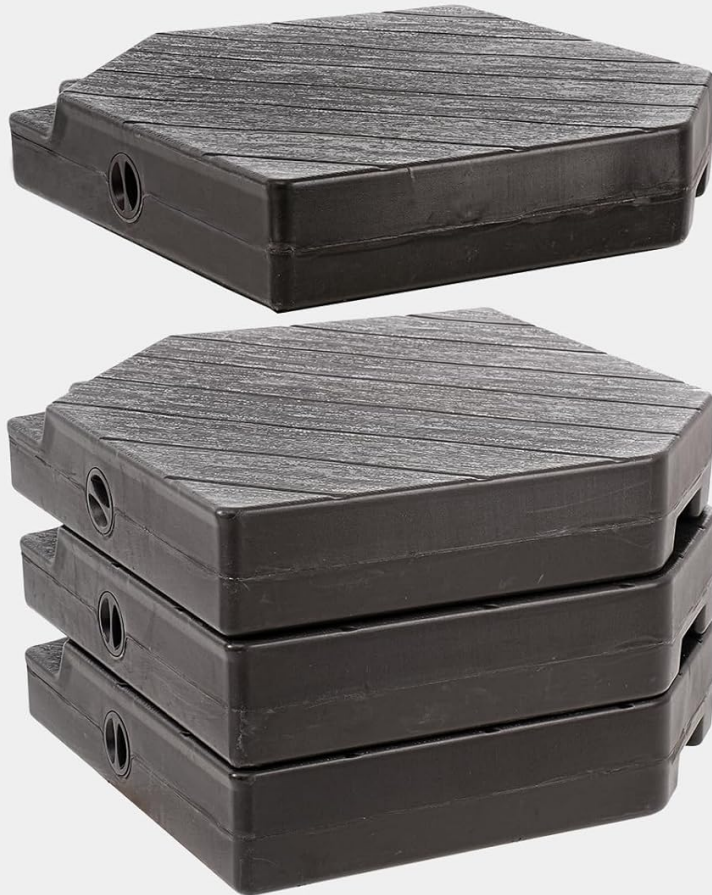
Image: The stackable design of the base plates for easy storage.