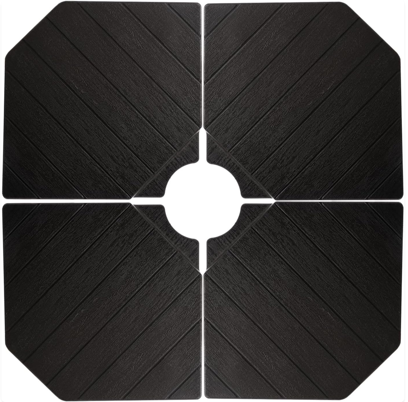
Image: The four-piece design of the HOMSHADE umbrella base, ready for assembly around an umbrella pole.