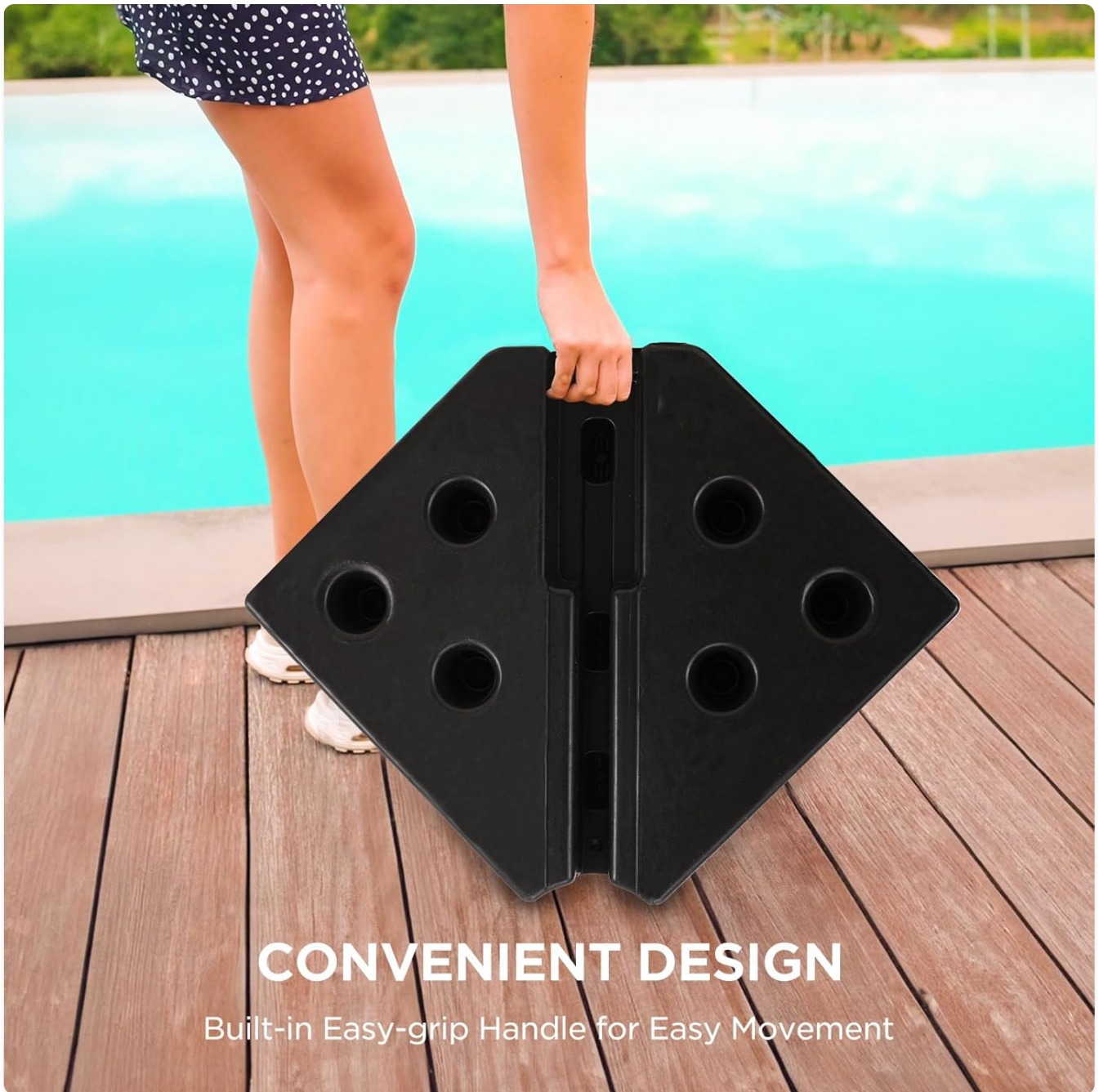
Image: The convenient design of the base with an easy-grip handle for movement.