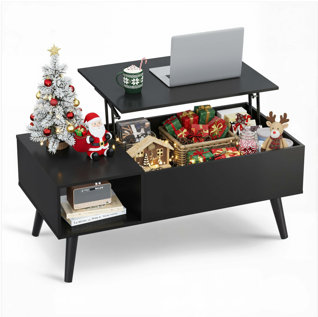
Figure 1: WLIVE 39" Black Lift Top Coffee Table in a living room.