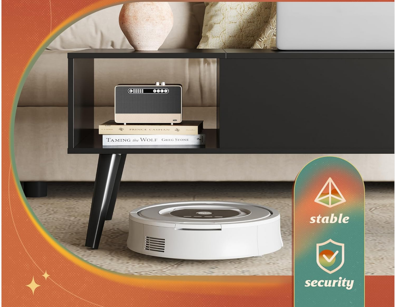
Figure 6: Angled legs for easy cleaning and stability.