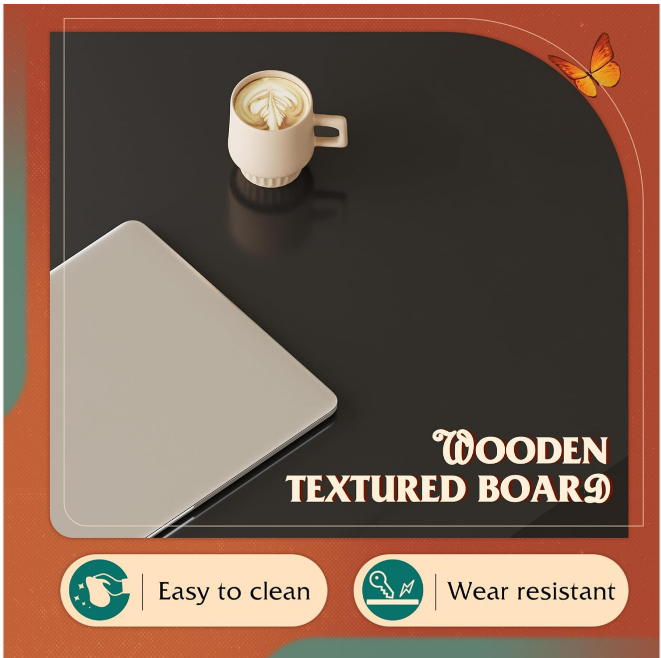
Figure 5: Wooden textured board for easy cleaning.