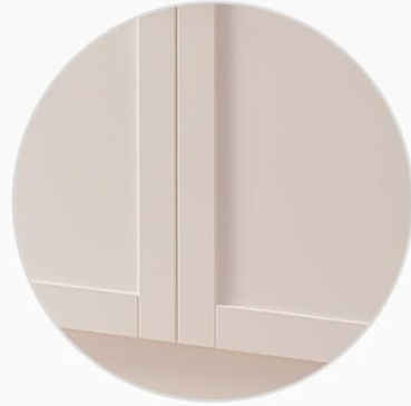
Smooth Engineered Wood Finish