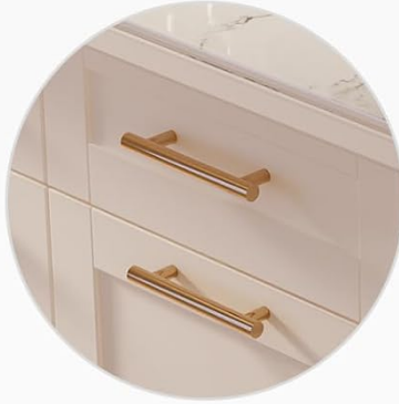
Elegant Gold Hardware Accent