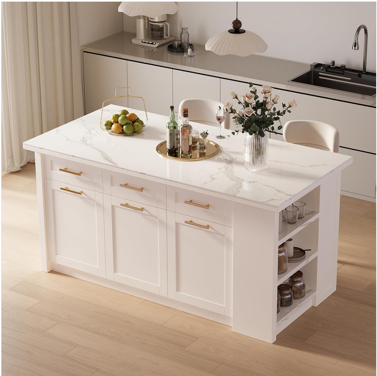
Image: The kitchen island with two bar stools, demonstrating its suitability for seating.