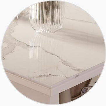
Luxury Unique Stone Texture