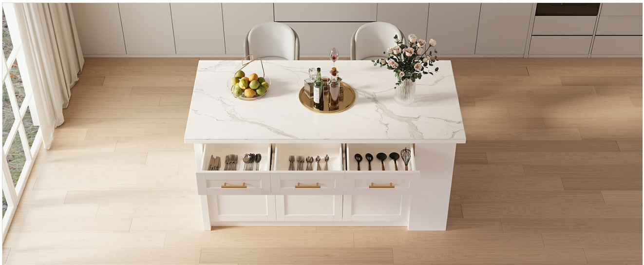
Image: The kitchen island with its top drawers open, revealing organized sections for cutlery and other kitchen utensils.