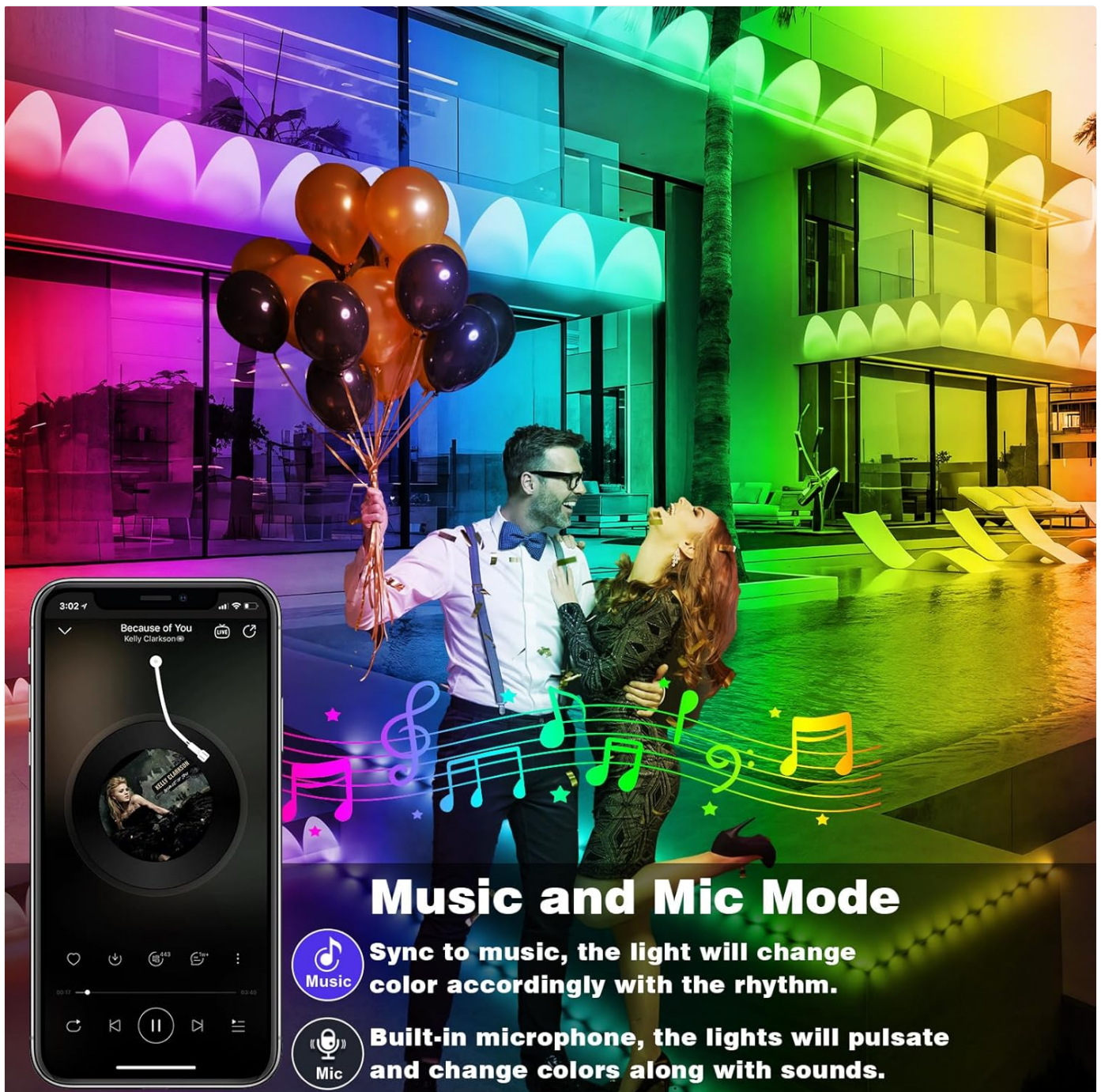
Image: Illustration of the music and microphone mode feature, showing lights pulsating and changing colors in sync with music.