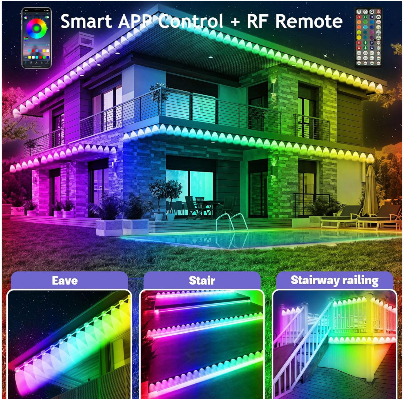
Image: Examples of installation locations including eaves, stairs, and stairway railings, demonstrating the versatility of the lights.

Before installation, plan the layout of your lights. Consider the length of the light string (500FT) and the areas you wish to illuminate, such as eaves, stairs, or deck railings. Ensure the chosen surface is clean, dry, and suitable for mounting.