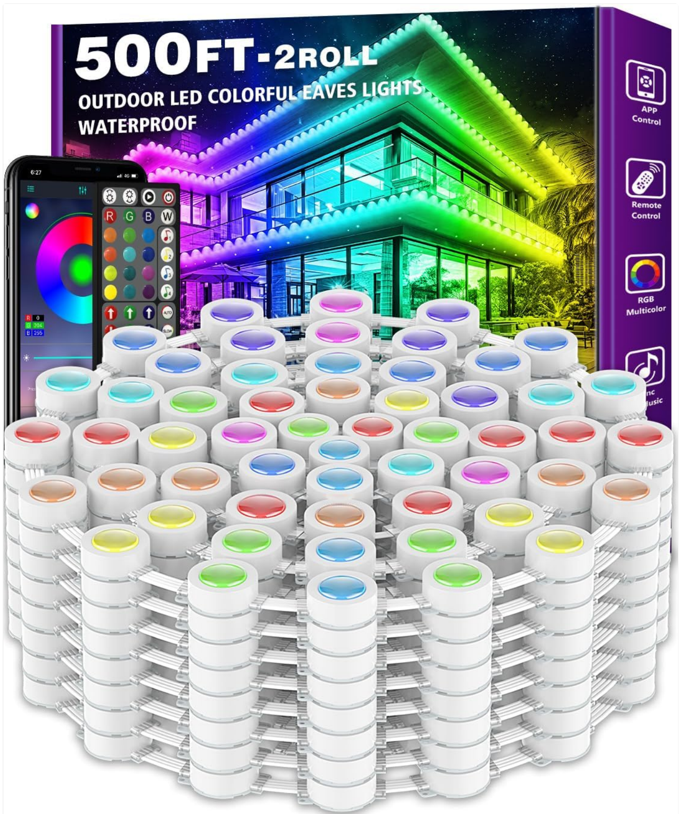
Image: Overview of the FBZ 500FT Permanent Outdoor RGB Lights, showing the light strings, control box, and remote control.