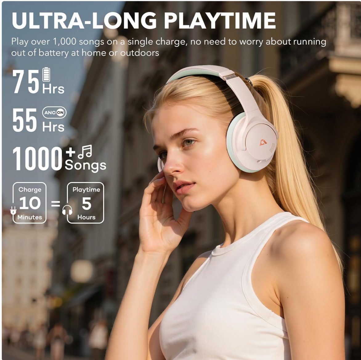
Image: Visualizing the long battery life and quick charge capability of the headphones.