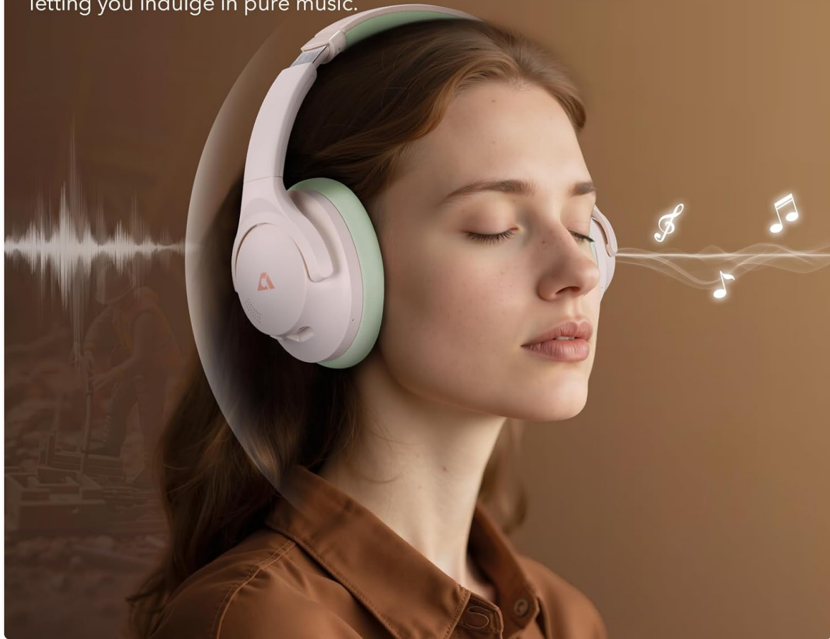
Image: A visual representation of the headphones reducing ambient noise by up to 90%.

Hybrid active noise canceling helps reduce 90% ambient noise, letting you indulge in pure music.