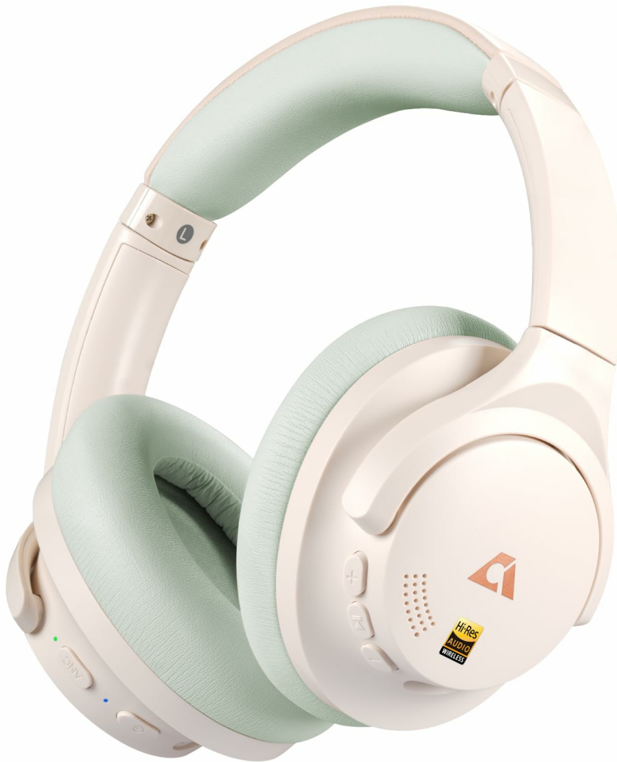
Image: 1Mii AI Y8+ Noise Cancelling Headphones, showcasing the beige green color variant.