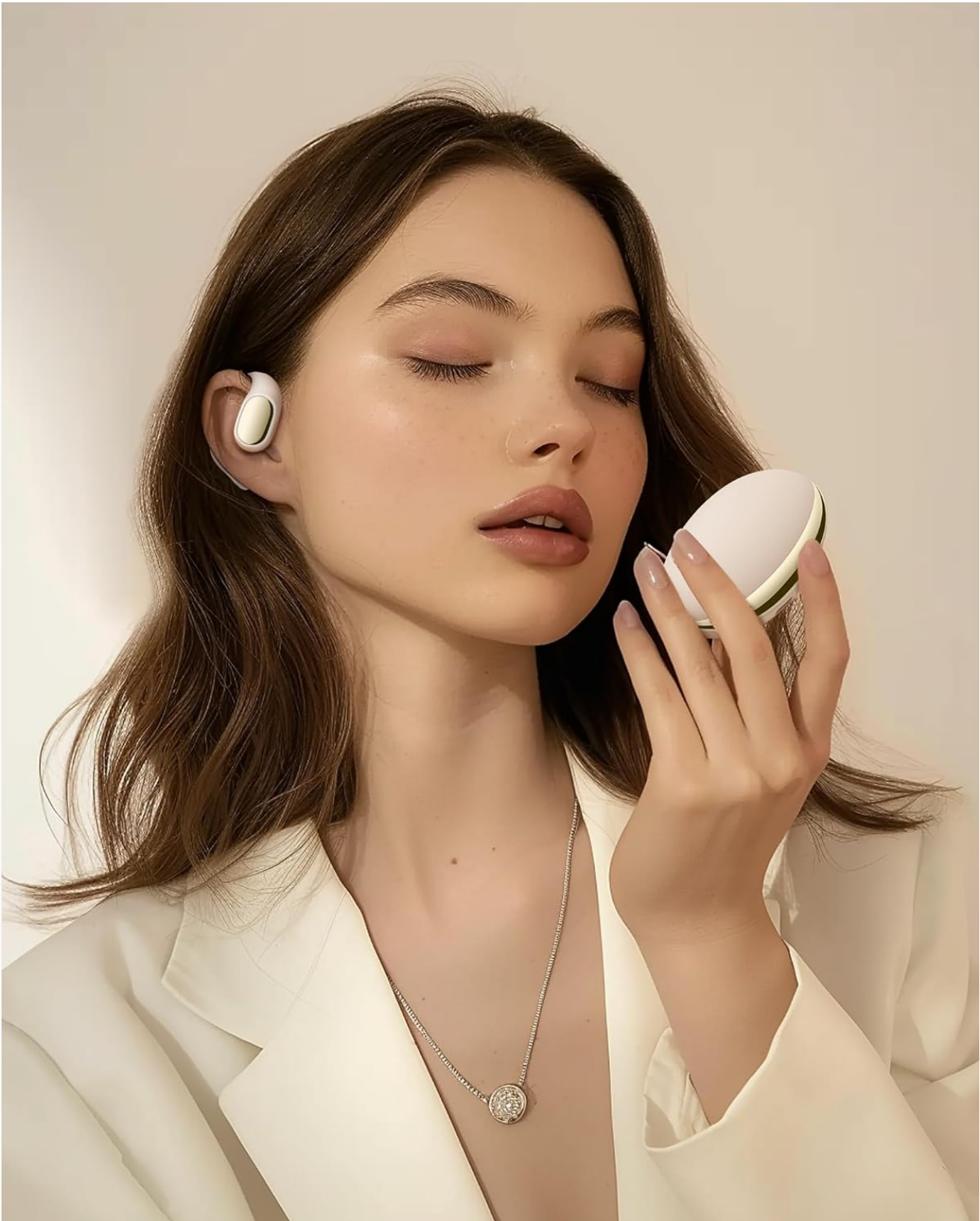
Image: The earbuds and their charging case, visually representing the impressive battery life of 6 hours per single charge and 60 hours total with the case.