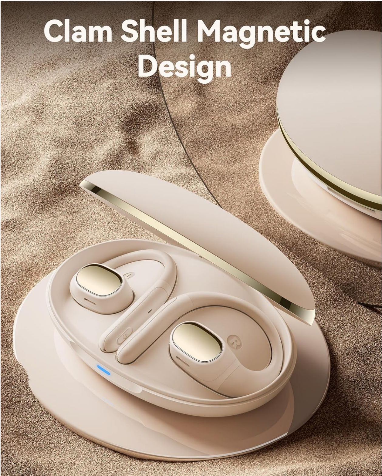
Image: The PocBuds V30 charging case, open to reveal the earbuds, highlighting its clamshell design and magnetic closure. Each V30 earbud weighs only 6g (0.2 oz), providing an ultralight experience for extended wear. The ear hooks are crafted from soft, flexible silicone, designed to ensure comfort even when wearing glasses or cycling goggles.