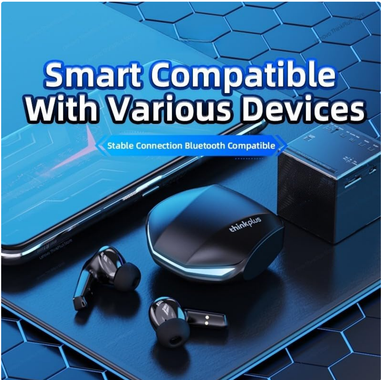
Figure 4: The GM2 Pro earbuds shown alongside a smartphone and a portable speaker, demonstrating their broad compatibility with various Bluetooth-enabled devices.

Note: The earbuds will automatically reconnect to the last paired device when taken out of the case, if Bluetooth is enabled on the device.