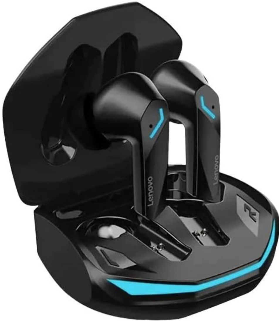
Figure 1: GM2 Pro Wireless Earbuds in their charging case. This image shows the sleek black design of both the earbuds and the compact charging case, with blue LED accents visible.