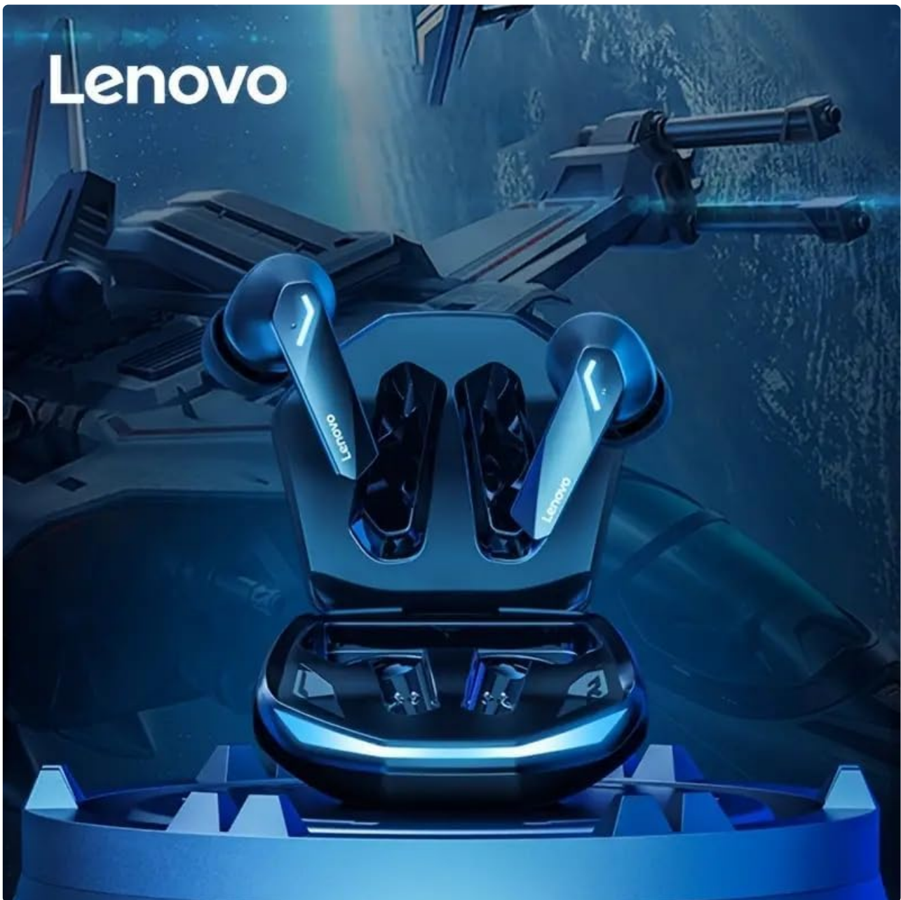
Figure 2: Close-up of the GM2 Pro Earbuds and charging case, highlighting the distinctive blue LED lighting that illuminates when the case is opened or closed, giving them a futuristic appearance.