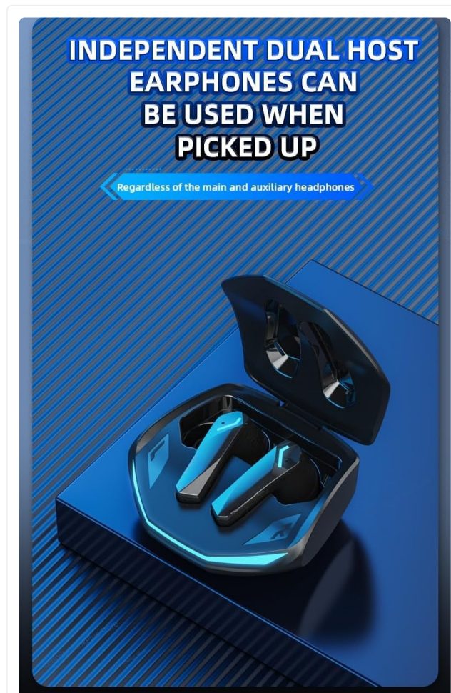
Figure 5: This image illustrates the "Independent Dual Host" feature, showing the earbuds in their case with a blue glow, emphasizing that each earbud can be used independently.