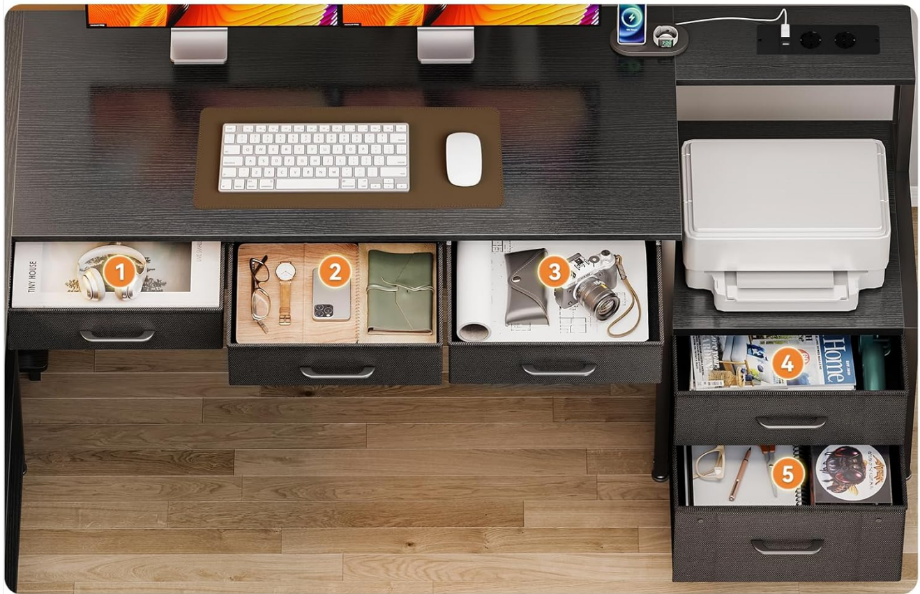
Figure 5.4: Five Storage Drawers