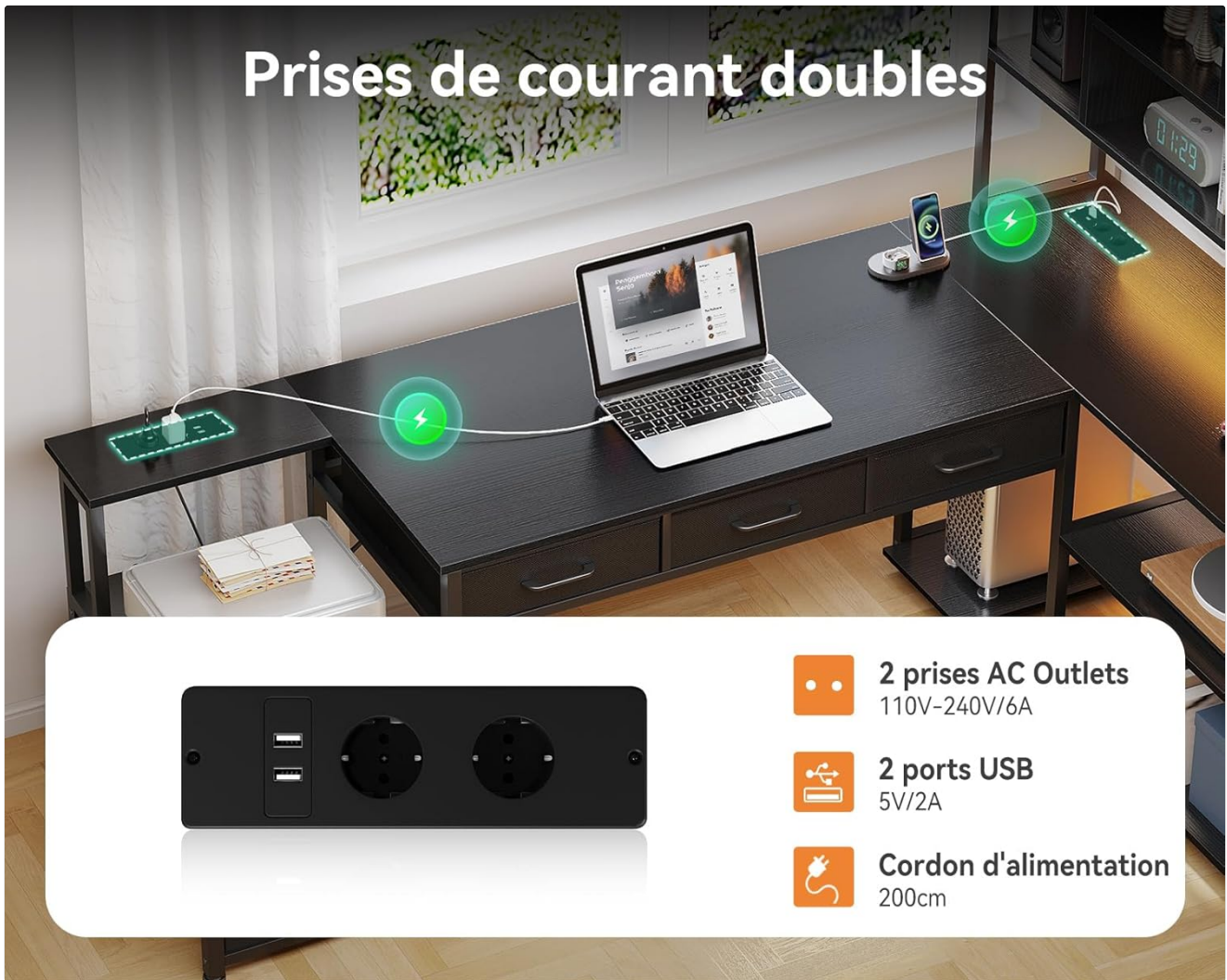
Figure 5.3: Integrated Double Power Outlets