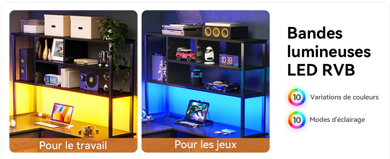
Figure 5.2: LED Color and Mode Variations