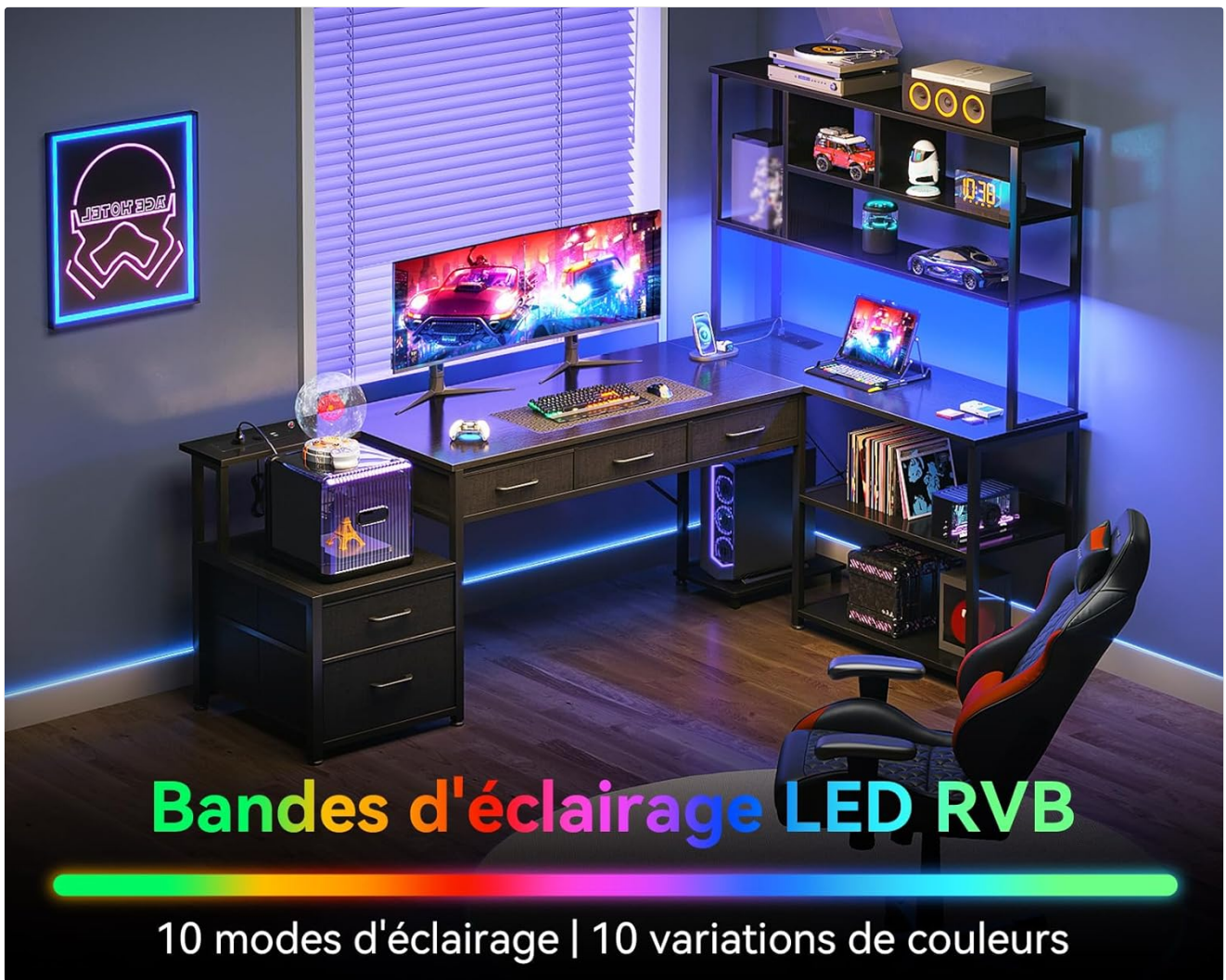
Figure 5.1: Dynamic LED Lighting