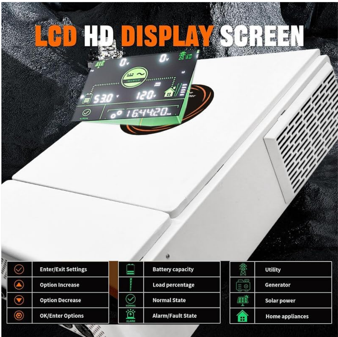
Image 5: Close-up view of the inverter's LCD HD display screen and control buttons. The display shows various operational parameters, while the buttons are labeled for functions like Enter/Exit Settings, Option Increase, Option Decrease, and OK/Enter Options. Icons for battery capacity, load percentage, utility, generator, solar power, and home appliances are also visible.