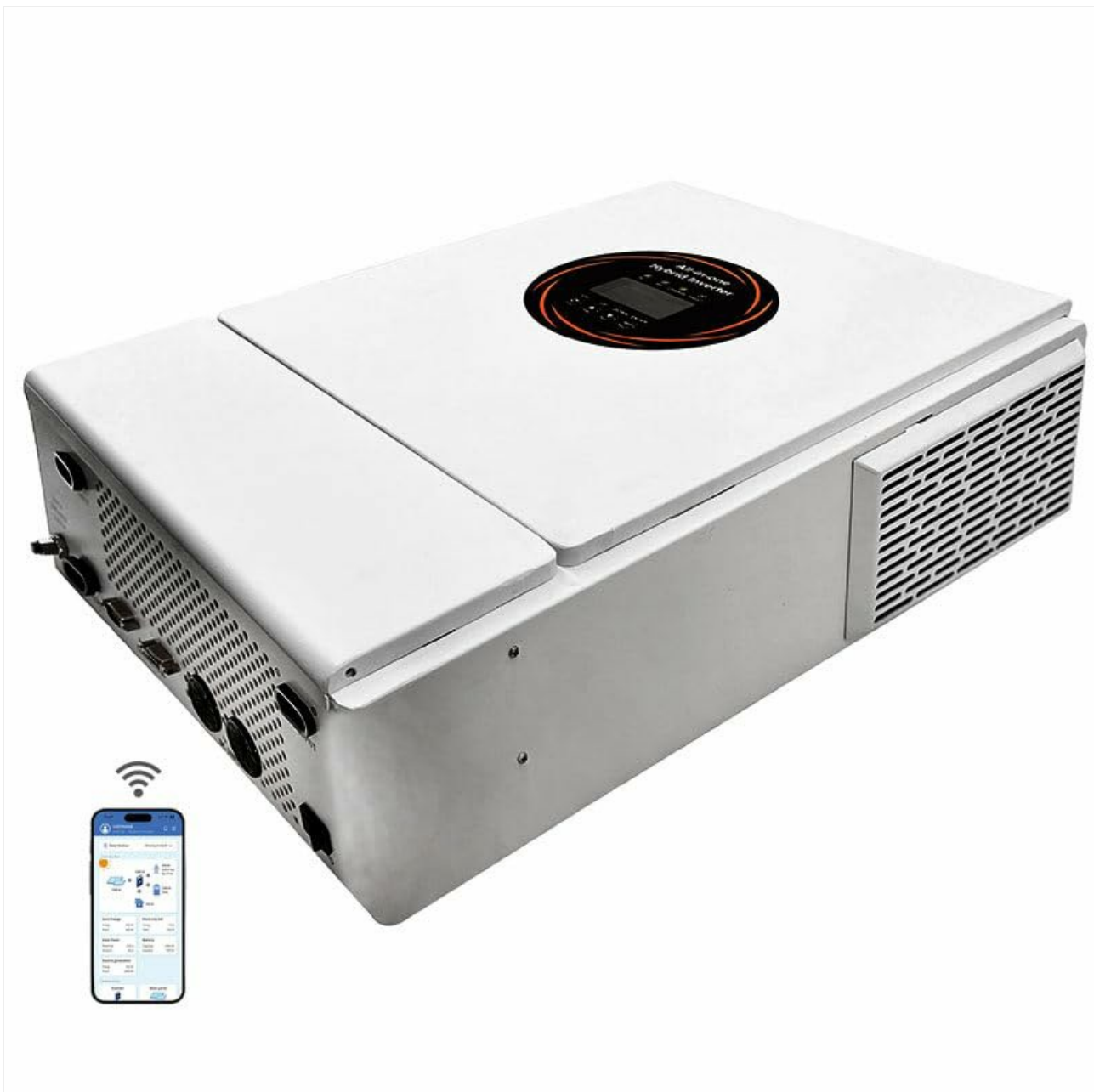
Image 1: Front view of the WEIMILOR 5500W Solar Inverter. This image displays the compact design and the integrated LCD screen on the front panel.