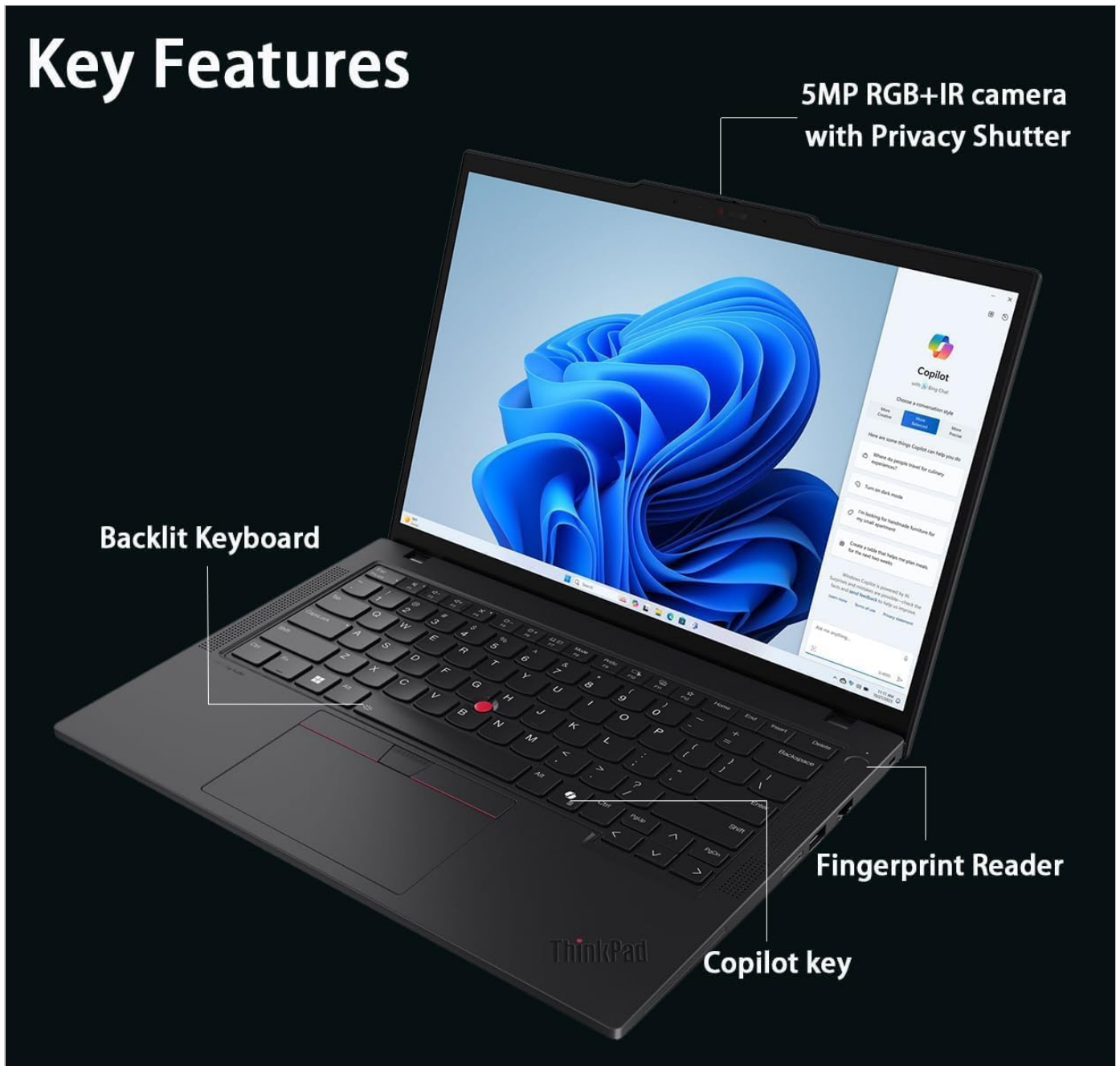
Image: Close-up view of the laptop's keyboard area, highlighting the backlit keyboard, fingerprint reader, and Copilot key.