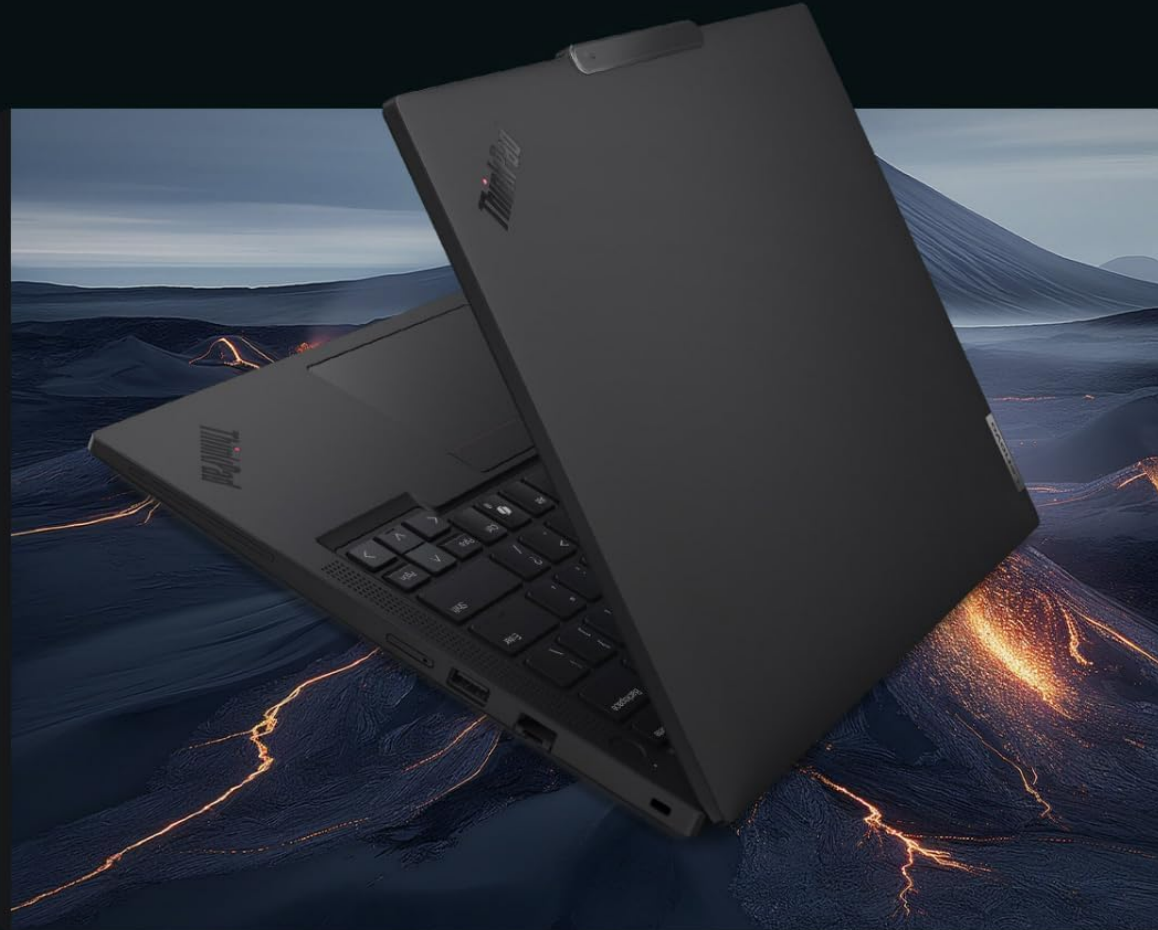
Image: Illustrates the portability of the Lenovo ThinkPad T14 Gen 5, showing its weight (2.9 lbs) and thickness (0.7 inches).