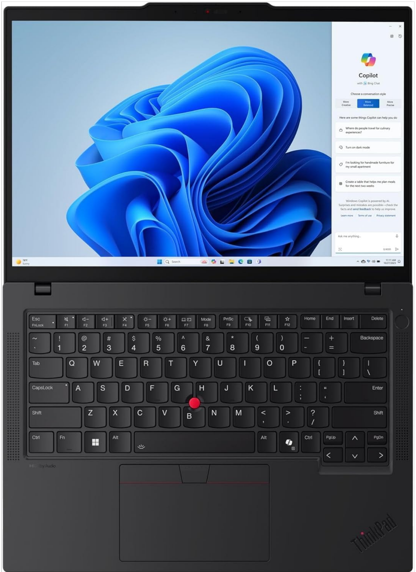
Image: The Lenovo ThinkPad T14 Gen 5 laptop displaying the Windows 11 Pro desktop with the Copilot interface active.