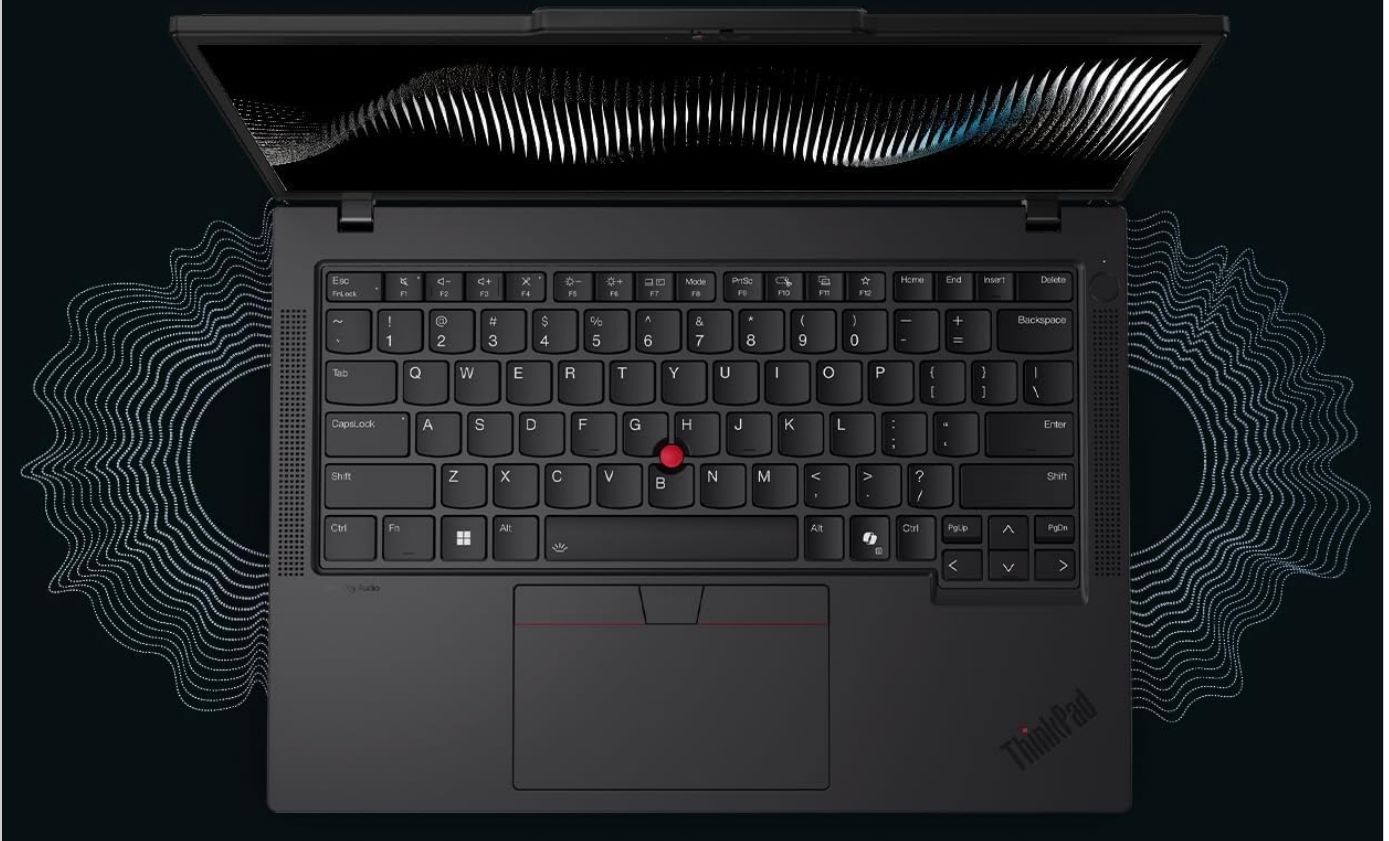
Image: Visual representation of the multimedia capabilities of the Lenovo ThinkPad T14 Gen 5, highlighting Dolby Audio and Realtek ALC3287.