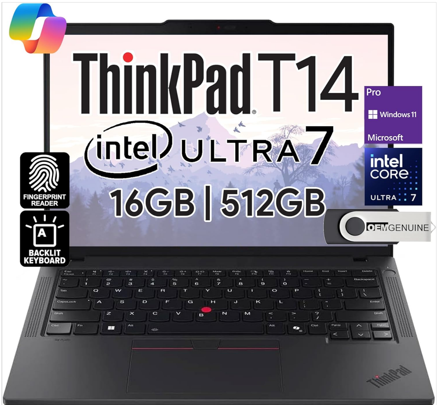
Image: Front view of the Lenovo ThinkPad T14 Gen 5 laptop, showcasing the display, keyboard, and trackpad.